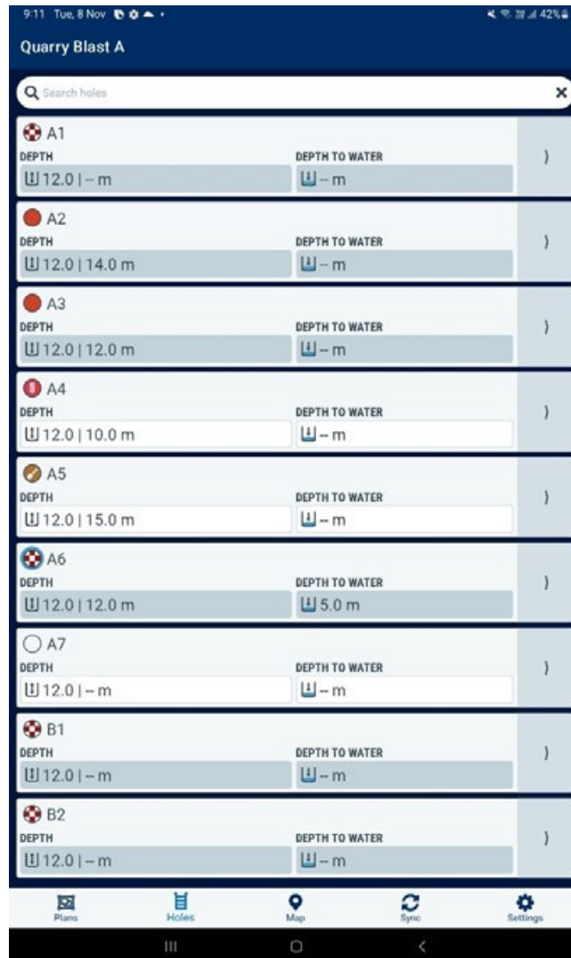
Collect data on bench with BlastIQ™ Mobile Lite