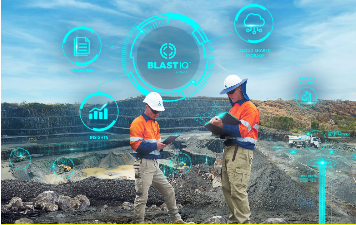
Streamlined and improved blasting through BlastIQ™ Quarry smart and Integrated solutions