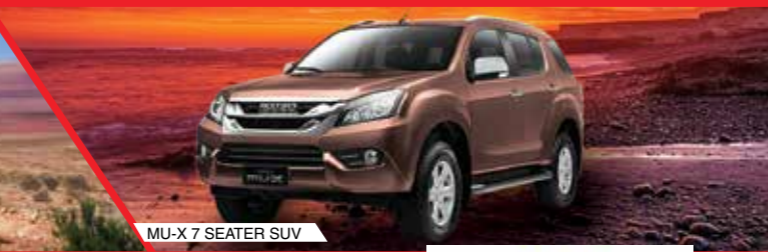
MU-X 7 SEATER SUV