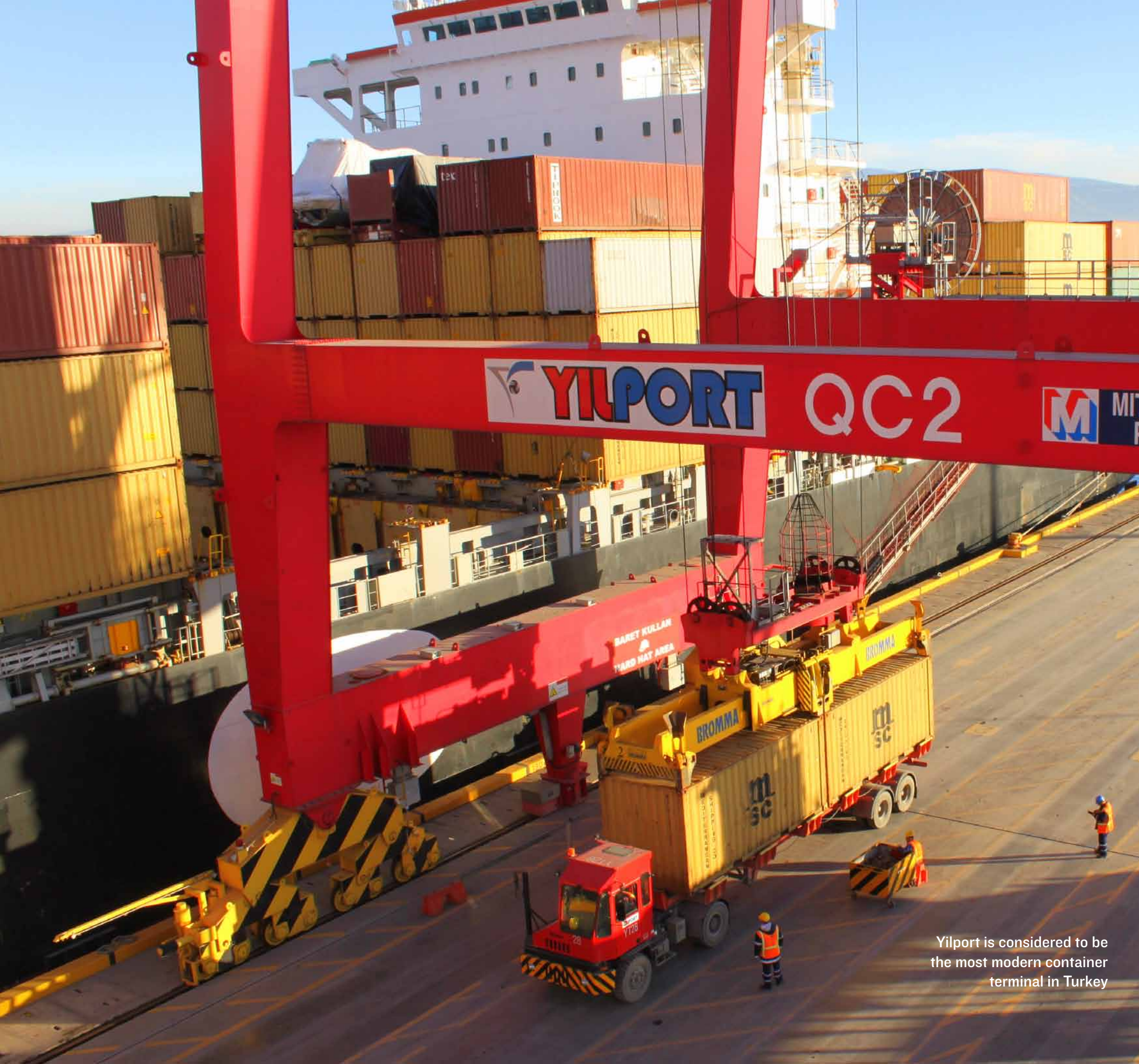
Yilport is considered to be the most modern container terminal in Turkey

Among the major trends driving the business forward today is investment in new