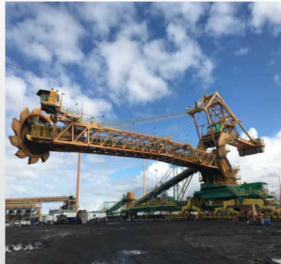
QCA is proud to be a significant contributor to the Westshore upgrade project, providing electrical engineering, automation, supply of industrial power & control systems.

QCA Systems Ltd. Toll Free: 1.877.940.0868 | Office: 604.940.0868 sales@qcasystems.com http://www.qcasystems.com/