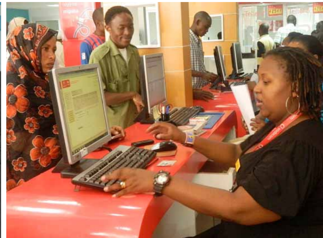
Vodacom Tanzania is opening up customer shops across the country in order to serve its customers effectively