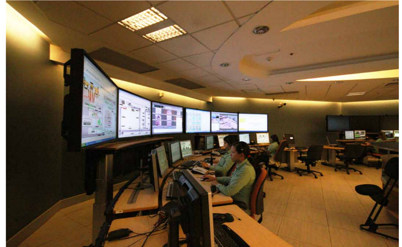
Operational Control Center in Carajás

and spiral classifiers. The end result is three classes of products, these being sinter feed, pellet feed and lump ore. Now spanning five simultaneous open-pit mine operations, the Carajás Mining Complex produces approximately 300,000 metric tonnes of iron ore per day and was responsible for producing a record 109.8 million metric tonnes in 2011, an increase of 8.5 percent on the year before.