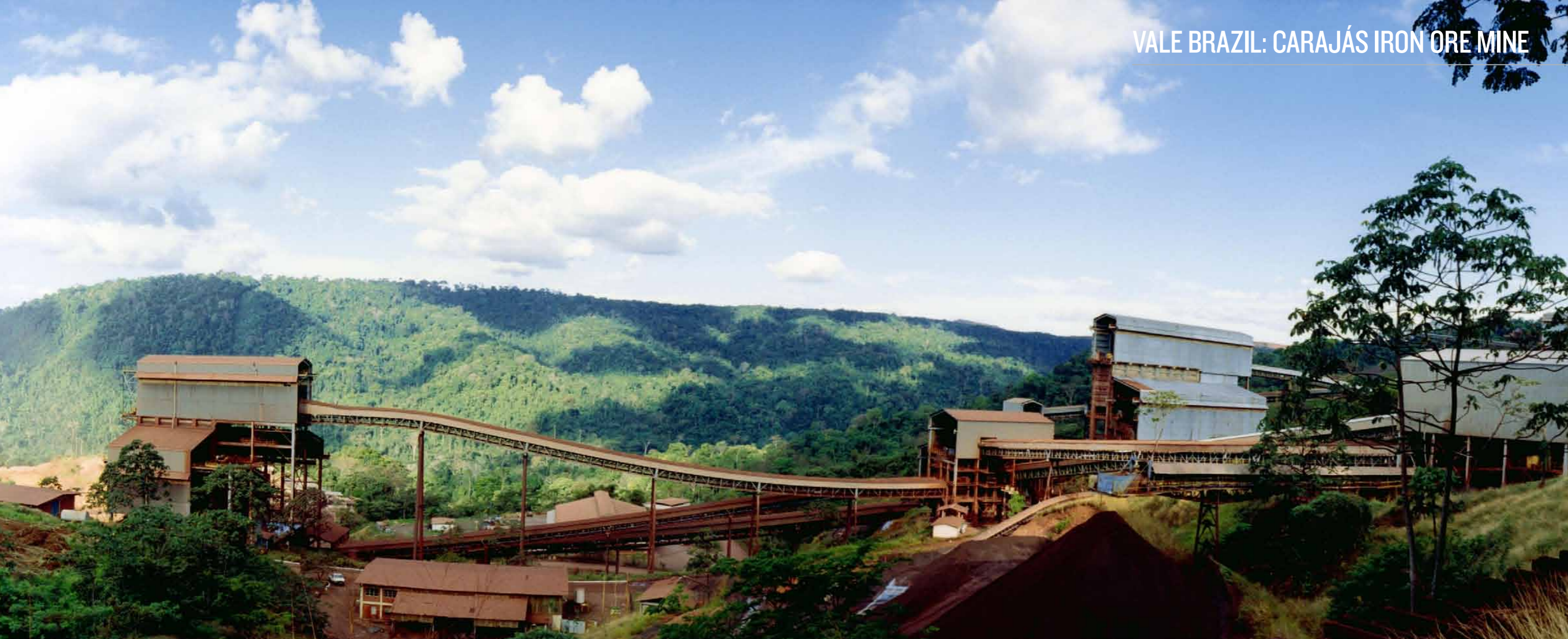
Iron ore beneficiation plant

evaluates aspects such as air quality, noise pollution, vibrations and water quality.