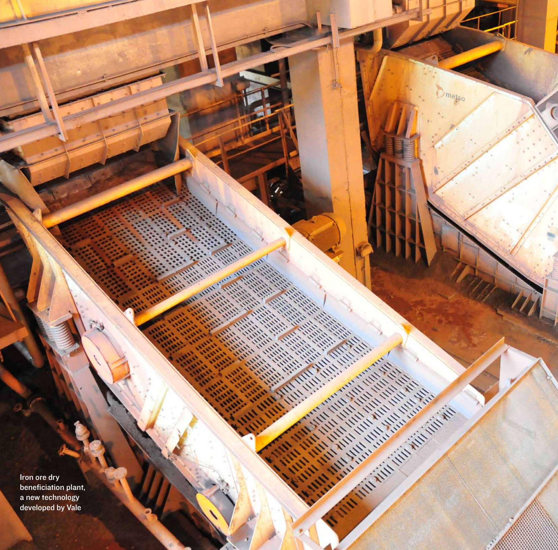
Iron ore dry beneficiation plant, a new technology developed by Vale

At this stage, the ore is crushed once more and classified using screens, cyclones