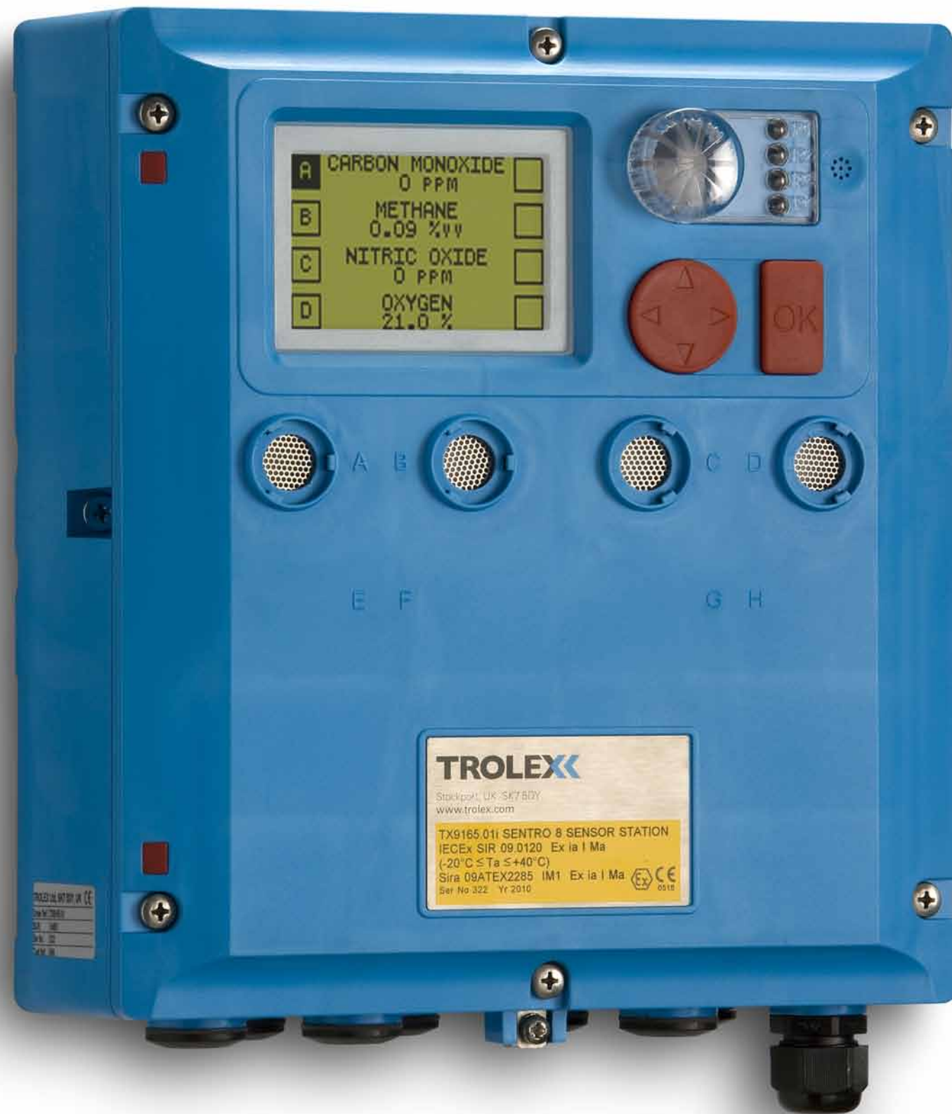
Sentro 8 Sensorstation

“Last year we appointed three distributors in China and we have established a sales and technical office in Shenzhen so that we have technical staff on the ground there who speak the language and understand the culture.”