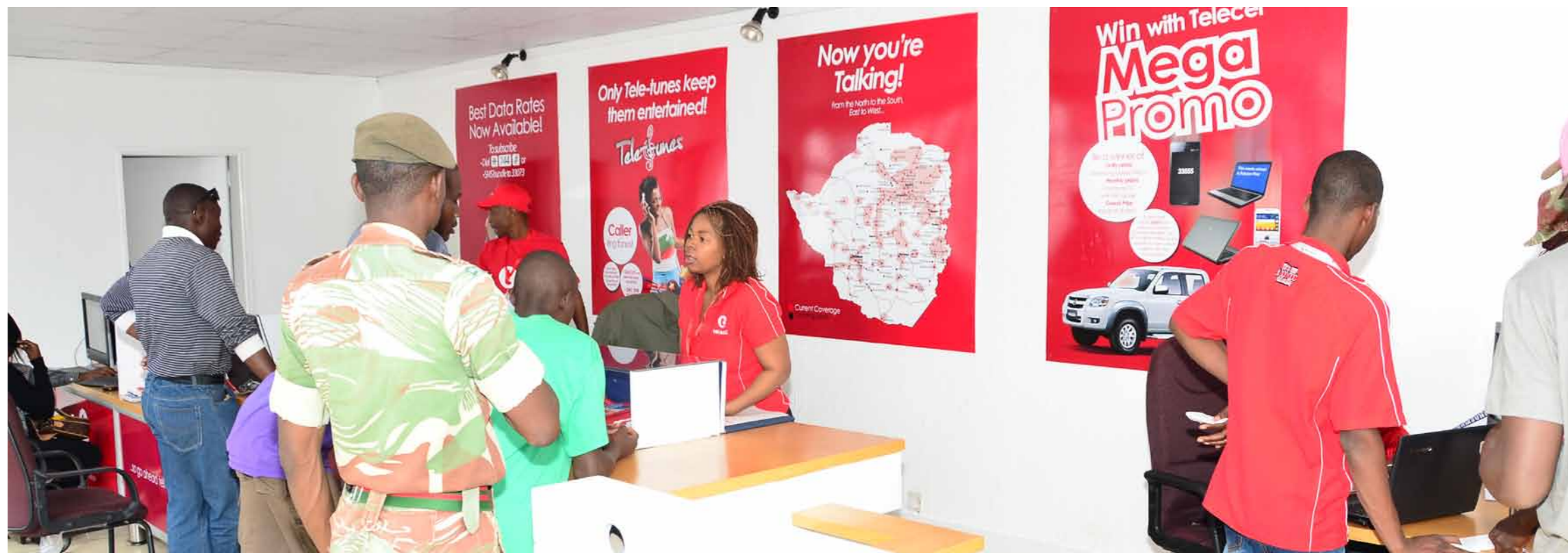
Telecel Zimbabwe pursues the vision of total customer delight

“Another thing we are doing,” Mawindi states, “is enhancing our 3G coverage to the extent where we hope to have around 275 sites located countrywide. To date, the roll-out programme is on track and proceeding well, with all the major cities, towns, rural service centres and highway corridors being covered, and efforts are under way to cover a sizable