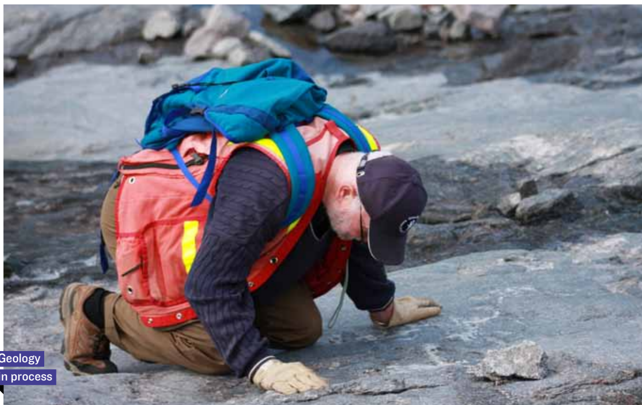
Geology in process

as a mystical stone, it has no bulk value, though that may be about to change.