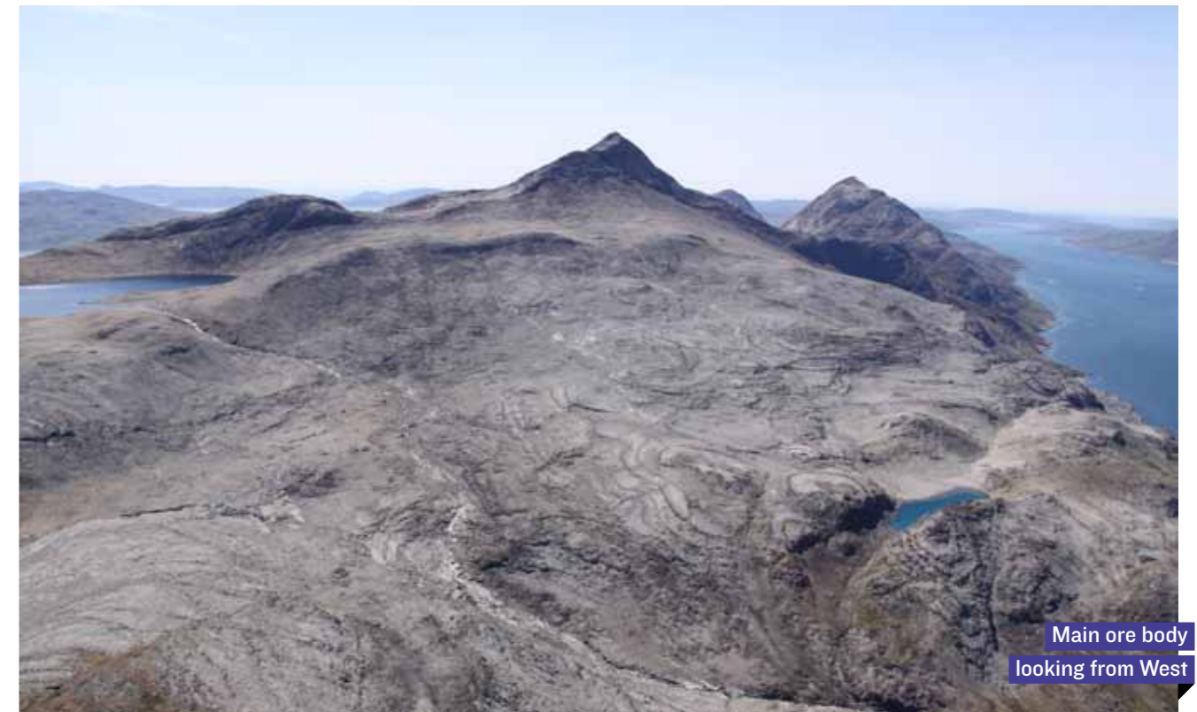
Main ore body looking from West

“The Danish Technological Institute has done some research into the use of arfvedsonite as a substitute for sand when making bricks and roof tiles”