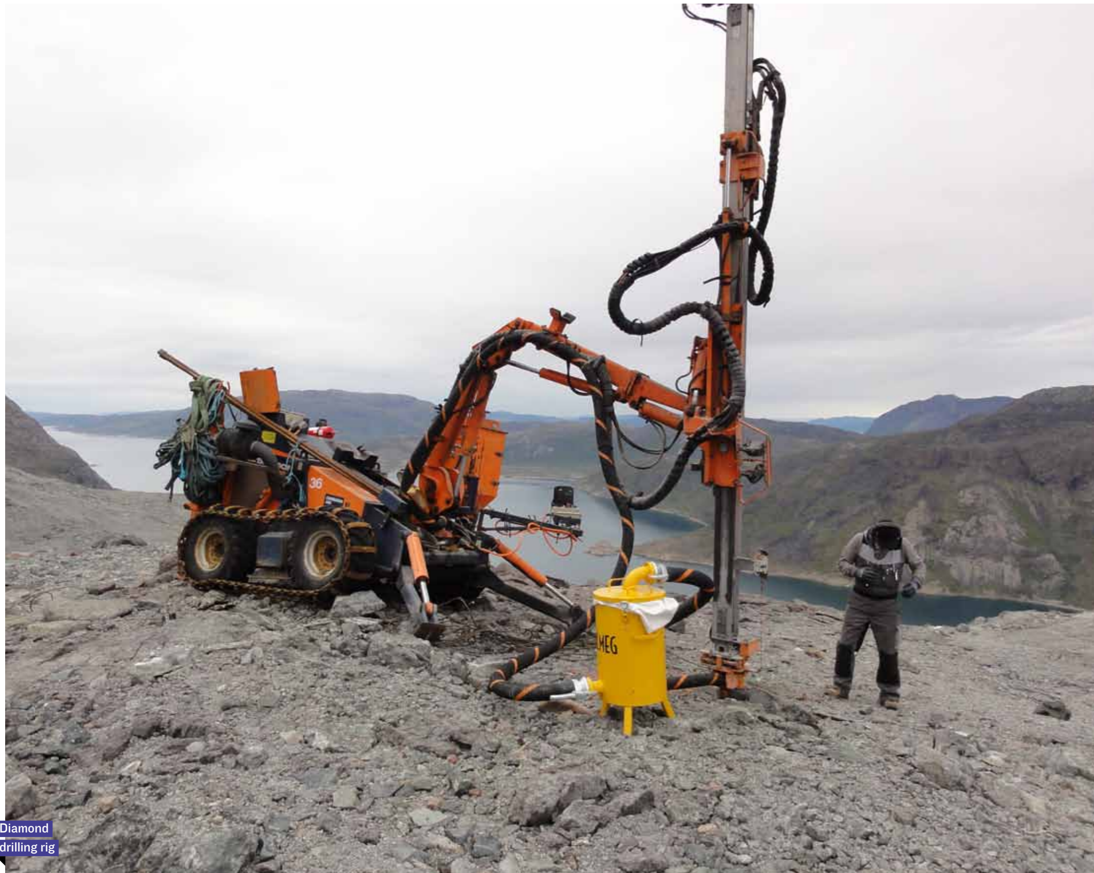
Diamond drilling rig

Rare earth elements (REEs) continue to be a hot topic. This group of 17 chemically similar elements crucial to the manufacture of many hi-tech products is causing international supply headaches. China currently produces about 90 percent of the world's rare earths and produces more than 70 percent of the world's rare earth magnets - neodymium in particular is used to make smaller, more efficient and more powerful magnets used in loudspeakers and computer hard drives. In order to curb environmental degradation and protect resources, China has set output ceilings, export quotas and stricter emissions standards as well as high resource taxes for some ores. By restricting exports and driving up prices China can effectively force companies to manufacture devices that need to incorporate rare earths in its own factories. However, the World Trade Organization ruled that China's export duties, quotas, and administration of rare earths, tungsten and molybdenum products were inconsistent with WTO rules.