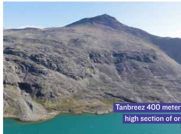
Tanbreez 400 meters high section of ore

Kakortokite is named after Qaqortoq, the nearest settlement to Tanbreez, precisely because it is a mineral not found anywhere else. The legislation, he thinks, should be framed to reflect the reality on the ground, rather than trying to make the deposit fit the legislation! Recent drilling at the site has shown that it contains at a deeper level other REE-bearing structures that may include different minerals, but each time a variation