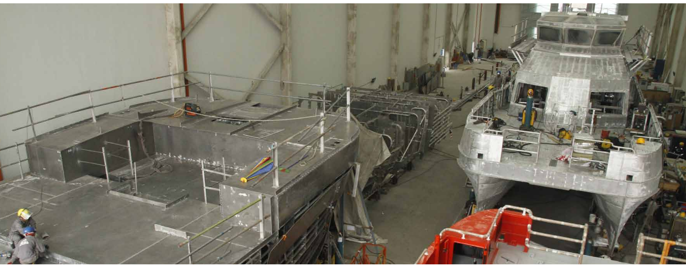
Strategic Marine provides its clients with turnkey shipbuilding, planned maintenance and ship repair services

The company's move into the offshore wind sector went a step further in May 2012, when it announced the signing of a sales and