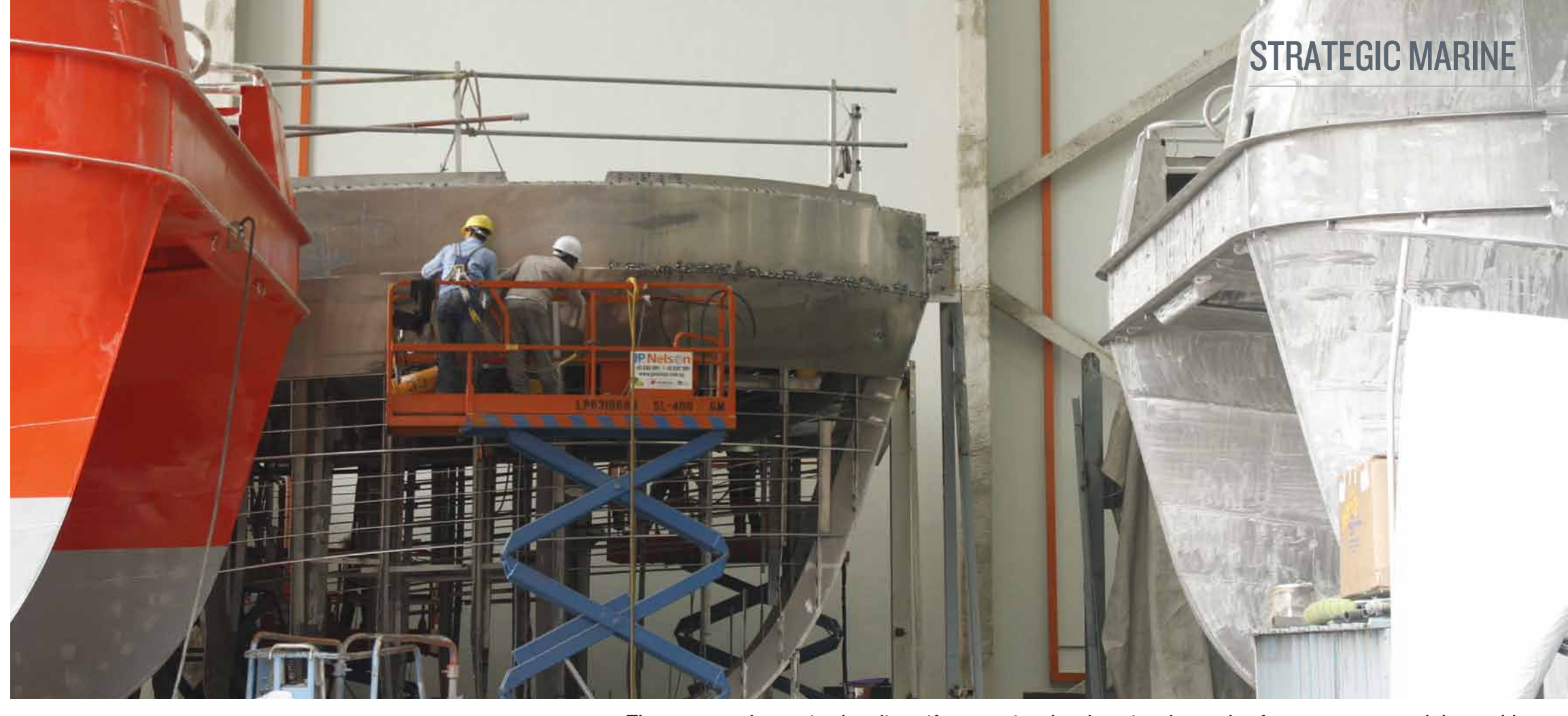
The company has strived to diversify to service the changing demands of customers around the world

each of these locations, the industry sectors in which Strategic Marine has been experiencing the greatest levels of growth include the military and oil and gas.