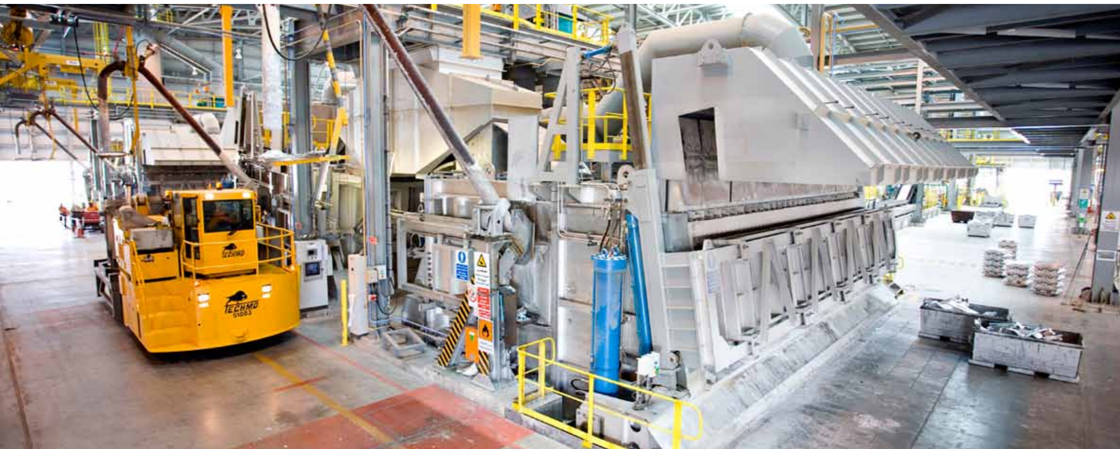
Sohar aims to be a role model for industry in the Gulf

And these principles extend beyond the direct workforce. Last year Oman's Public Authority for Craft Industries (PACI) has signed a memorandum of understanding with Sohar Aluminium to set up a training centre for aluminium craft work on the company's premises. The two-year training programme aims to enable women to become entrepreneurs and produce aluminium handicrafts. According to the