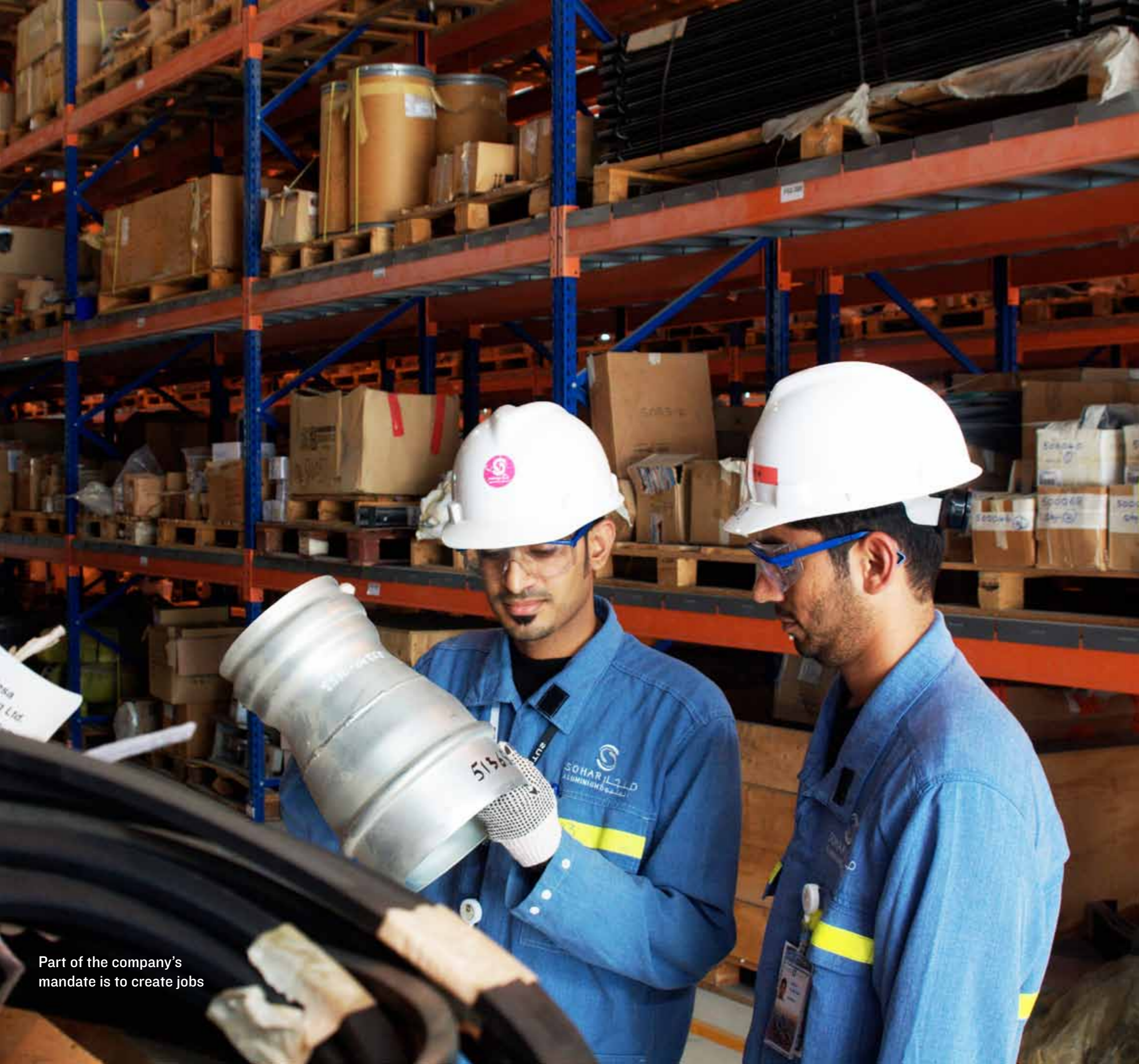
Part of the company's mandate is to create jobs

One such business, a $388 million aluminium rolling mill is currently under