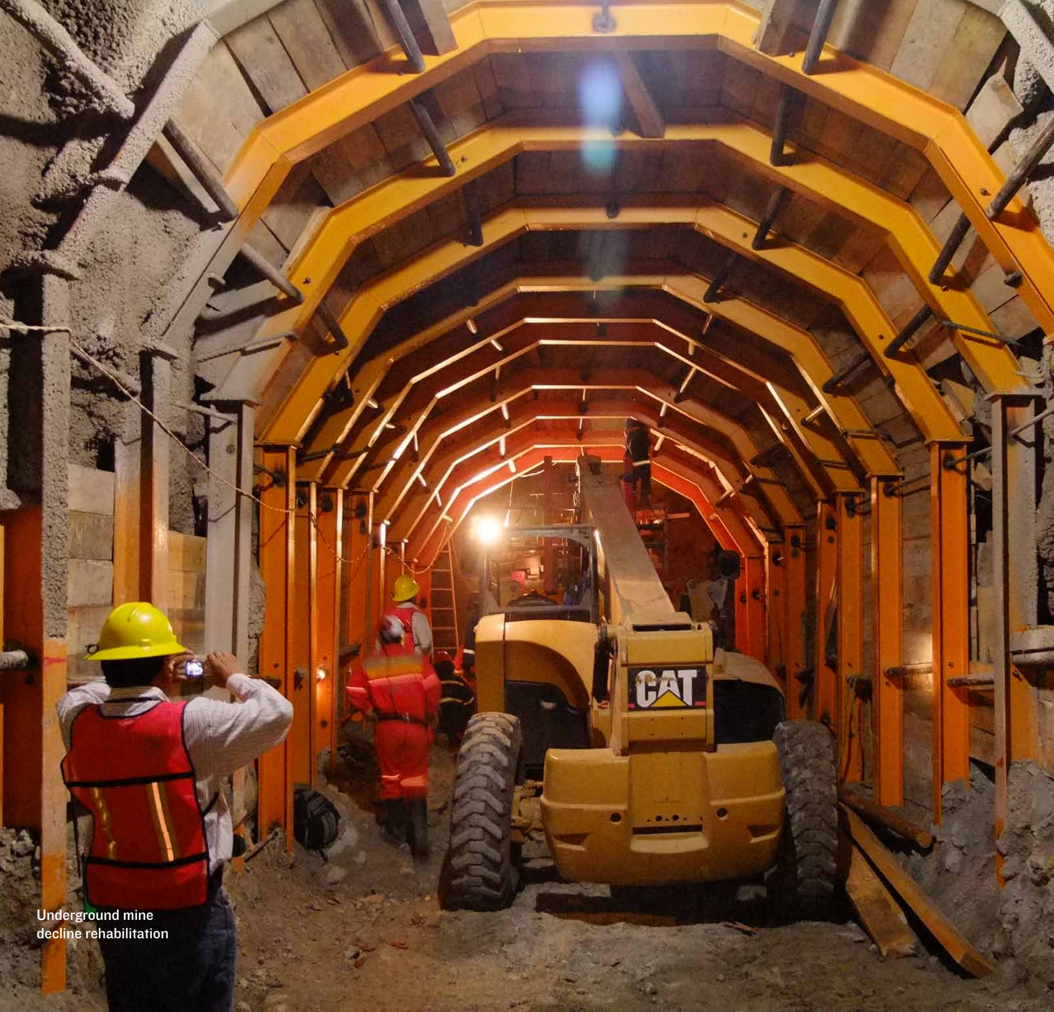
Underground mine decline rehabilitation