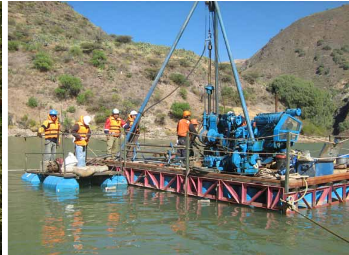
Underwater geotechnical drilling