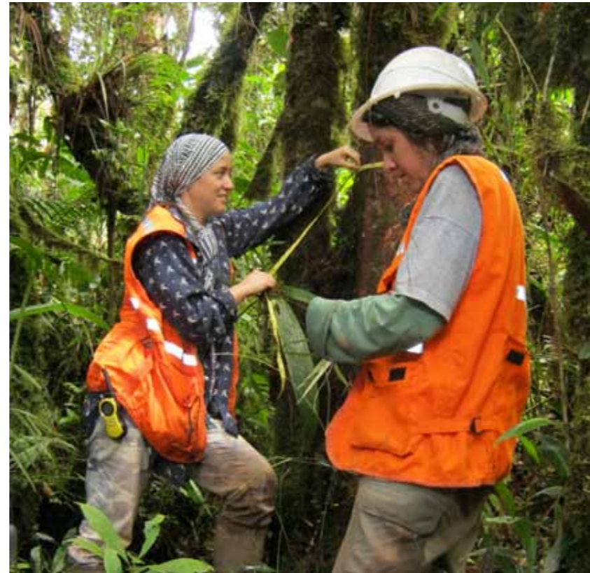
Biological field work