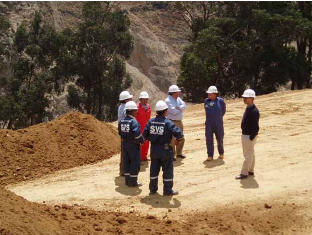
Mine tailings facility reclamation