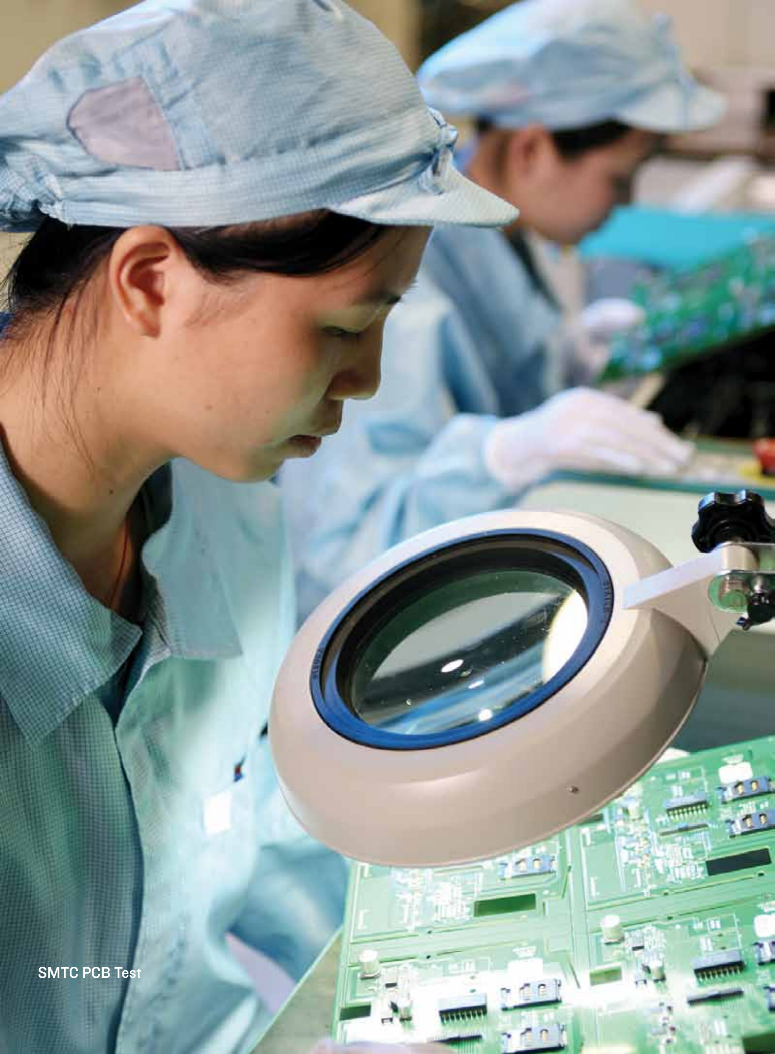
SMTC PCB Test

Today a global Tier II Electronics Manufacturing Services (EMS) provider, delivering integrated contract manufacturing services to original equipment manufacturers within the industrial, computing and communication market segments, SMTC has come a long way in its 25-plus year history.