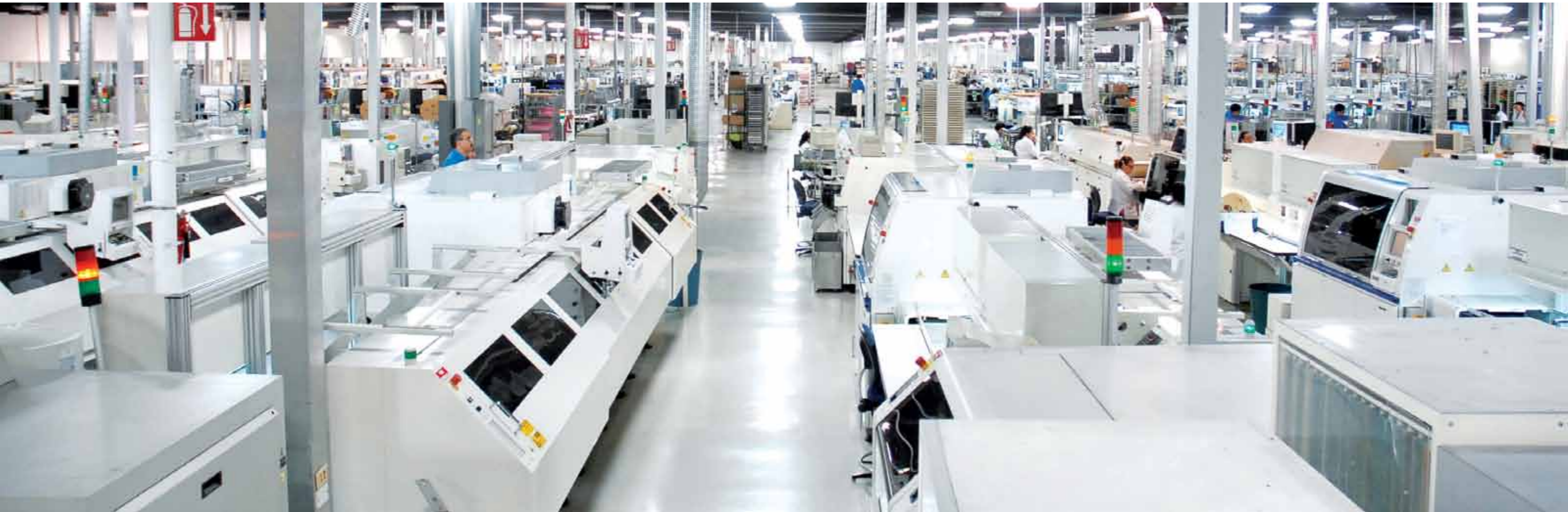
SMTC manufacturing plant

“I SEE SMTC CONTINUING TO EVOLVE THE WAYS IN WHICH WE DELIVER SERVICES TO OUR CUSTOMERS, AND INVESTING FURTHER IN BOTH IT SYSTEMS AND EMPLOYEE SKILLS”