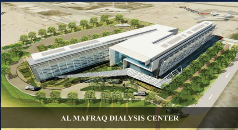
AL MAFRAQ DIALYSIS CENTER

"We are passionate about the opportunity to work as partners with SEHA to help them realize their vision and mission to deliver world class healthcare facilities to the Emirate of Abu Dhabi. Healthcare facilities are more than just buildings. Healthcare facilities are critical elements of community infrastructure which stand to promote the health and wellbeing of all residents and visitors." ASC Team