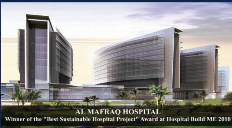
AL MAFRAQ HOSPITAL Winner of the "Best Sustainable Hospital Project" Award at Hospital Build ME 2010