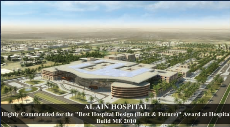
AL AIN HOSPITAL Highly Commended for the "Best Hospital Design (Built & Future)" Award at Hospital Build ME 2010