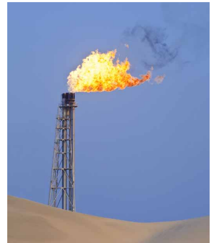
The Iraqi oil industry has not been able to meet oil and gas production and export targets