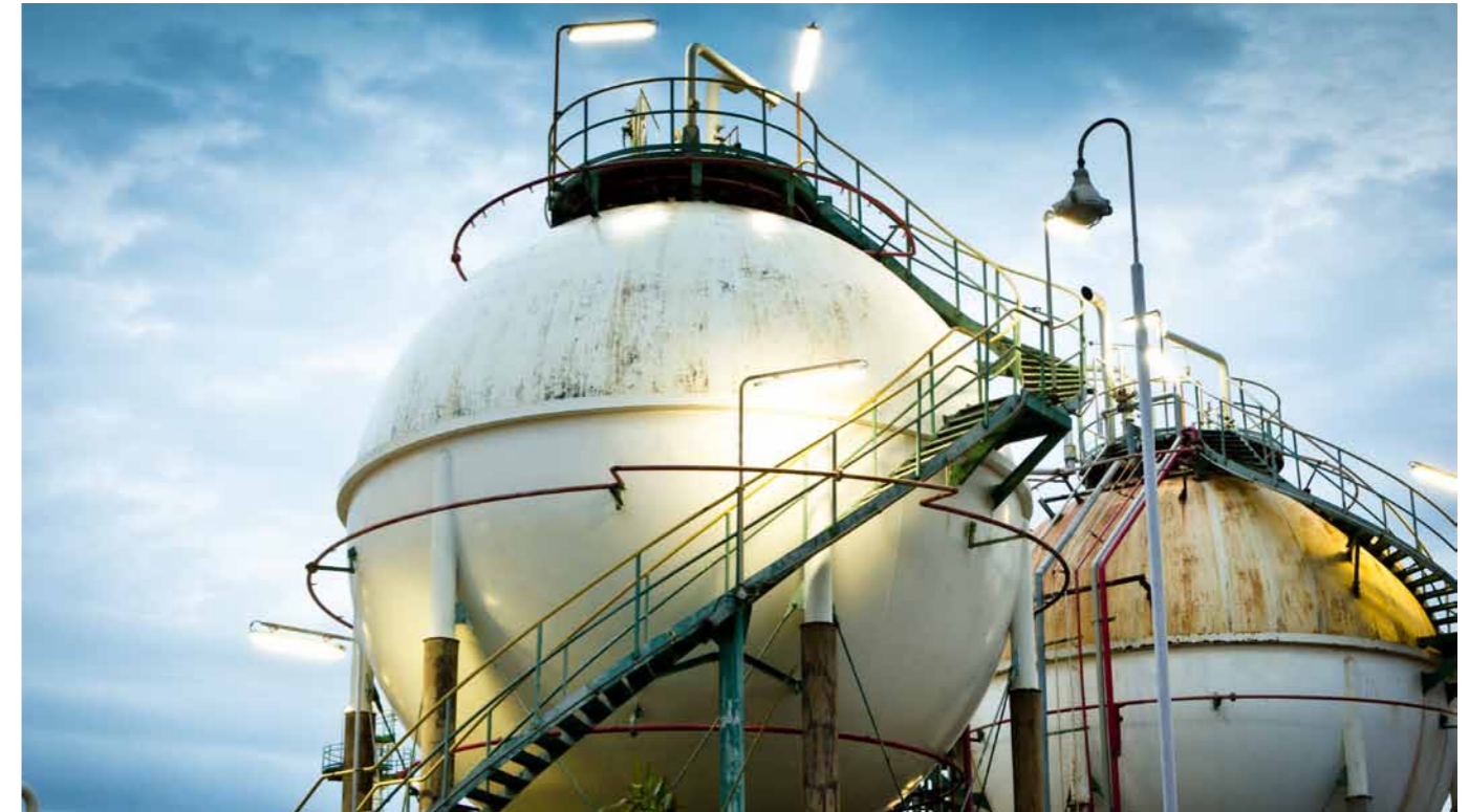
Iraq plans to build four refineries across the country to meet increasing domestic demand

outright and retains the operating revenue risk and all of the surplus operating revenue in perpetuity – this is an increasingly popular way for governments to fast track major infrastructure projects since it shifts the risk to the contractor, in exchange for very considerable upside potential.