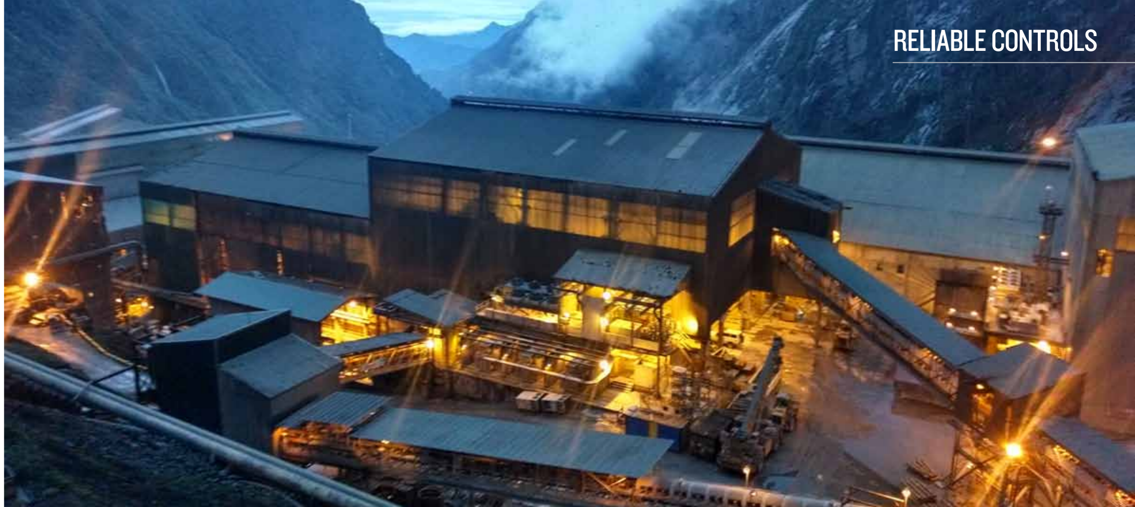
Copper and gold underground mining in Indonesia

a complete Instrumentation and Controls audit and assessment in 2001 at Minera Escondida’s concentrator. The next few years brought nothing but opportunity and growth for the flourishing company. In 2002, RCC performed the commissioning and start-up of the Power Distribution Systems and Controls Systems for BHP Billiton at Minera Escondida’s Phase IV megaproject.