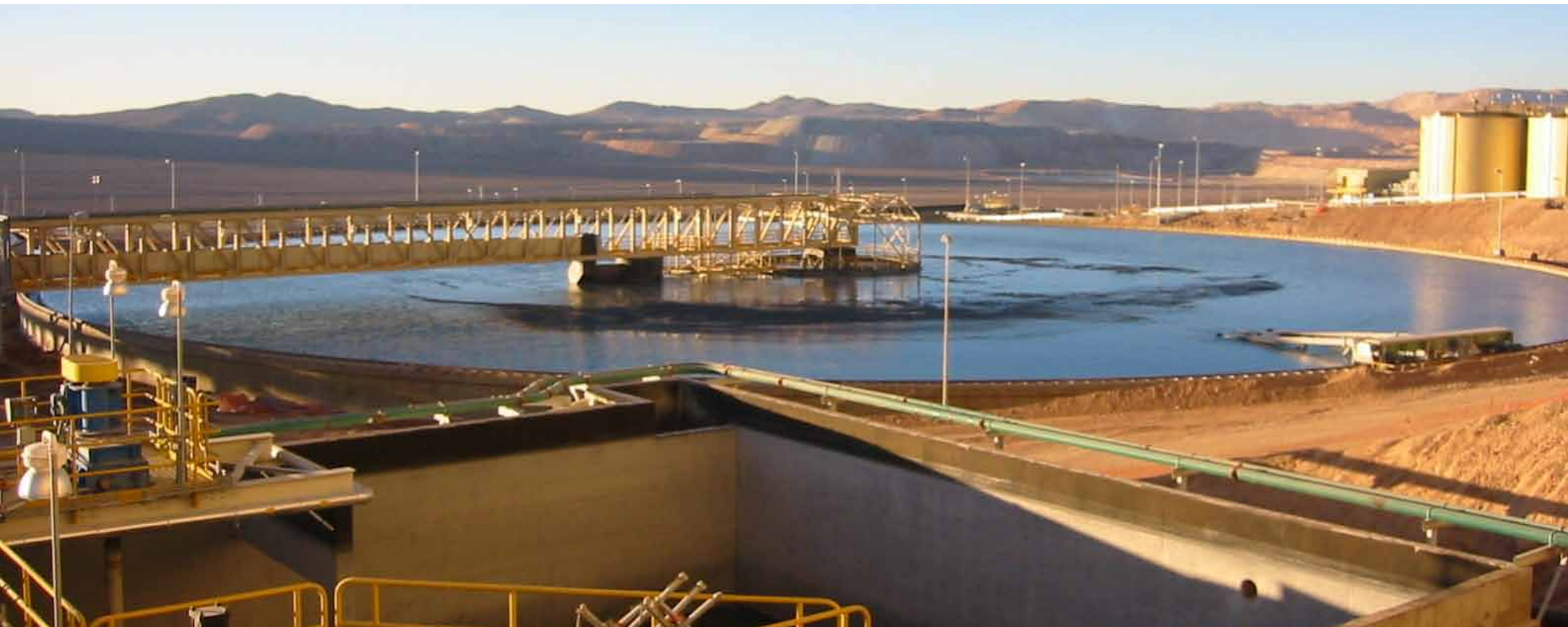
Copper thickener in the Atacama Desert, Chile