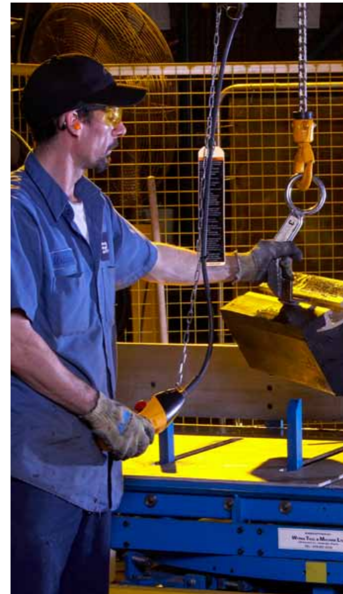
Mining finishing saw

systems to protect the mill shell and to enhance the movement of the ore slurry for optimum throughput and grinding performance. Mill liner replacement is a critical part of the entire mining operation. If the mill stops, the whole process stops. It is critical that the mill liners achieve the required service