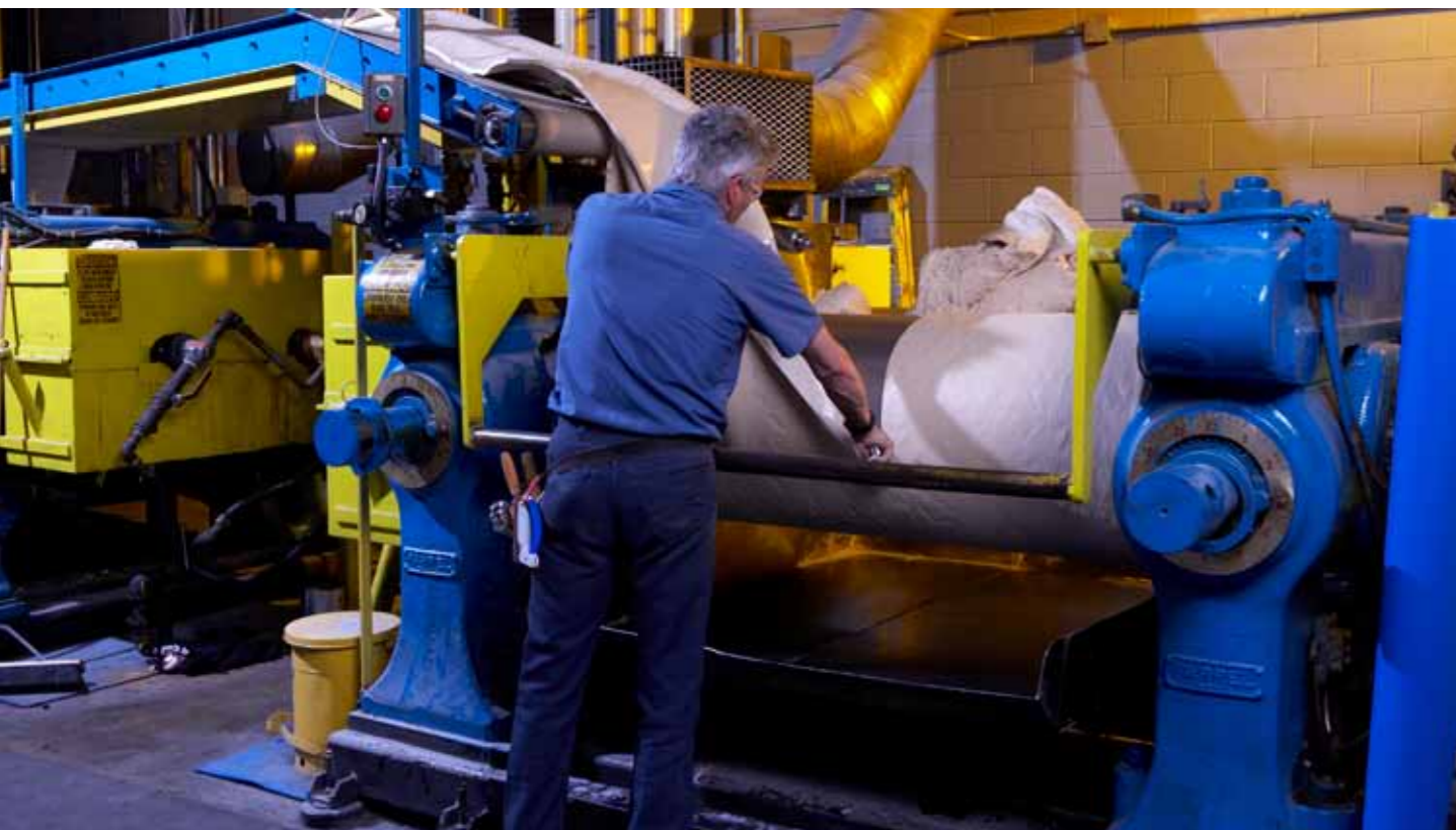
Protective linings warming mill

“OUR APPROACH TO MINING HAS BECOME MORE DESIGN INTENSIVE AS OPPOSED TO A MATERIALS APPROACH. THE RIGHT FORMULA IS ONE ESSENTIAL INGREDIENT”