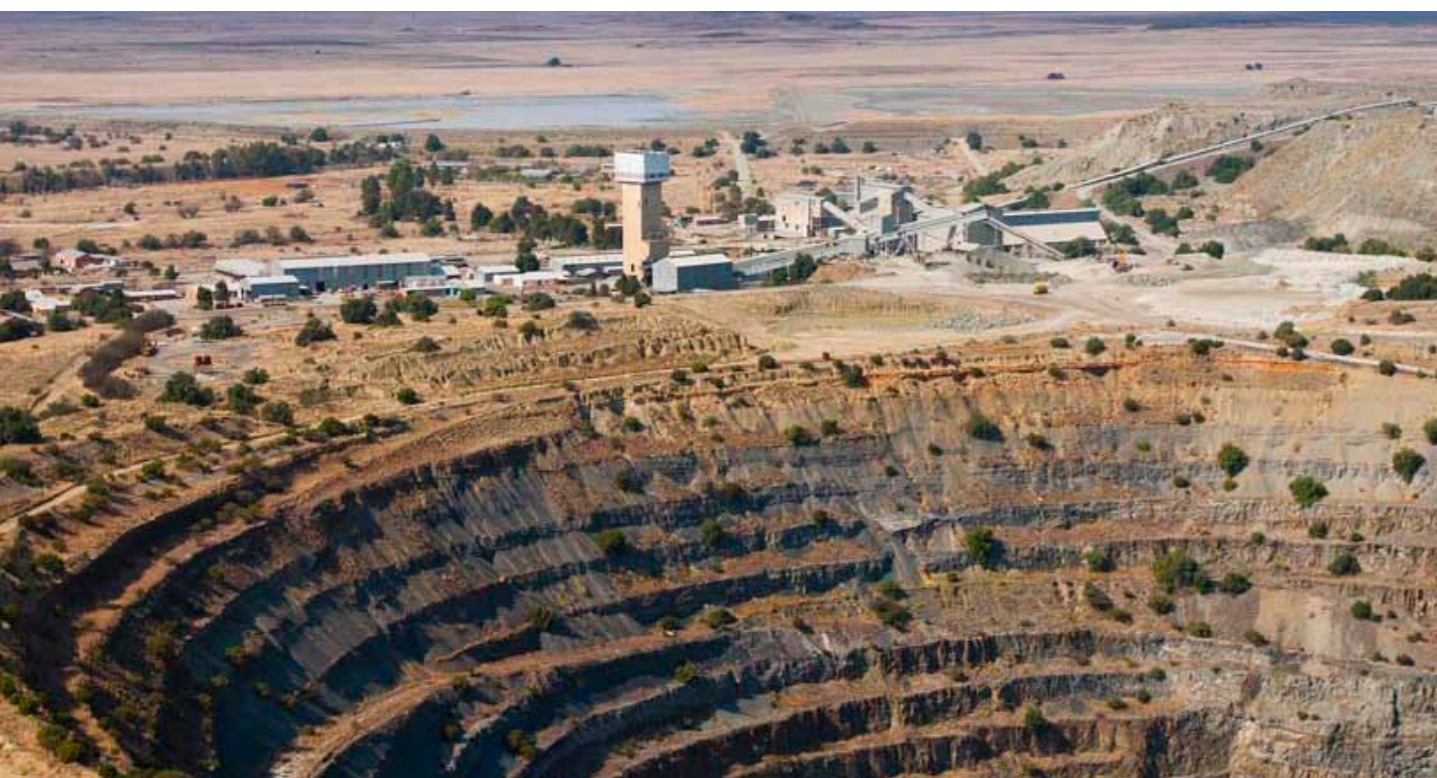
The Koffiefontein mine in South Africa

“PETRA HAS TRIED TO FOSTER A CULTURE IN WHICH INNOVATION AND CREATIVITY IN THE WORKPLACE IS ENCOURAGED AND REWARDED”