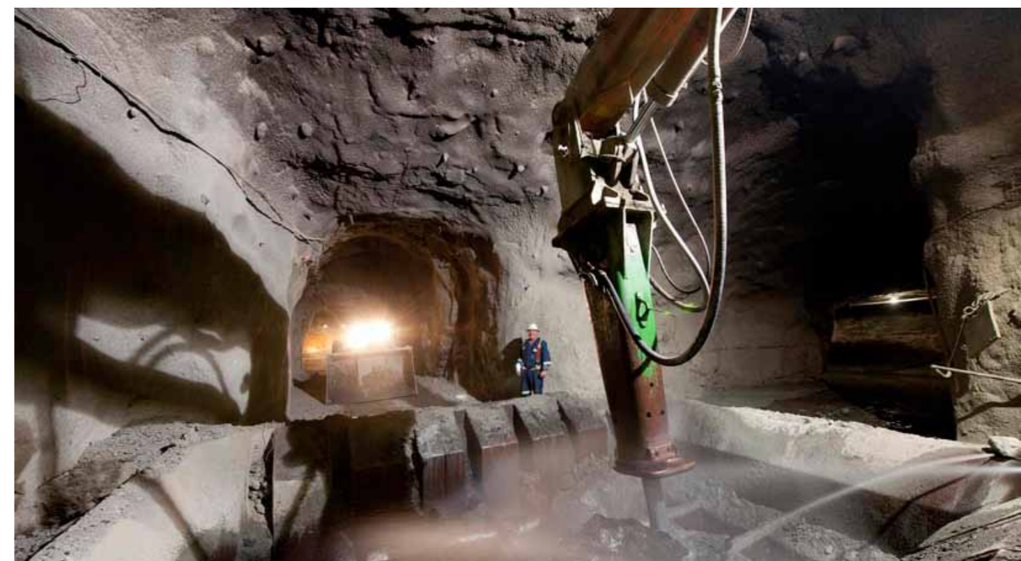
Rockbreaker breaking ore on top of a grizzly underground at Cullinan

ensure that these same men and women are empowered and accountable for their own actions, something it believes encourages them to work to the very best of their abilities at all times. Furthermore, Petra has tried to foster a culture in which innovation and creativity in the workplace is encouraged and rewarded. The company believes that no-one knows its operations better than its own employees and accordingly it looks to leverage its internal skills-base wherever possible.