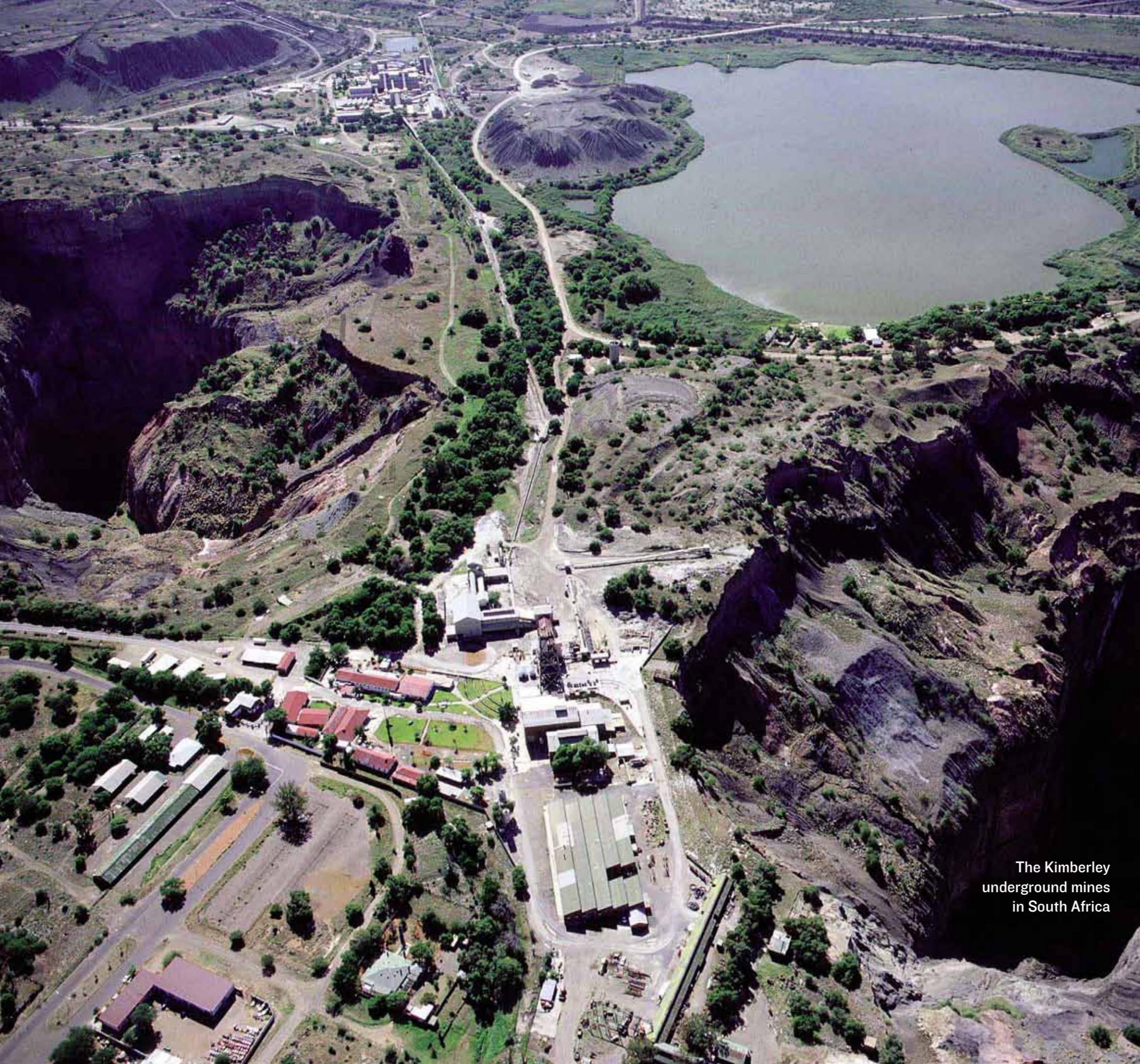
The Kimberley underground mines in South Africa

First listed on the AIM in 1997, with a market capitalisation of £10 million, Petra Diamonds has since grown into a leading independent diamond mining group and an important supplier of rough diamonds to the international market.