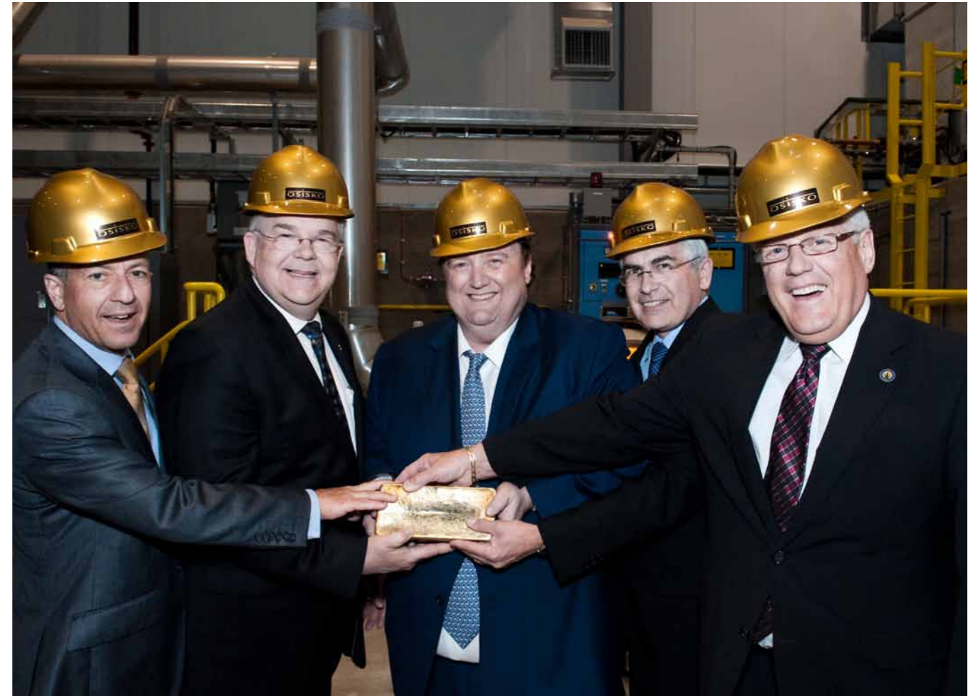
Official inauguration of the Canadian Malartic gold mine

Our customers' satisfaction, service quality and agent professionalism will warrant success and image of Security Investigation Optimum Inc.