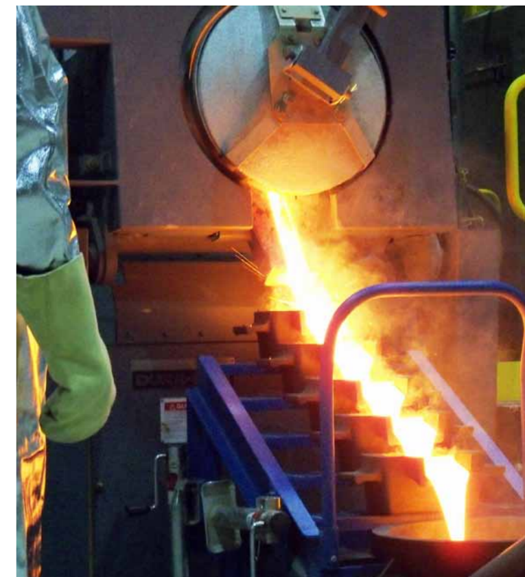
First gold was poured on 13 April 2011

To give due credit, Osisko built in a sustainable development program right from the start. With part of the gold resource being literally under the town of