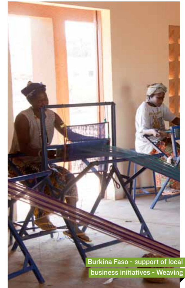
Burkina Faso - support of local business initiatives - Weaving

Lycopodium has a significant success record in the development and commissioning of projects, often pioneering the introduction of modern process plants and associated technologies to remote and logistically challenging locations. The company has an international reputation for delivering projects which consistently meet or exceed all project criteria and performance targets. Lycopodium's experience in Burkina Faso and the West African region comprises over 30 projects, including the Bissa Gold Project for Nordgold. This provides Lycopodium with the advantage of recent and relevant project development experience in West Africa, including knowledge of logistics, contractors, and community. The company has been active in the mineral processing industry for