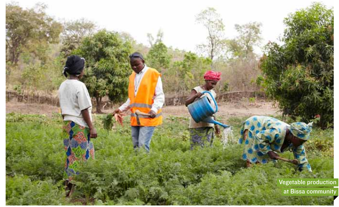
Vegetable production at Bissa community