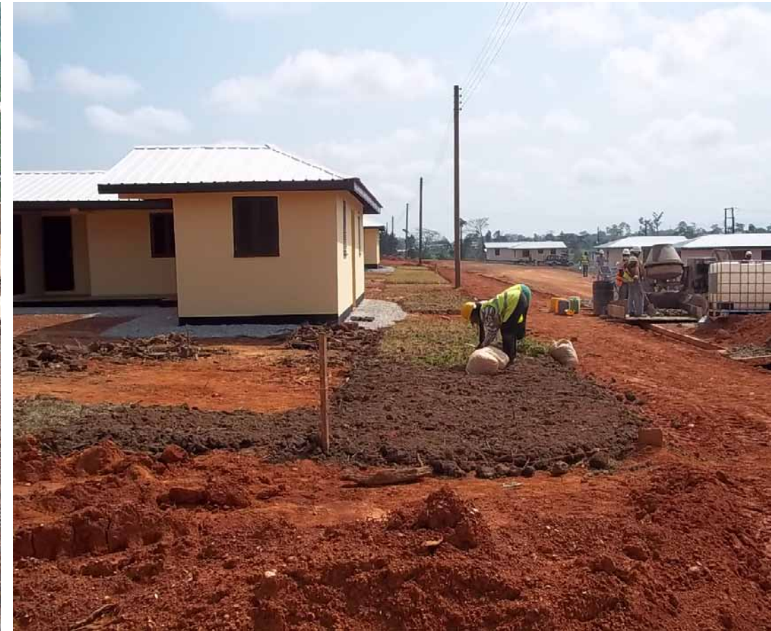
Grass planting by Nyame Adom Twum