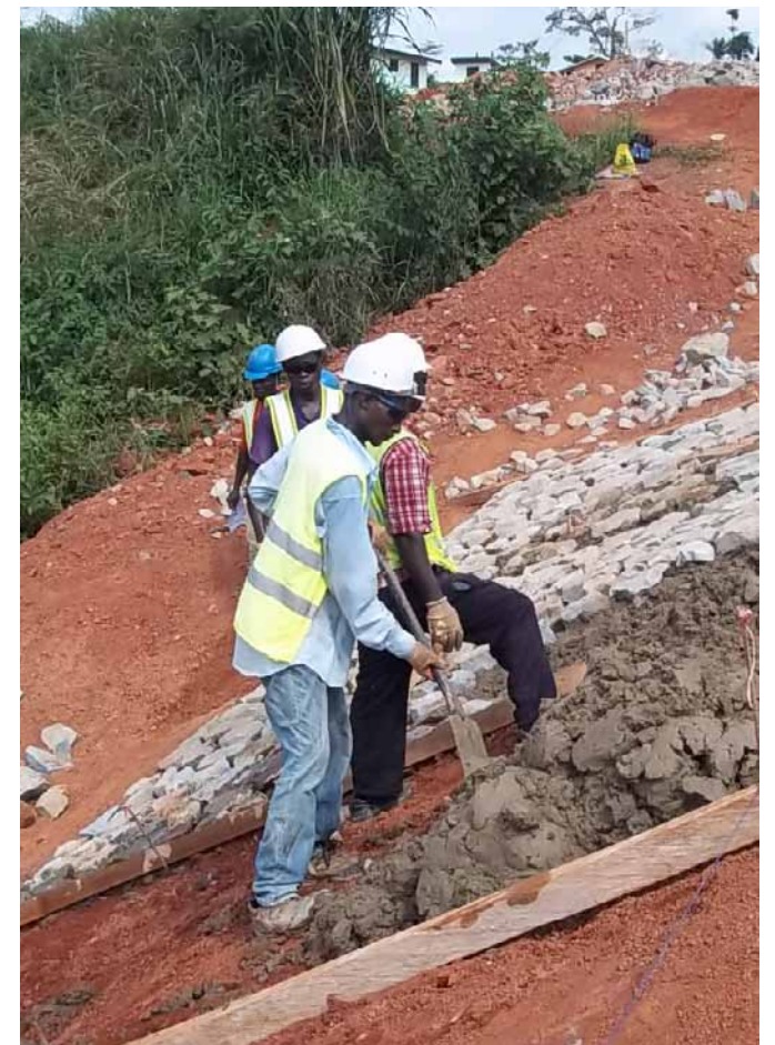
Stone pitching works