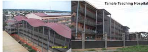
Tamale Teaching Hospital

CONSAR LIMITED, a Building and Civil Construction Company in Ghana was founded in 1983 and commenced business in 1984. For 28 years of Civil and Engineering works, we believe that growth is aided by quality work and therefore we are determined to leave no stone unturned in our quest not only to deliver quality work, but also work within budget, and on time. Currently, we have been awarded major contracts in Ghana which are ongoing.