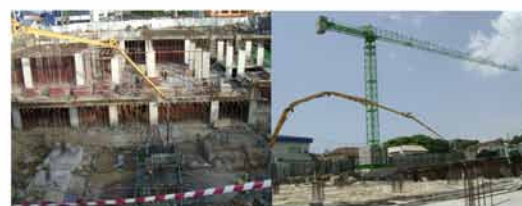
GLAHCO Shopping Mall at Osu

them the opportunity to grow. Meanwhile, a similar mission being undertaken at Ahafo involves a drive to create more private-public sector partnerships and increase the level of dialogue between the two sectors.