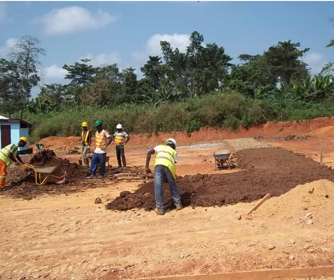
Top soil spreading by Gyifoss