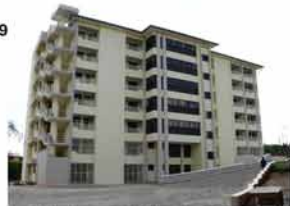
Christian Service University College

Tamale – Tel.: (+233) 037 2023732 Fax: (+233) 037 2023732 Accra – Tel.: (+233) 030 2813453 Fax: (+233) 030 2813454