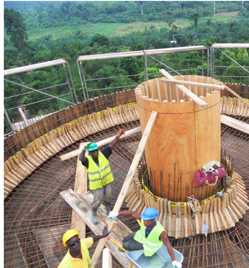
Newmont is committed to local sourcing