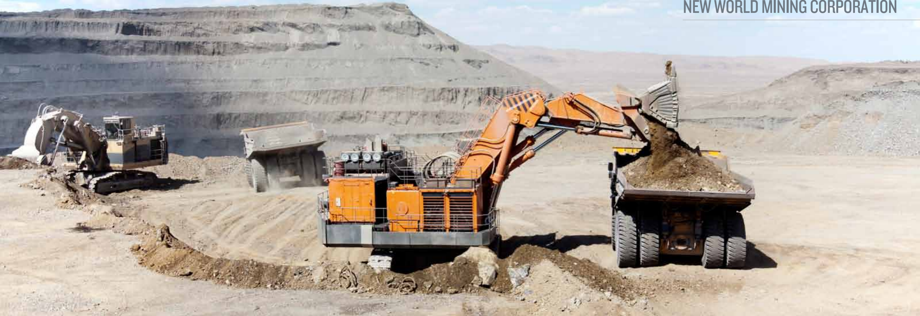
Loading the iron ore into heavy dump truck at the open cast mine

related to mineral extraction, mining operations, processing and commercialisation.