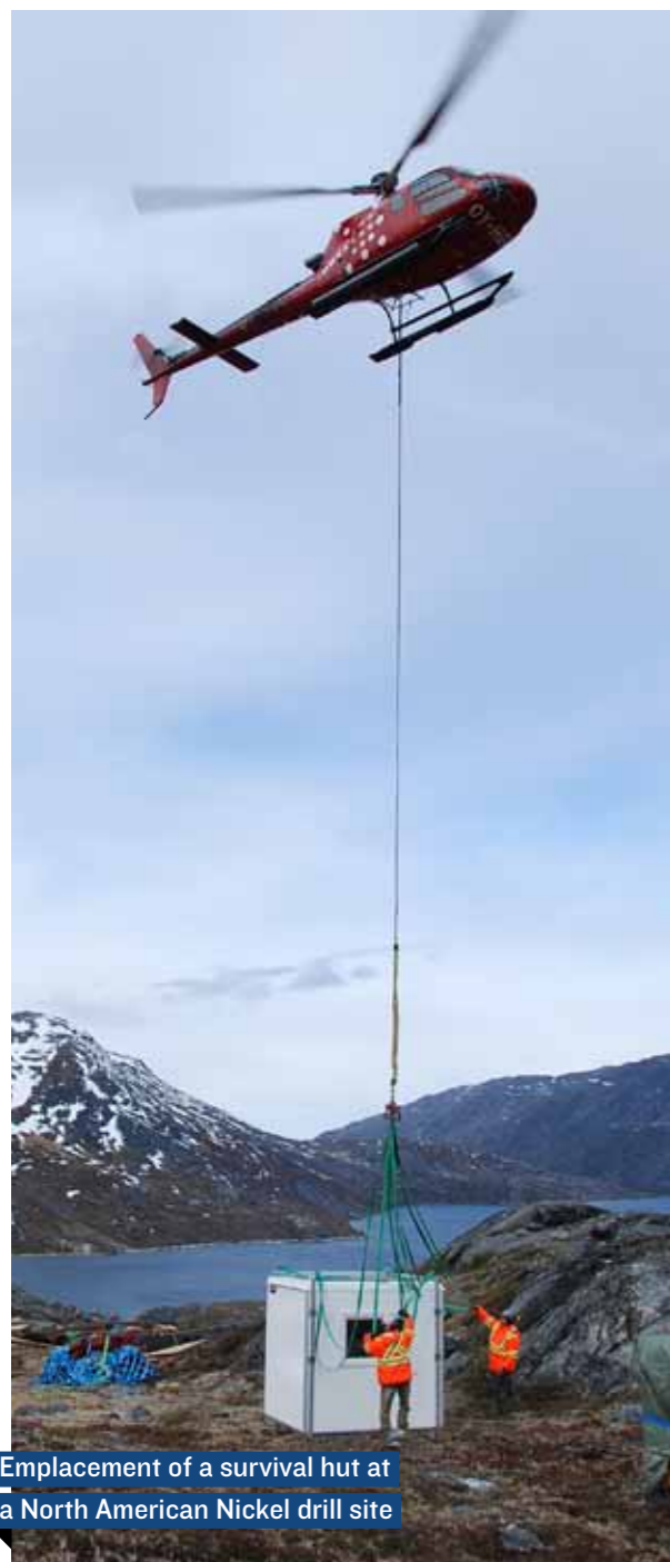
Emplacement of a survival hut at a North American Nickel drill site

techniques like VTEM (versatile time-domain electromagnetic system) used for identifying electromagnetic conductors such as semi-massive to massive sulphide mineralisation. NAN has flown more than 5,700 kilometres of survey, and in these conditions Fedikow says you can maintain a constant height over the rugged terrain with the helicopter-borne geophysical survey, looking a couple of hundred metres into bedrock.