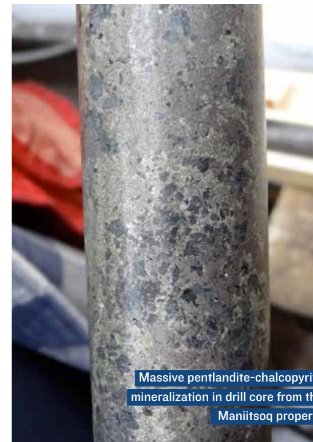
Massive pentlandite-chalcopyrite mineralization in drill core from the Maniitsoq property

Regardless of the manner in which NAN moves forward its intention is to build a