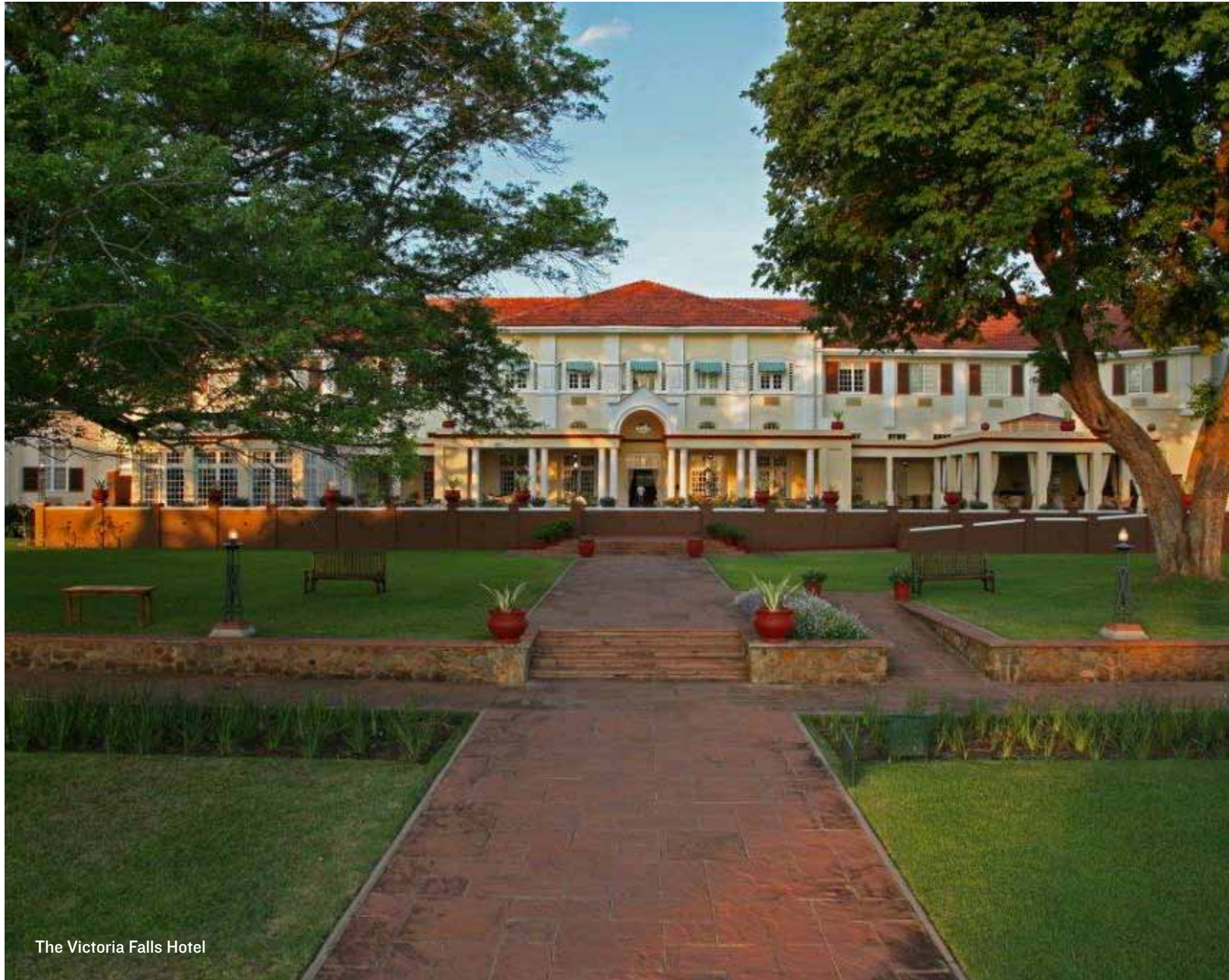
The Victoria Falls Hotel

Meikles is a household name in Zimbabwe: 17 Meikles-branded department stores and a luxury five-star Harare hotel form the face of a company that has extensive experience in retail, hospitality and agriculture dating back to 1892.