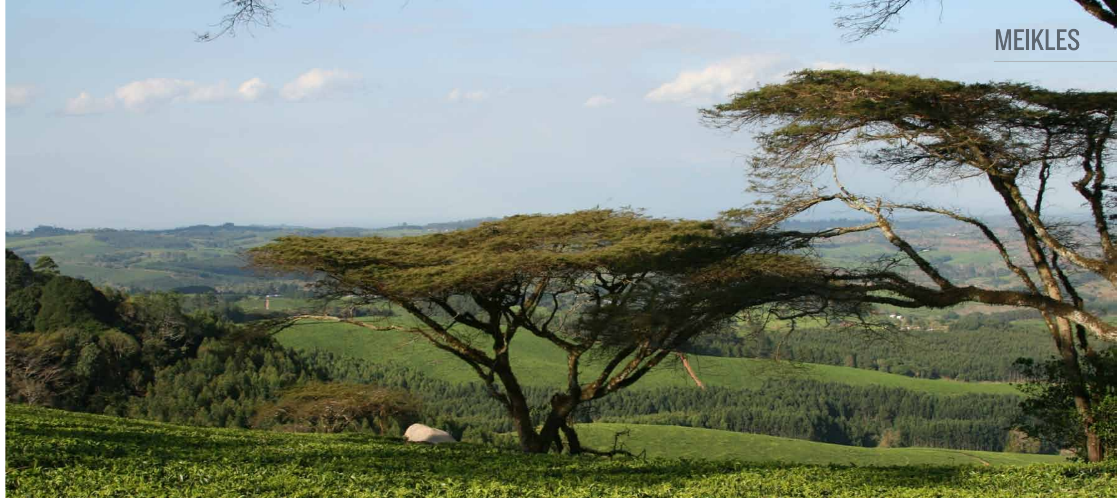
Zimbabwe’s economic situation is improving

“WE’VE DONE A LOT OF WORK ON PRICING AND WE’RE CERTAINLY COMPETITIVE IN THE MARKET”