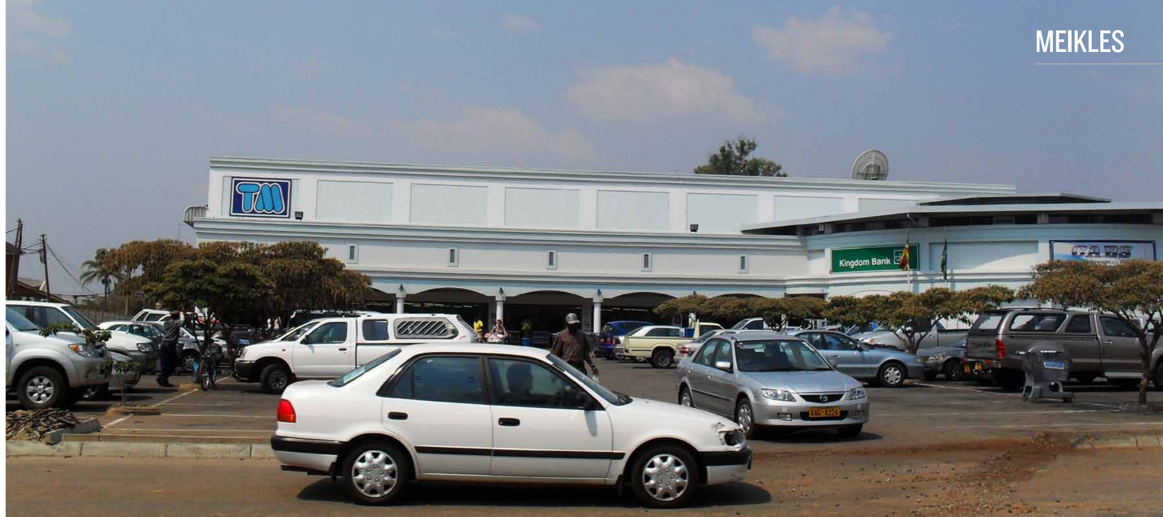
Meikles' flagship supermarket in Borrowdale suburb, Harare

we now have plans for all four divisions of the company. For example, we see massive potential for growth in the supermarket side of the business.”