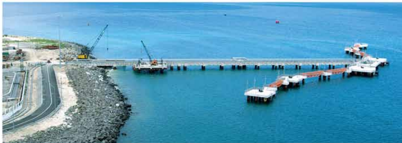
Construction of Oil Jetty at Port Louis, Mauritius.