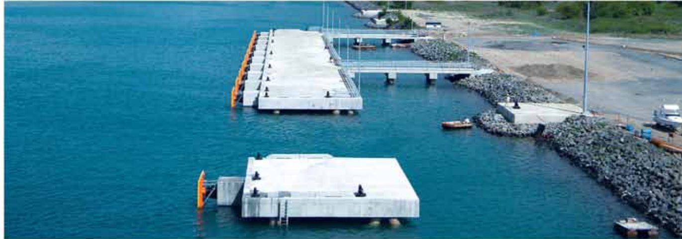
Cruise Berth Facility at Port Louis Harbour