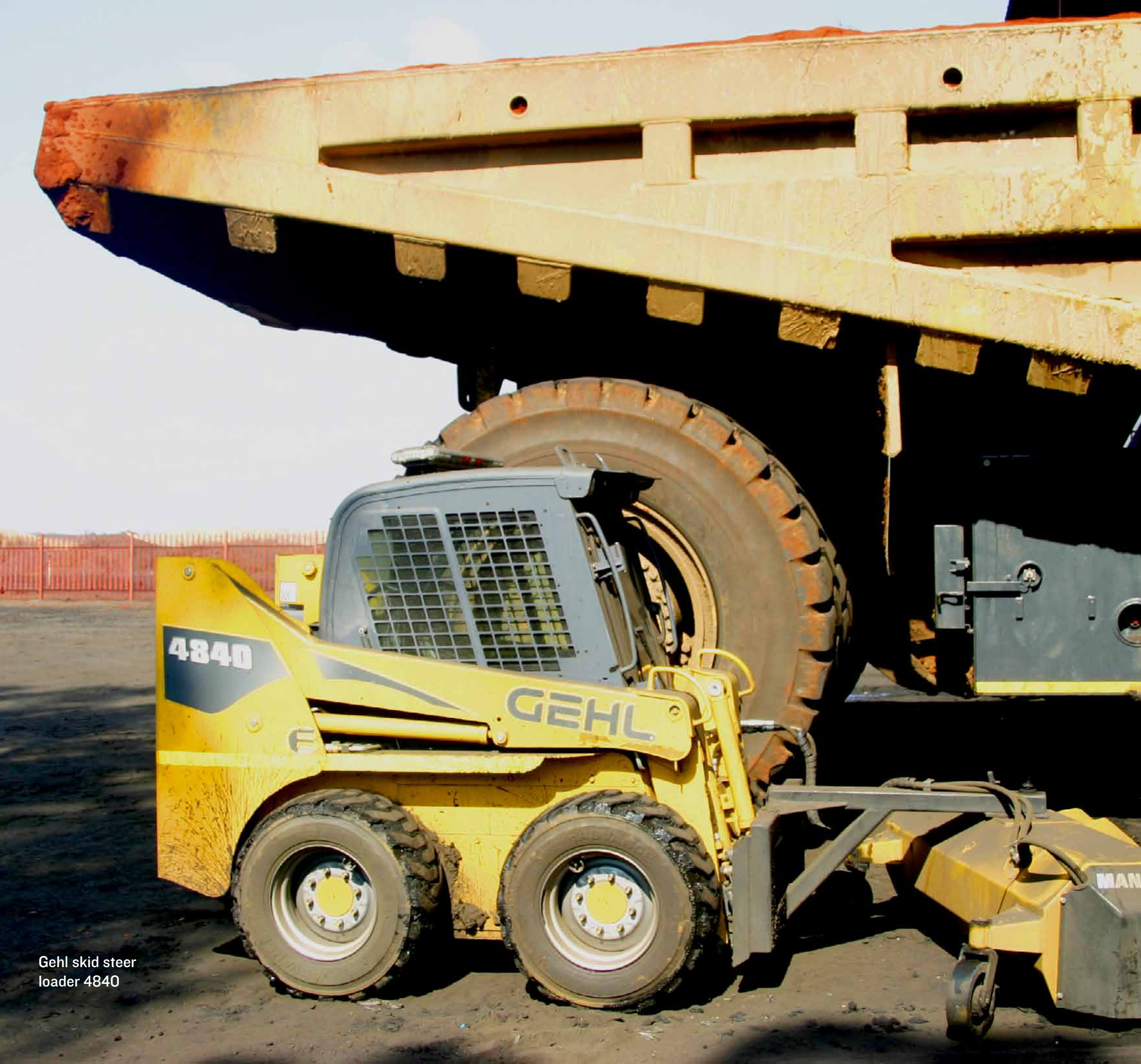
Gehl skid steer loader 4840

This standard product range, however, is merely the platform from which the Southern African operation is building a highly customised range of machines and attachments specifically for the mining