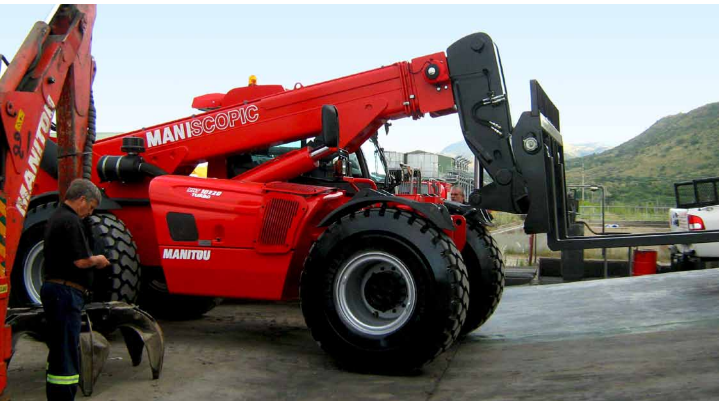
Service being carried out