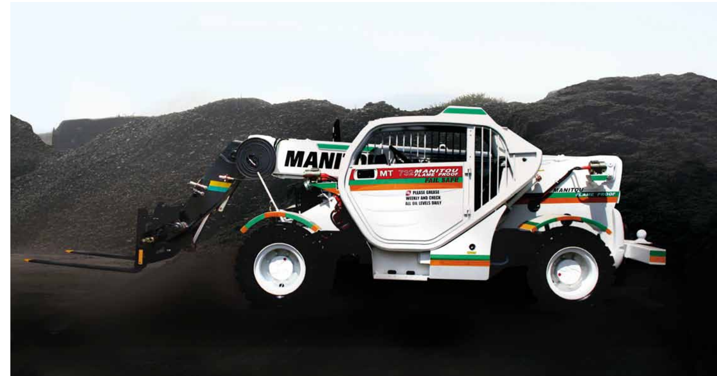
Manitou soft rock flameproof utility vehicle

"WITHIN A COUPLE OF MONTHS WE WILL BE TAKING OVER DEALERSHIPS IN ETHIOPIA, ERITREA, SOMALIA AND KENYA"