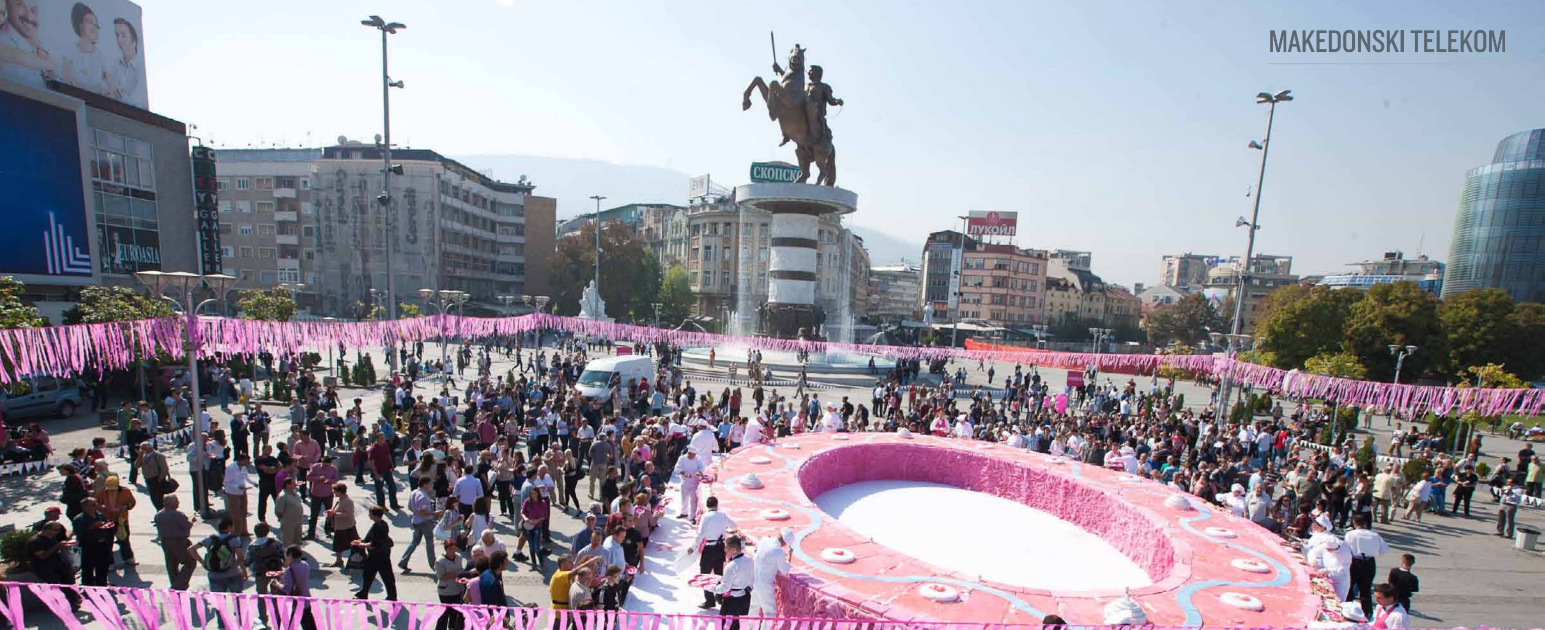
Local tariff & product campaign, making the biggest cake for the sweetest promo offer

Best Employer for 2011, in the category of companies with over 500 employees.