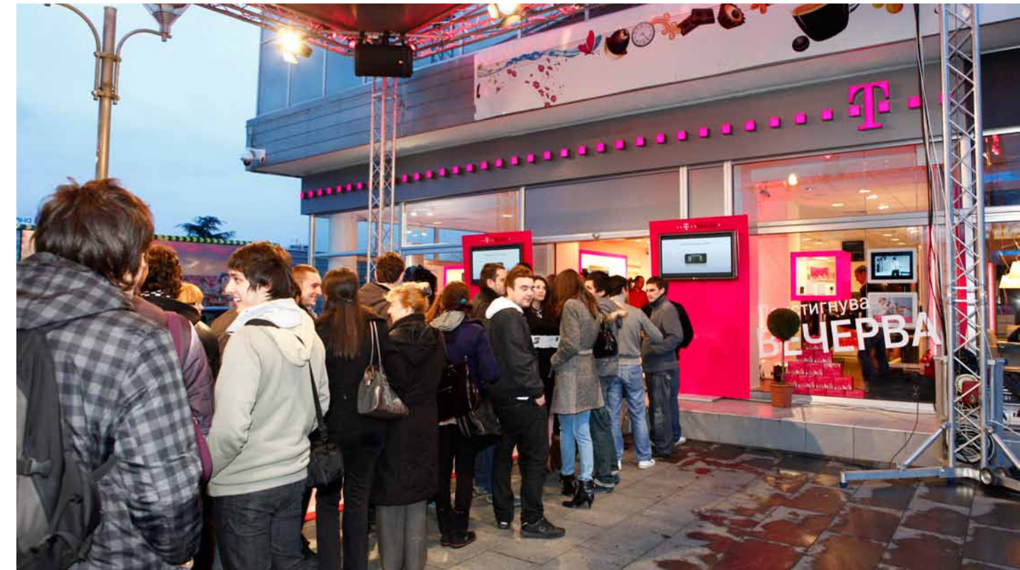
Customers waiting for the new iPhone

“THE COMPANY HAS BEEN ABLE TO RETAIN A LOCAL EMPHASIS, WHILE STILL ENJOYING THE BACKING AND SUPPORT OF A GLOBAL TELECOMS POWERHOUSE”