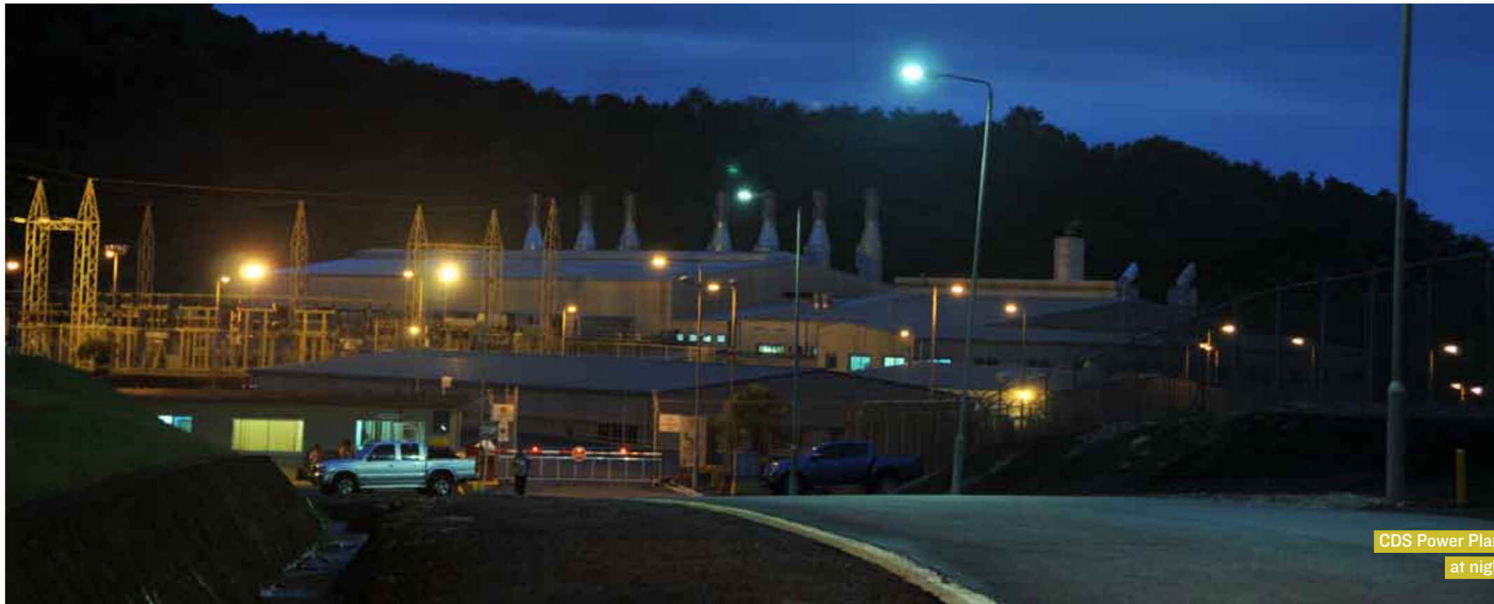
CDS Power Plant at night