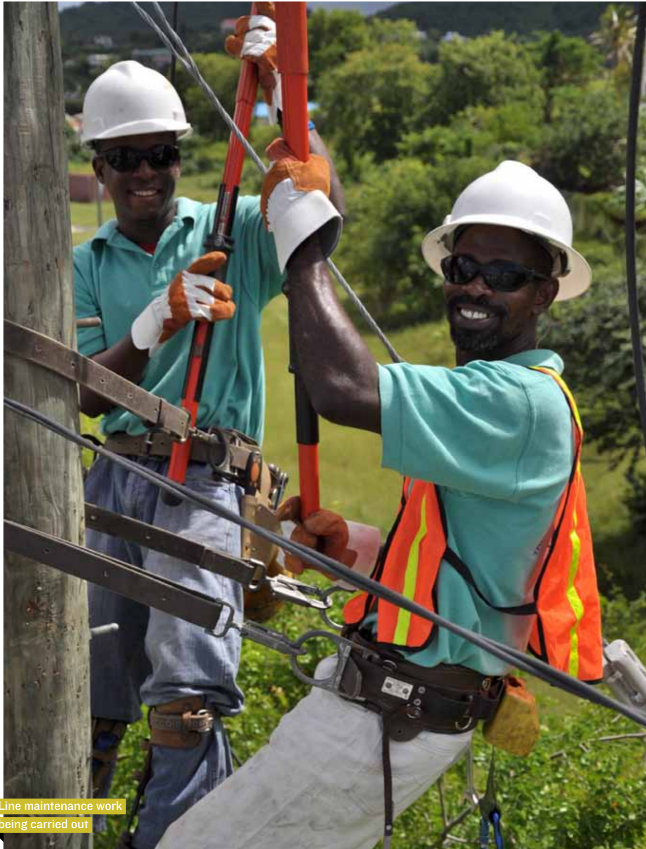
Line maintenance work being carried out

F rom the outset LUCELEC's mission has been to provide an excellent service to its customers by adequately supplying a reliable and continuous electrical supply to the Saint Lucian population, at an affordable cost. Though it serves a small country of fewer than 175,000 souls, LUCELEC's approach has earned it a reputation across the Caribbean as a very well-run, world-class utility regarded as a best practice benchmark company with a strong emphasis on customer service, innovation, employee development and social and economic development. The company went public in 1994, and its shares are traded on the Eastern Caribbean Securities Exchange.