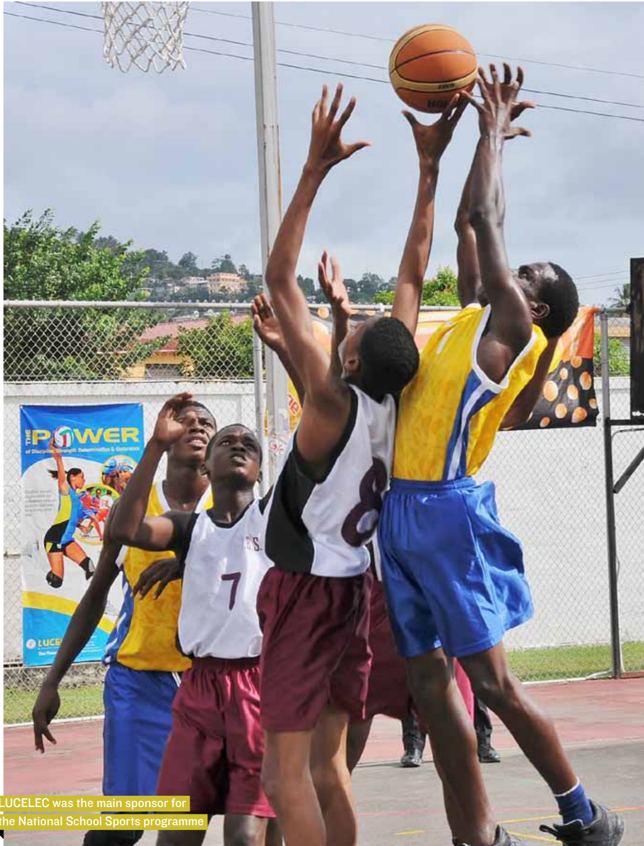
LUCELEC was the main sponsor for the National School Sports programme

“We aim to integrate, implement and promote socially responsible behaviour throughout the organisation and across our sphere of influence”