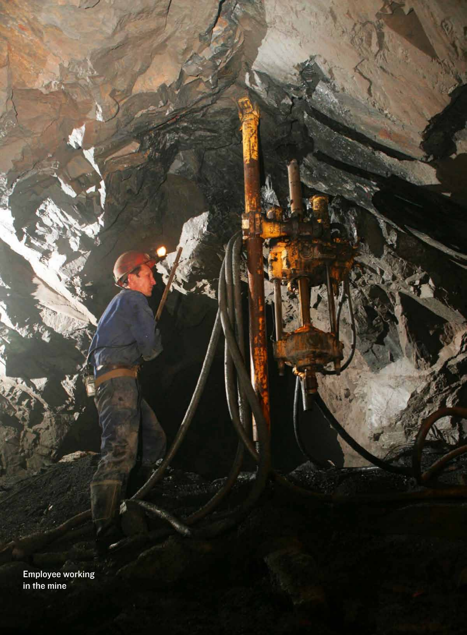
Employee working in the mine

In recent years, Kazakhstan has been recognised as having some of the world's largest deposits of natural resources. Its phosphate deposits, discovered around 70 years ago in the Karatau basin to the south of the country, have been mined since 1946 and are among the biggest in the world. In 1999 Kazphosphate, which operates all the phosphate mining, processing and manufacturing interests of the region, became a limited liability company, and began looking at ways of modernising and diversifying.