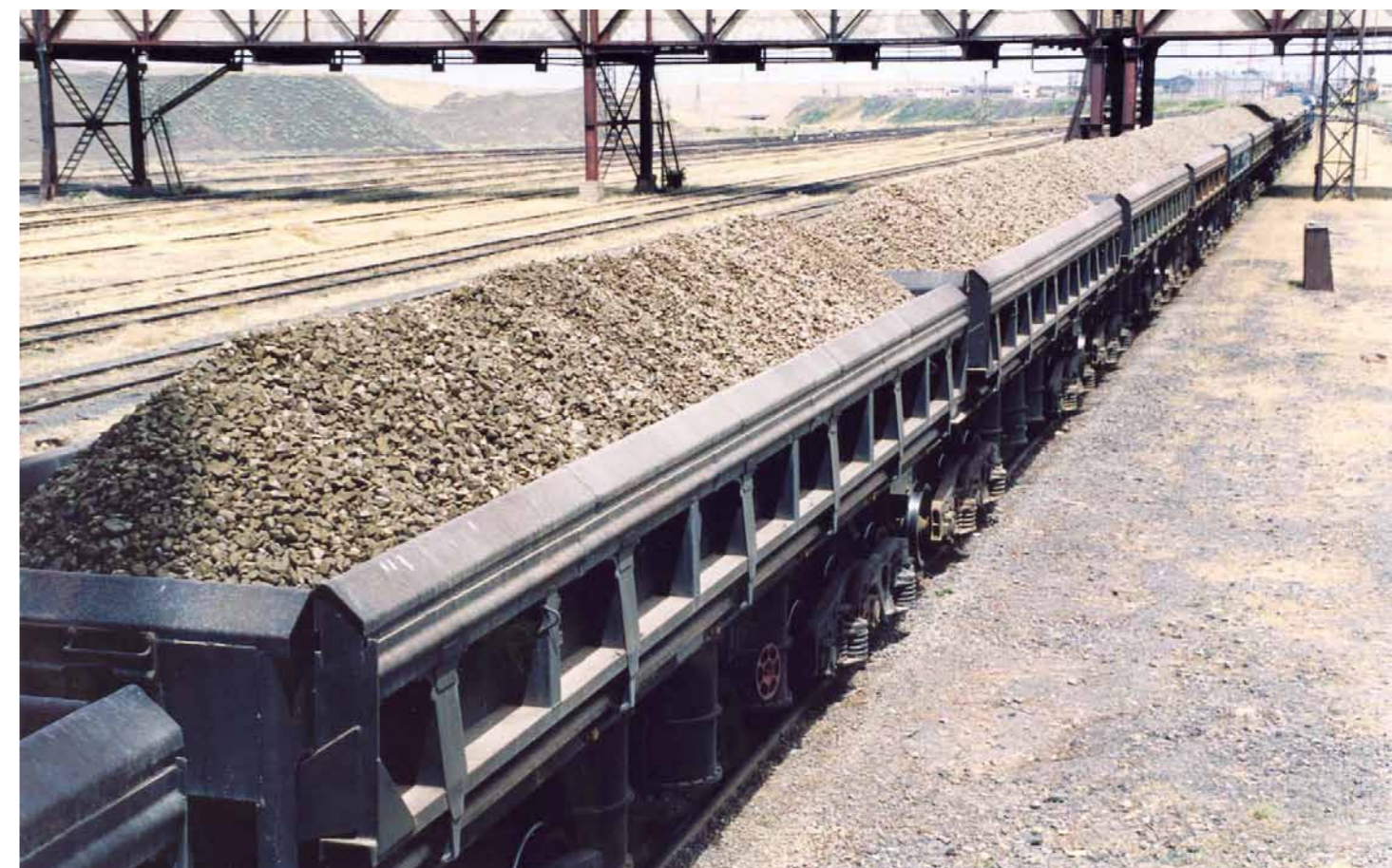
The company exports its product via railway

project and we’re doing the feasibility study on it right now,” Iskandirov says. “But the dust contains significant amounts of potassium, and we plan to use it to produce NPK fertilisers.”