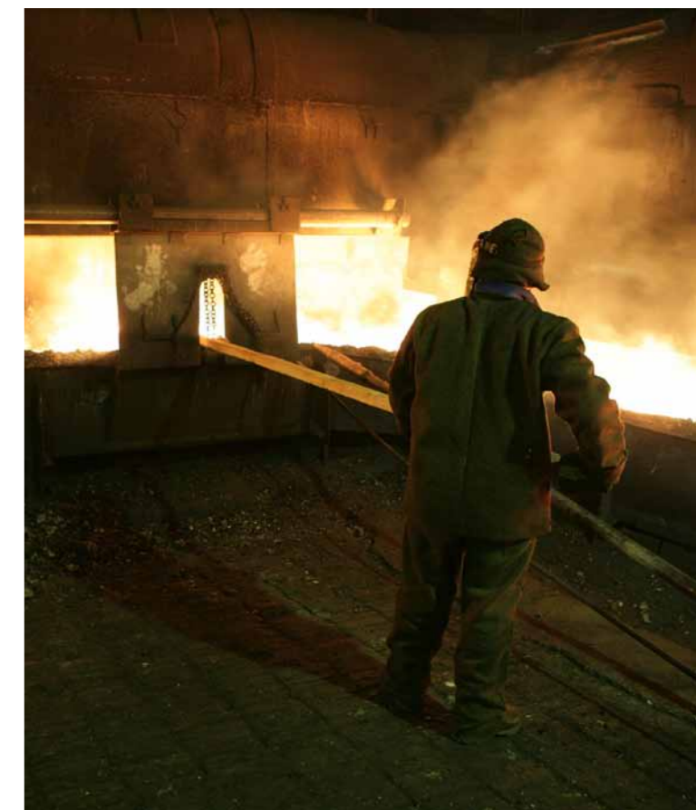
Technician inside the plant

"WE HAVE A TOTAL RESOURCE OF 1.8 BILLION TONS OF PHOSPHATE ORE AT OUR MINES"