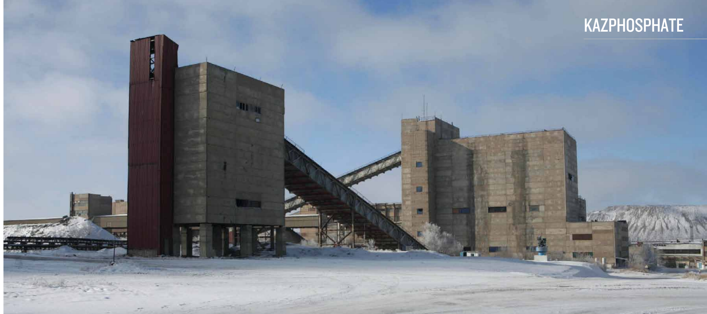
Exterior view of Kazphosphate plant

An upgrade completed at the purified phosphoric acid plant last year has more than doubled the output of acid and