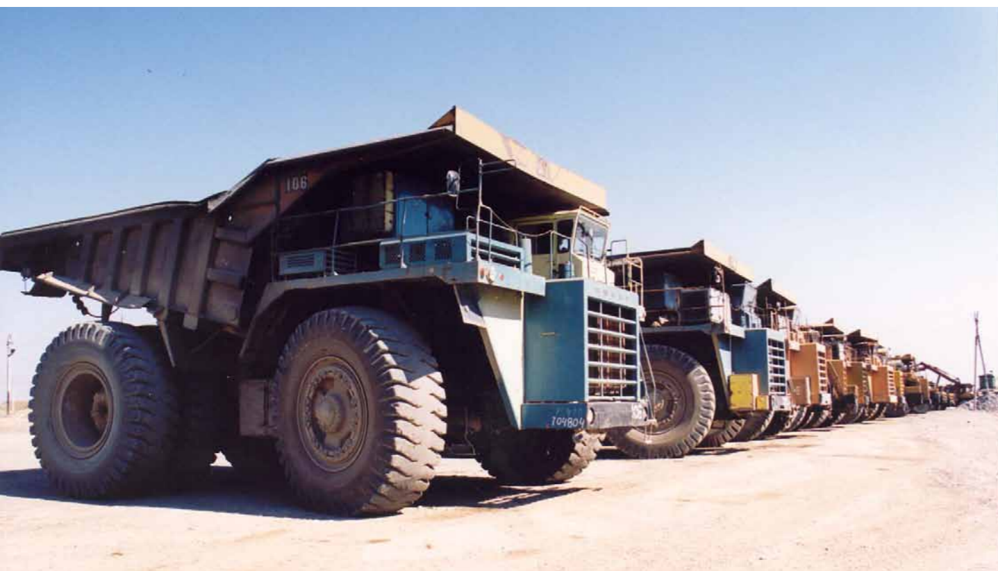
Mining truck fleet

“SO FAR WE HAVE COMPLETED TWO FURNACES, AND WILL BE FINISHING ALL FOUR BY NEXT YEAR”