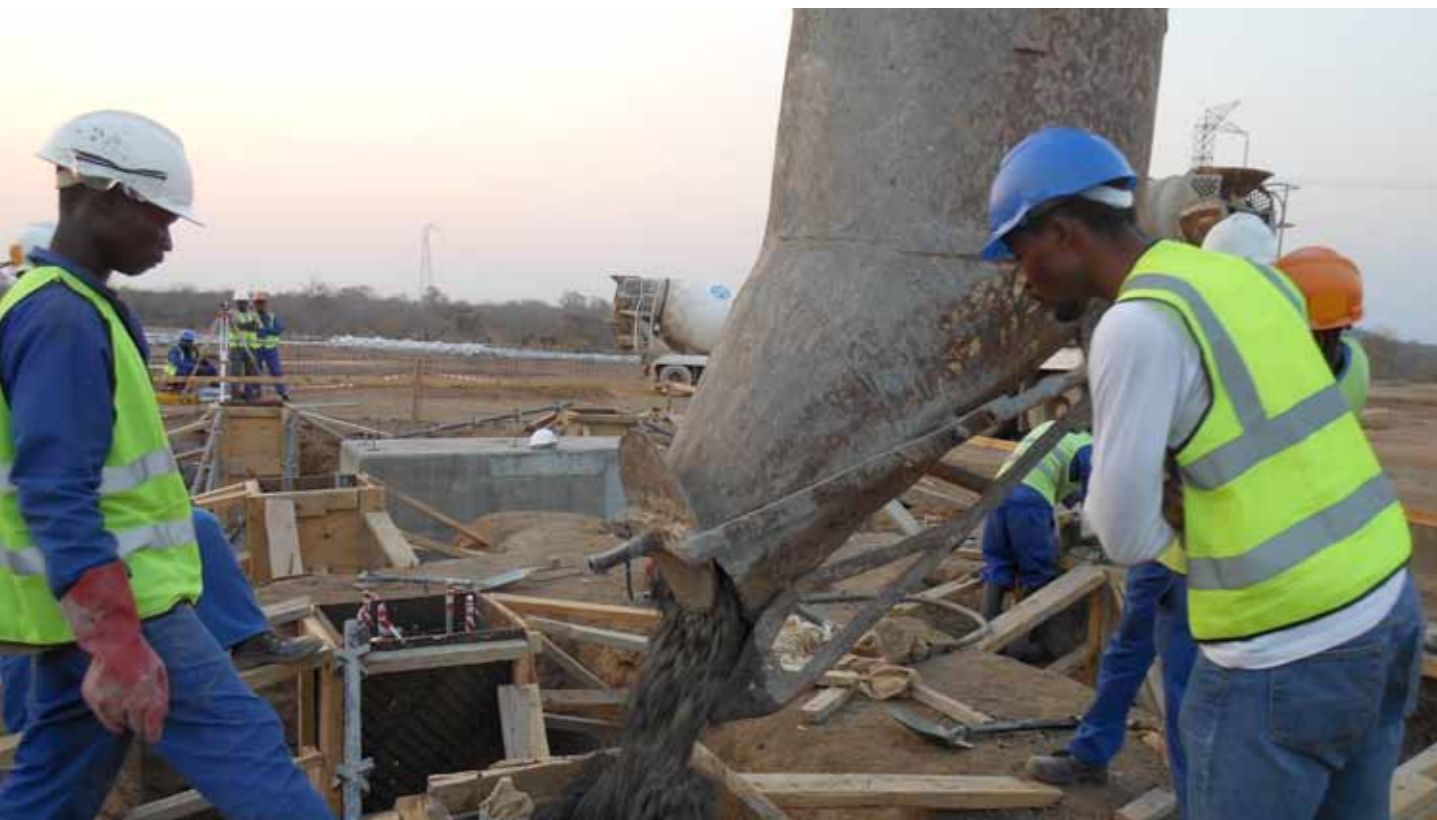
JSPL commissioned a 400 TPH wash plant

the standards of living in the area in the months and years to come. To date we have donated ambulances to the Tete Hospital to help improve response times, built an on-site clinic, which is accessible to all people from the surrounding area, donated malaria kits to communities and distributed blankets and bed sheets to the Chirodzi Primary Health Centre. We now plan to follow this up with the building of both a primary and secondary school in the near future.”