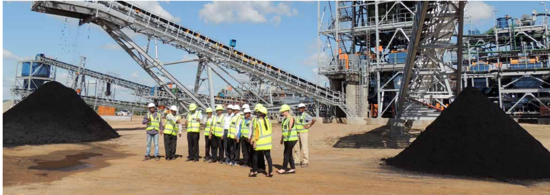
JSPL are now ready to export coal shipments