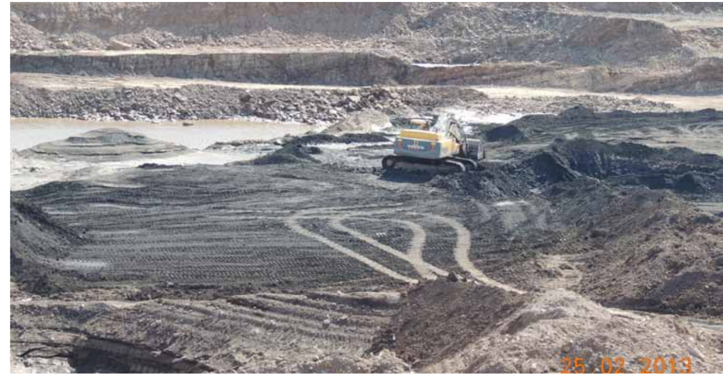
JSPL plan to build a coal-fired power plant

“ONE OF THE THINGS THAT PLEASES US MOST IS THE FACT THAT DURING OUR TIME IN MOZAMBIQUE WE HAVE WITNESSED THINGS CHANGING FOR THE BETTER”