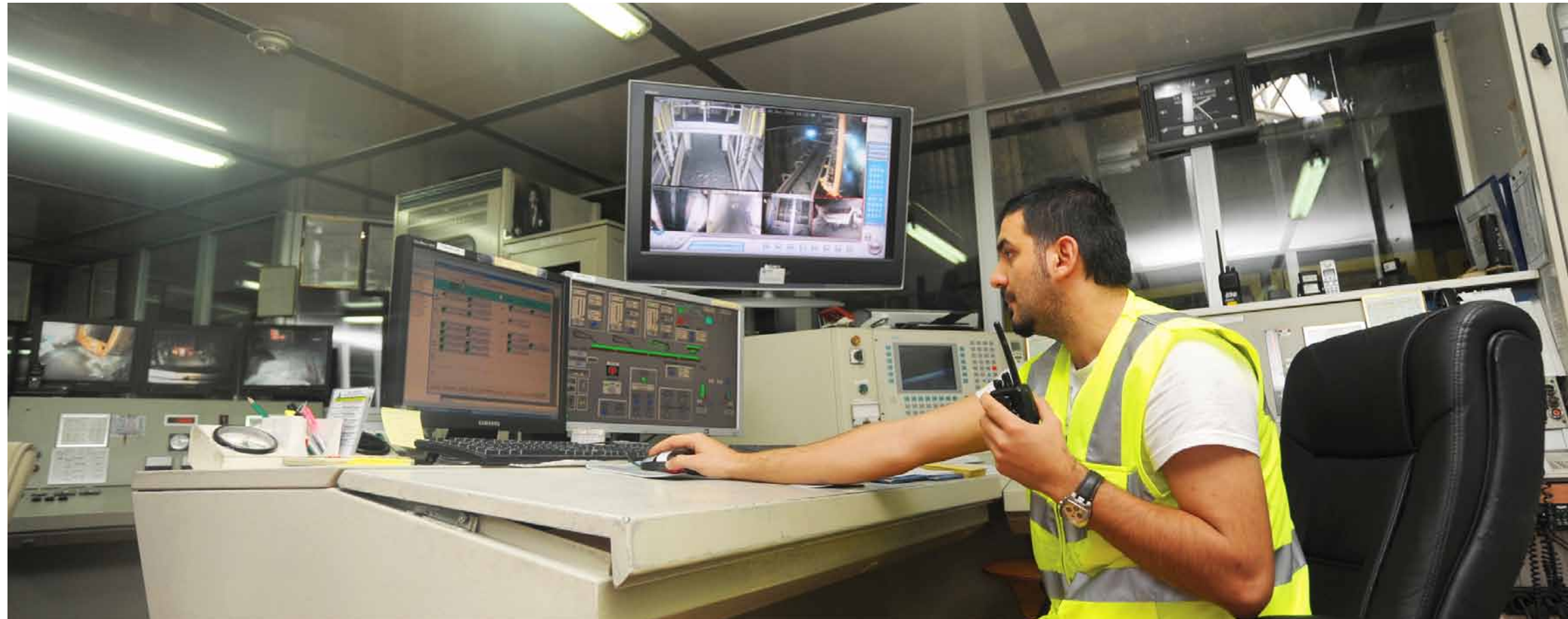
Mine control room

has been in operation for a number of years and over that time, environmental restrictions on mines have increased,” says Anderson. “So we have acted to bring the mine into compliance with new standards and new best practices and are committed to doing that. Similarly with safety, what was acceptable before is no longer acceptable now.” With safety in mind, the company has invested in a number of new refuge stations in the mine, which are self-contained and designed to support life for approximately 36 hours. Each refuge has its own oxygen supply and has a scrubber system to remove carbon monoxide and carbon dioxide.