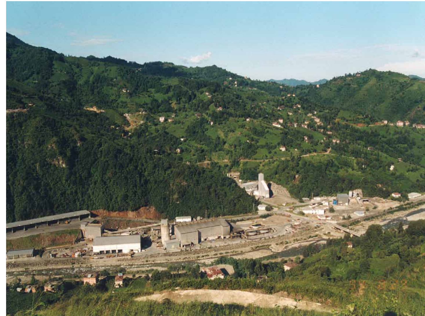
The mine is located in Rize province

equipment, it becomes pretty difficult logistically. So certainly, we believe that the implementation of mine control and PITRAM has led to significant and measurable improvement in completion of our activities week-on-week.”