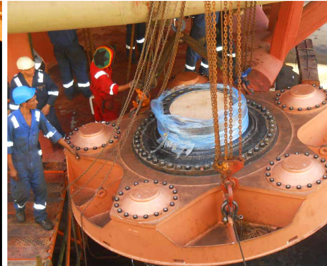
Refitting of Voith rotor into Enseleni Harbour tug

“IF A CUSTOMER NEEDS SOMETHING DONE QUICKLY AND DONE WELL THEY KNOW THERE IS NO BETTER COMPANY TO TURN TO THAN HESPER ENGINEERING”