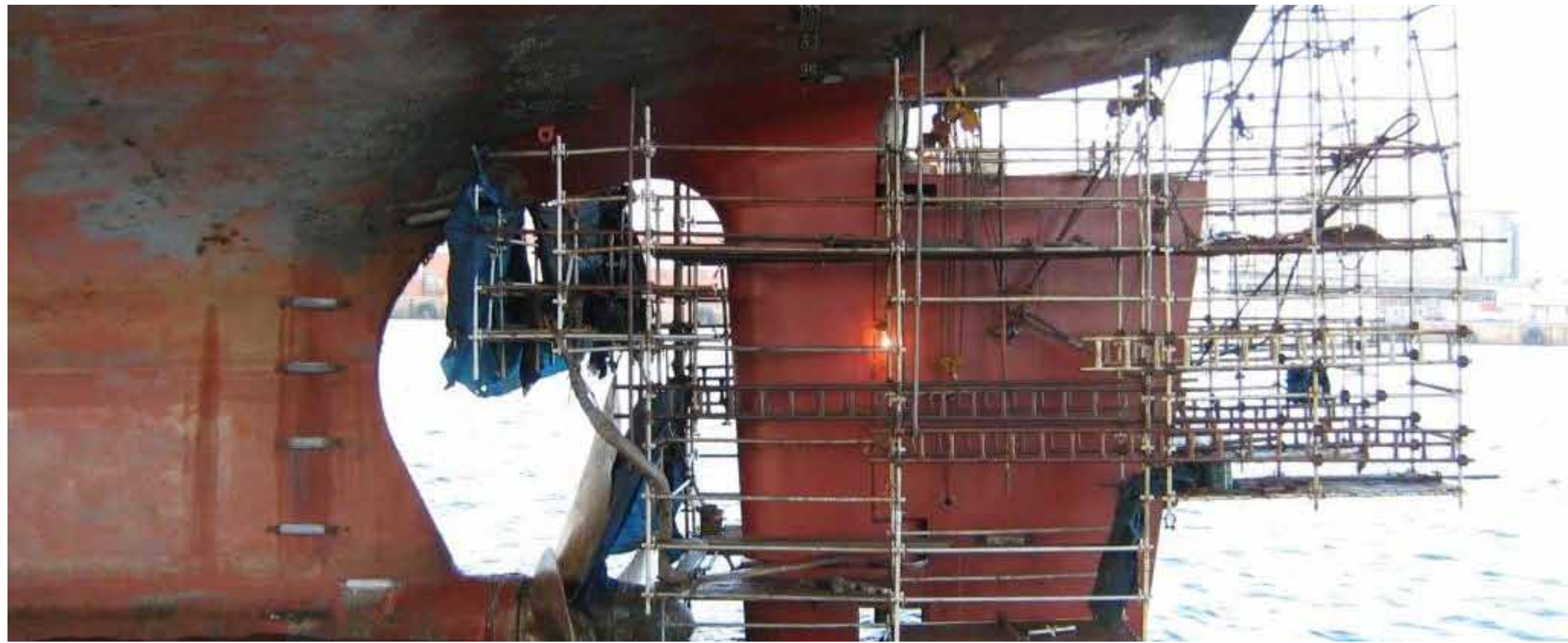
Rigging new rudder into position while vessel afloat

Other large-scale projects include the lengthening and converting of the M.V North Star to a mono hull design and the building of additional fuel tanks on behalf of Carrier Marine in 2009, and a multi-faceted project involving the Transnet National Port Authority’s Enseleni Harbour Tug in 2010. This latter job involved the stripping