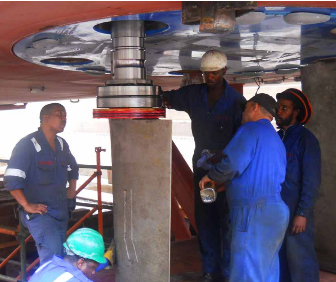
Refitting of Voith blades into new rotor