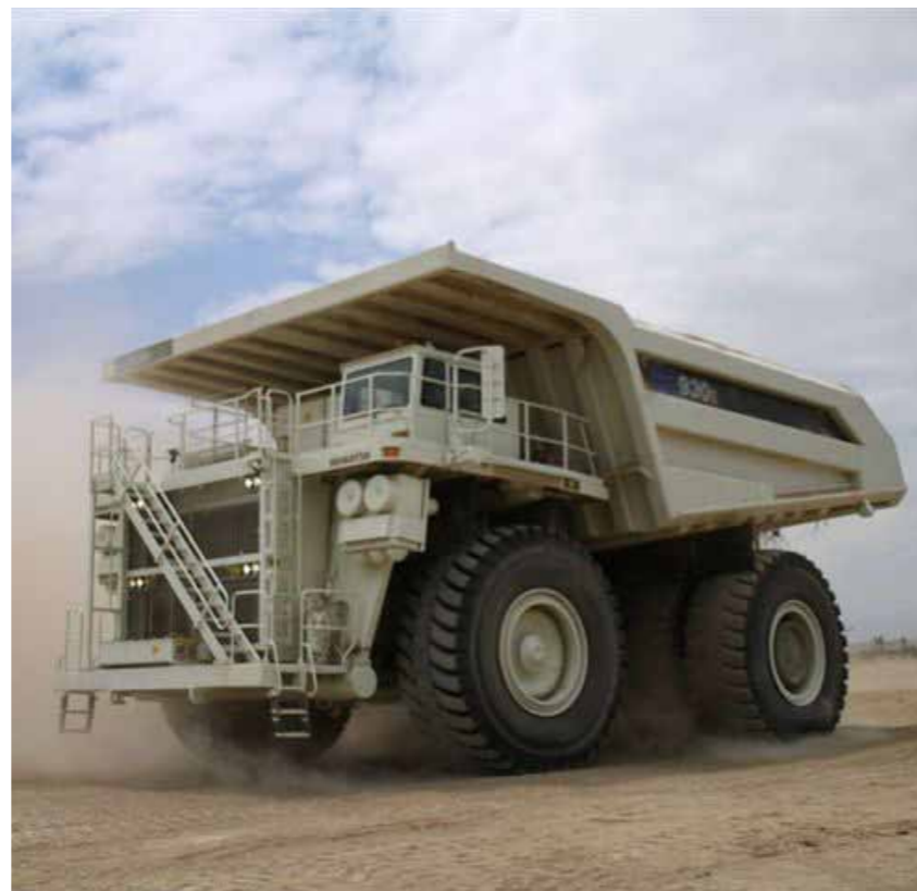
Truck on the move at Peñasquito