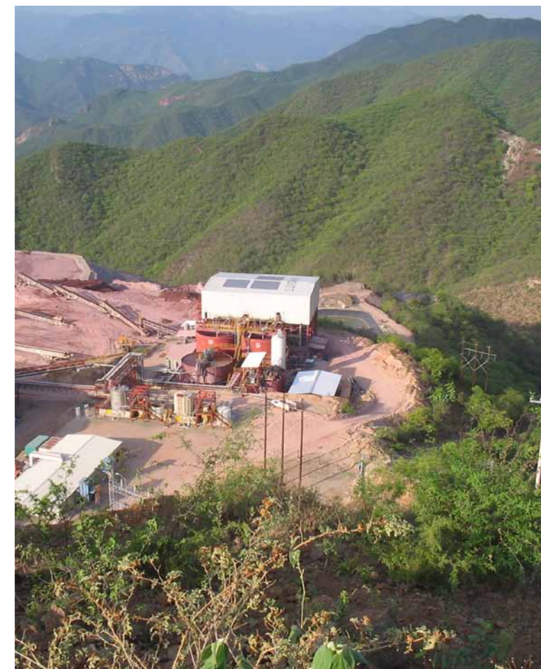
Looking down towards El Sauzal

“LOS FILOS CAME ON STREAM IN 2007 AND THIS YEAR IS EXPECTED TO PRODUCE 345,000 OUNCES OF GOLD”