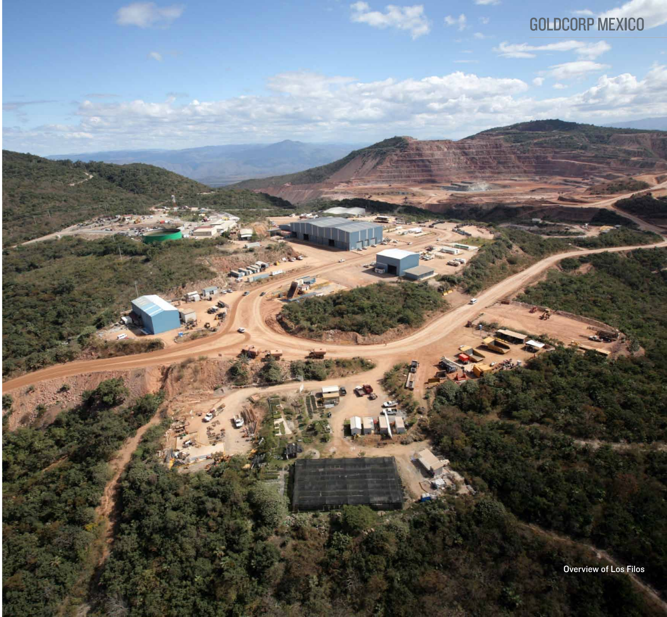
Overview of Los Filos

However, as El Sauzal was going into decline in the fabled mountain range of Sierra Madre, in the equally evocative