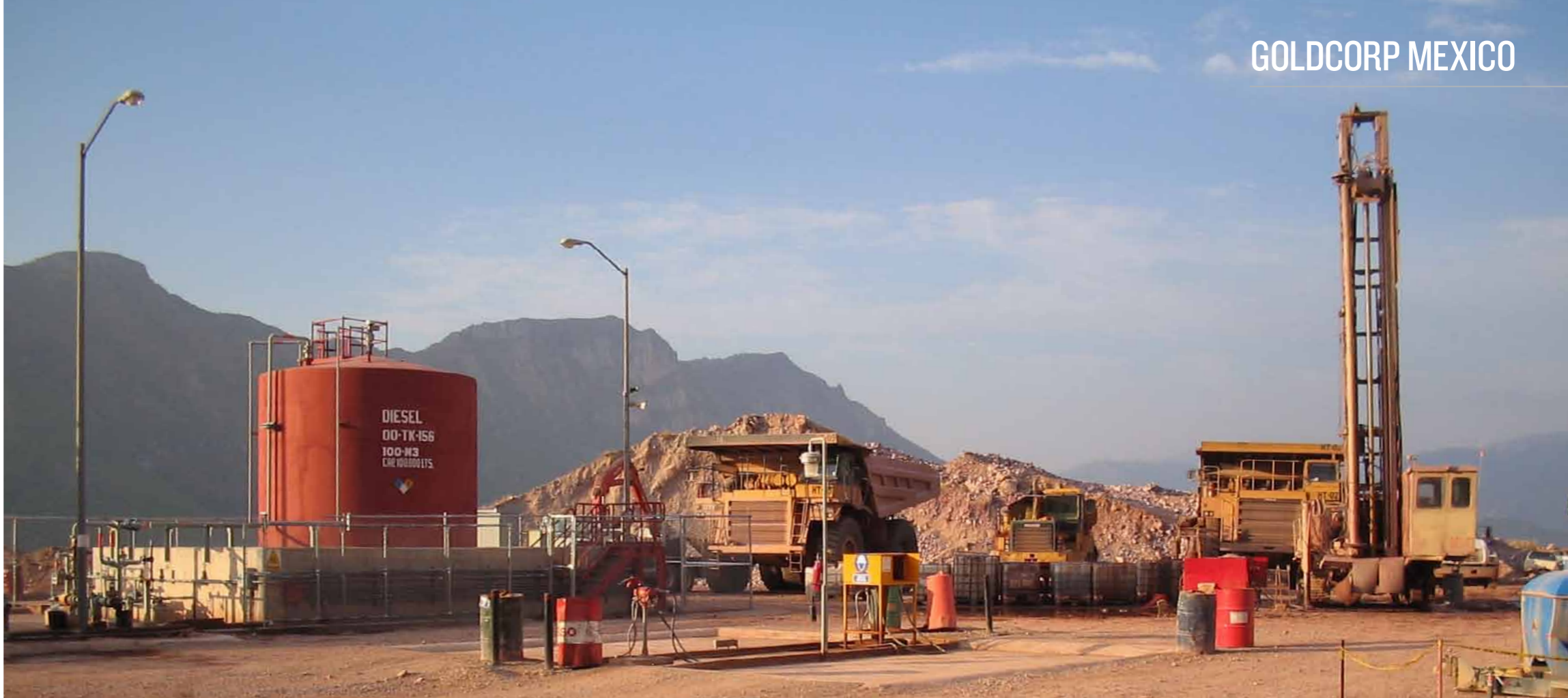
Machinery at El Sauzal