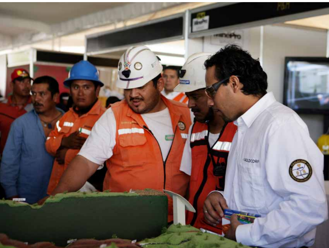
Discussing strategy at Los Filos