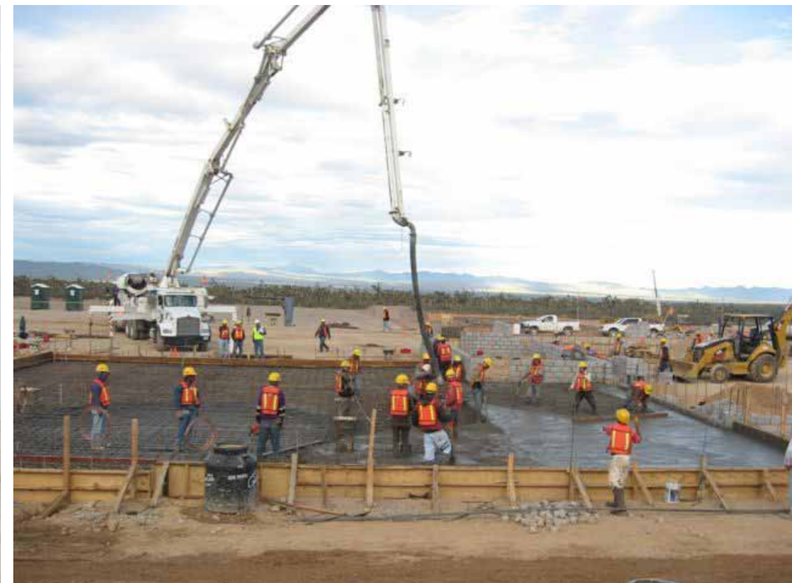
Workers at Peñasquito