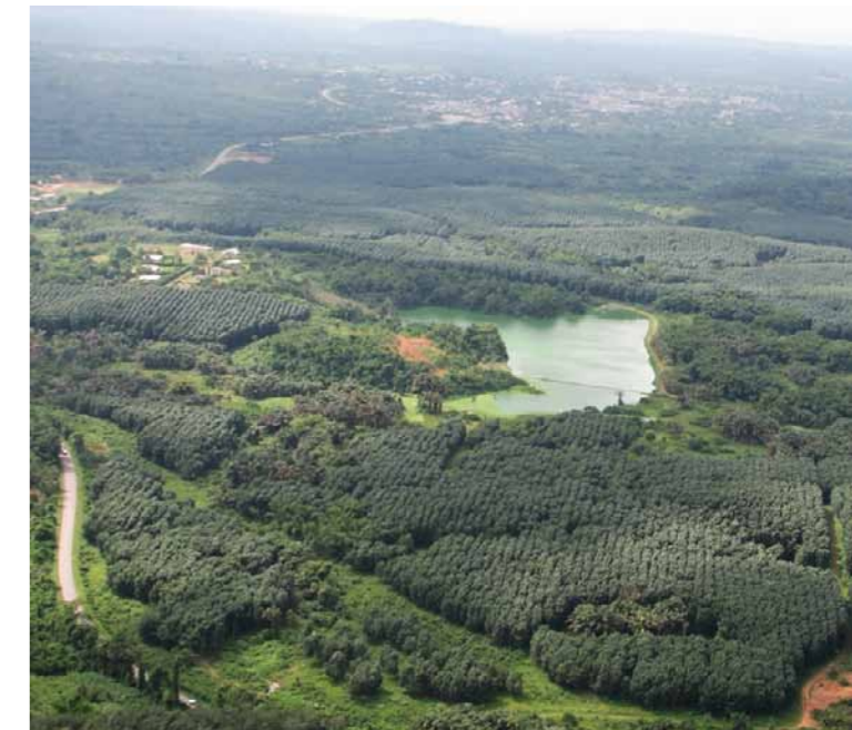
Aerial view of plantation

GREL also recognises the importance of building a good, sustainable and long-term relationship with its out growers. "We are committed to buying all the rubber produced from these four hectares and we have a 30 to 35 year 'contract' (all the economic life of the trees) to buy from them," Barre says. "The price we pay is based on 64 per cent of the Singapore Commodity Exchange price,