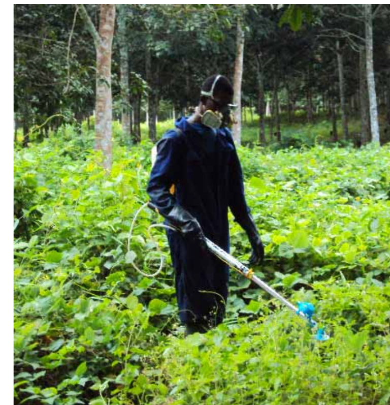
Worker on plantation

“OVER THE NEXT FIVE TO SIX YEARS WE WILL BE TRIPLING THE SIZE OF OUR FACTORY”