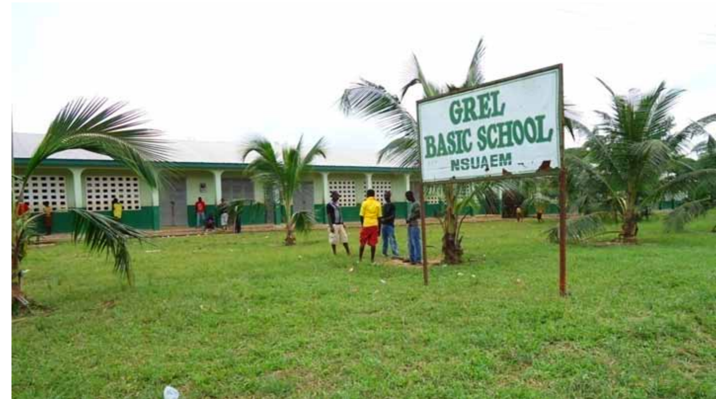
GREL Basic School at Nsuaem