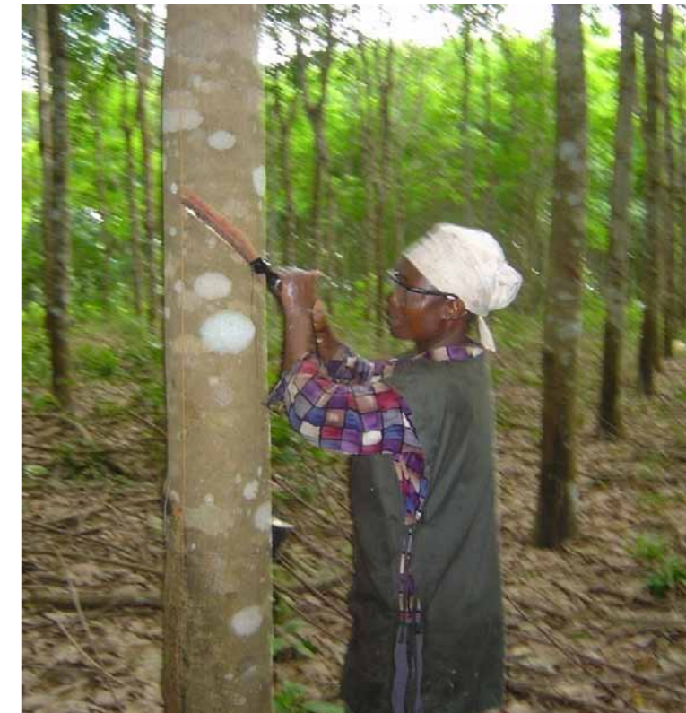
Rubber tree on plantation

"WE ARE CURRENTLY IN PHASE FOUR OF AN EXPANSION PROJECT WITH OUR OUT GROWERS THAT STARTED BACK IN 1992"