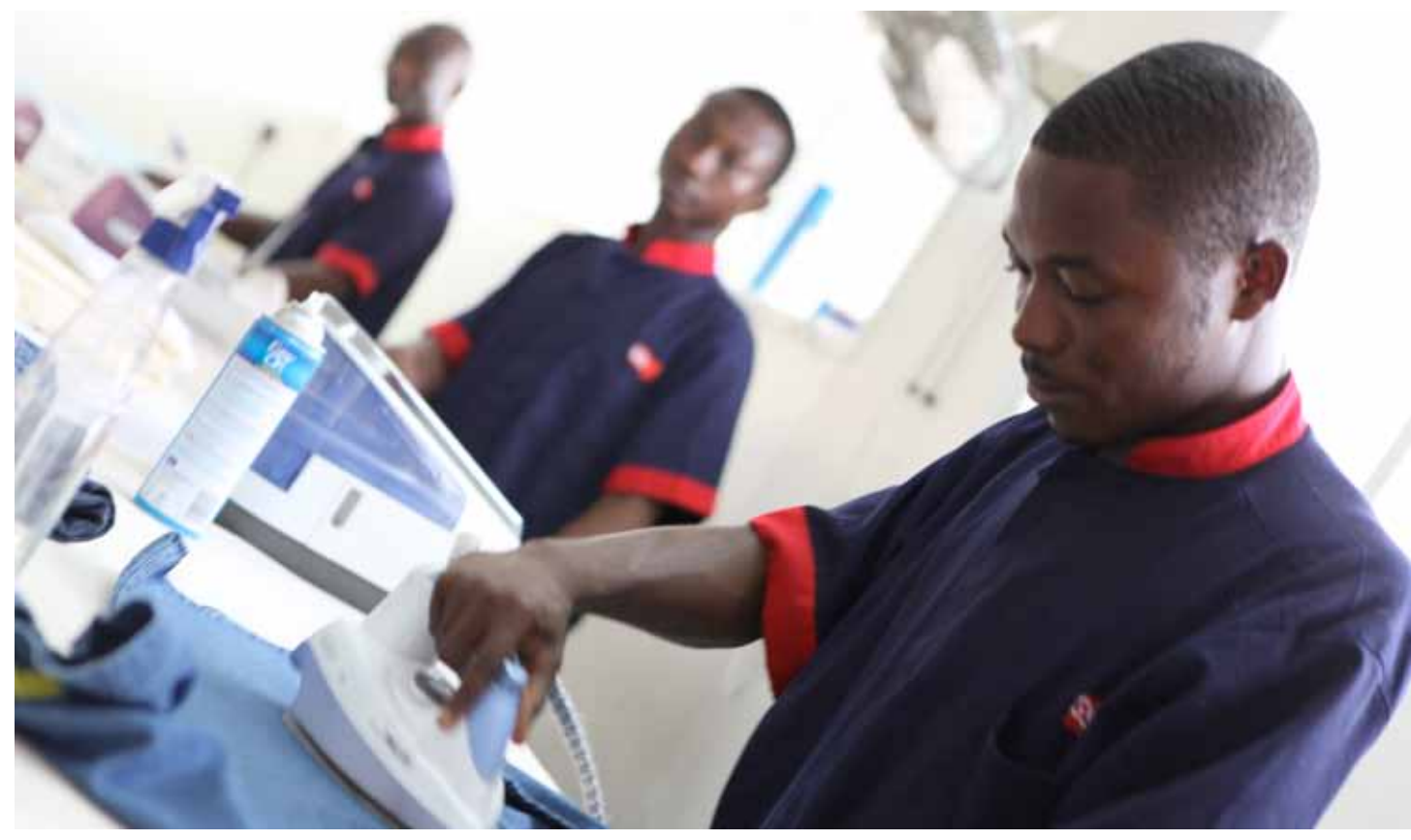
GSS laundry service

by its team. It is GSS' goal to pay attention to every single detail and to keep its clients' workplace tidy and their lodgings homely, to meet and exceed their expectations.