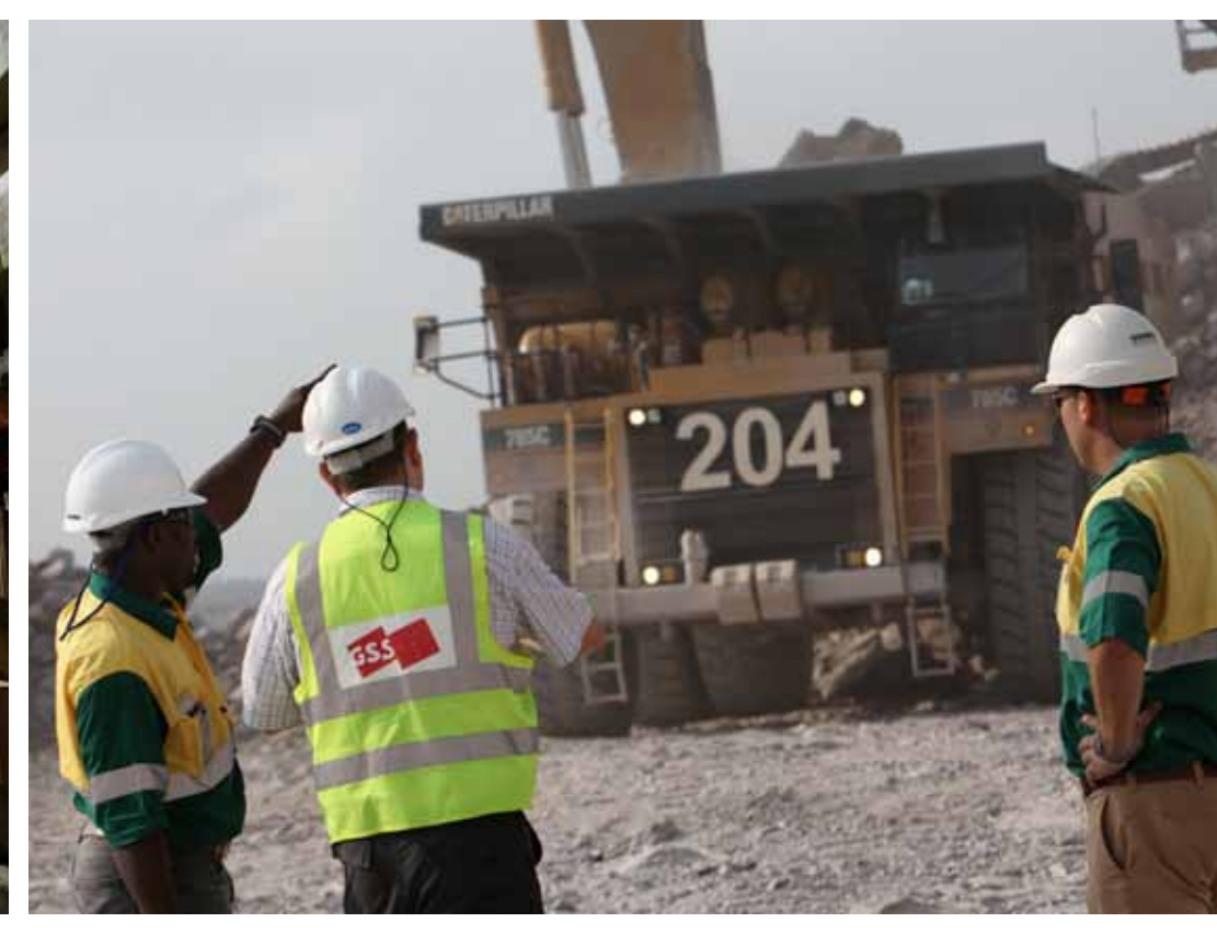
GSS can source temporary structures