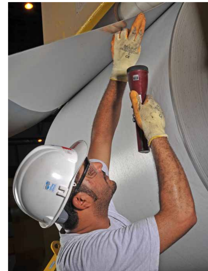
Quality inspection at United Stainless Steel Company

“FOULATH HAS GIVEN ITS INVESTEE COMPANIES A UNIQUE COMPETITIVE COST ADVANTAGE”