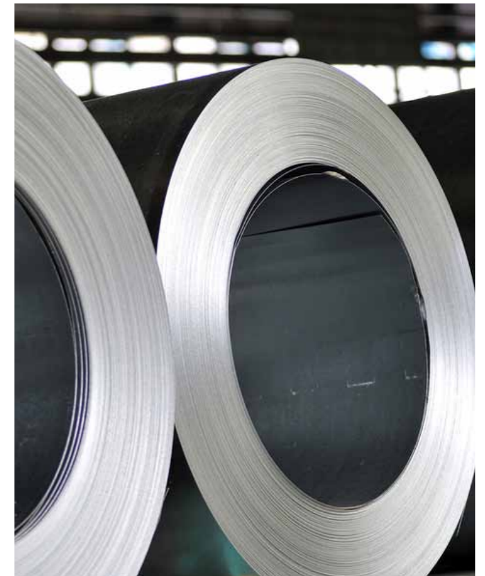
Steel is used across a wide range of applications

“ONCE UP AND RUNNING IT WILL BE THE FIRST FULLY INTEGRATED FACILITY OF THIS NATURE IN THE REGION”