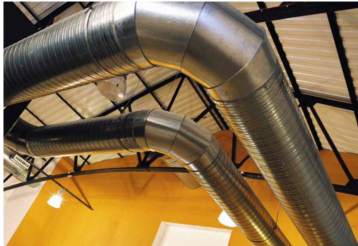
Eskom is working hard to promote energy efficiency

This heat pump campaign, along with a similar rebate incentive on solar heating, are two areas where local suppliers and merchants can take more of a role. The schemes are being administered through Eskom registered suppliers (and through the Sustainable Energy Society