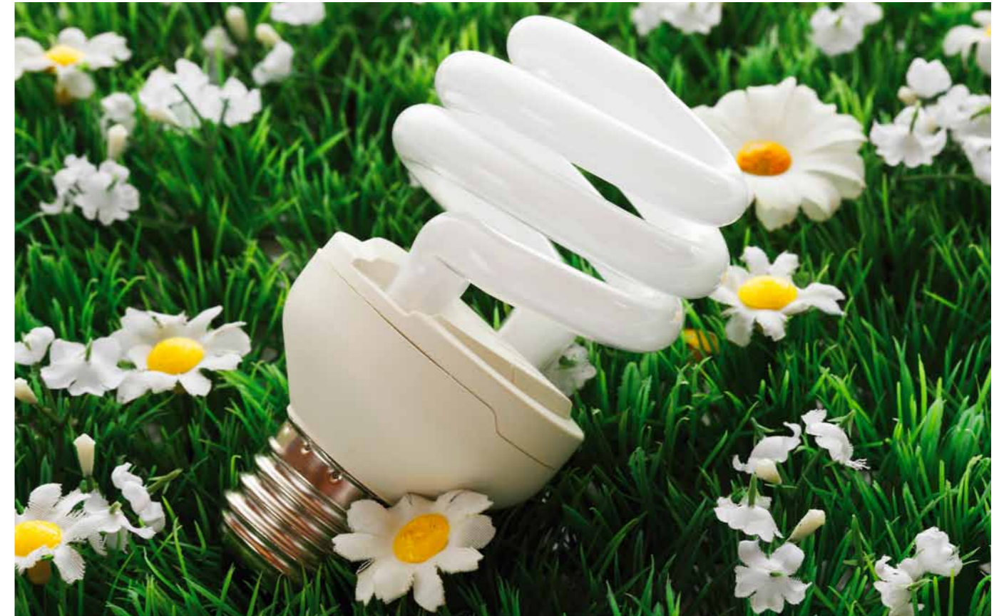
CFLs only consume one third of the power of incandescent bulbs

Etzinger, “is to switch from incandescent bulbs to CFL [compact fluorescent lighting]. Worldwide, there have been bold initiatives to see incandescent lights phased out by 2012. In the UK, over 39 million CFLs have been installed in houses to promote energy efficient lighting. South Africans too have seen the light: Eskom has fitted 47 million CFLs in homes across the country. This has resulted in a saving of 1,800MW of electricity—the equivalent to half a large power station.”