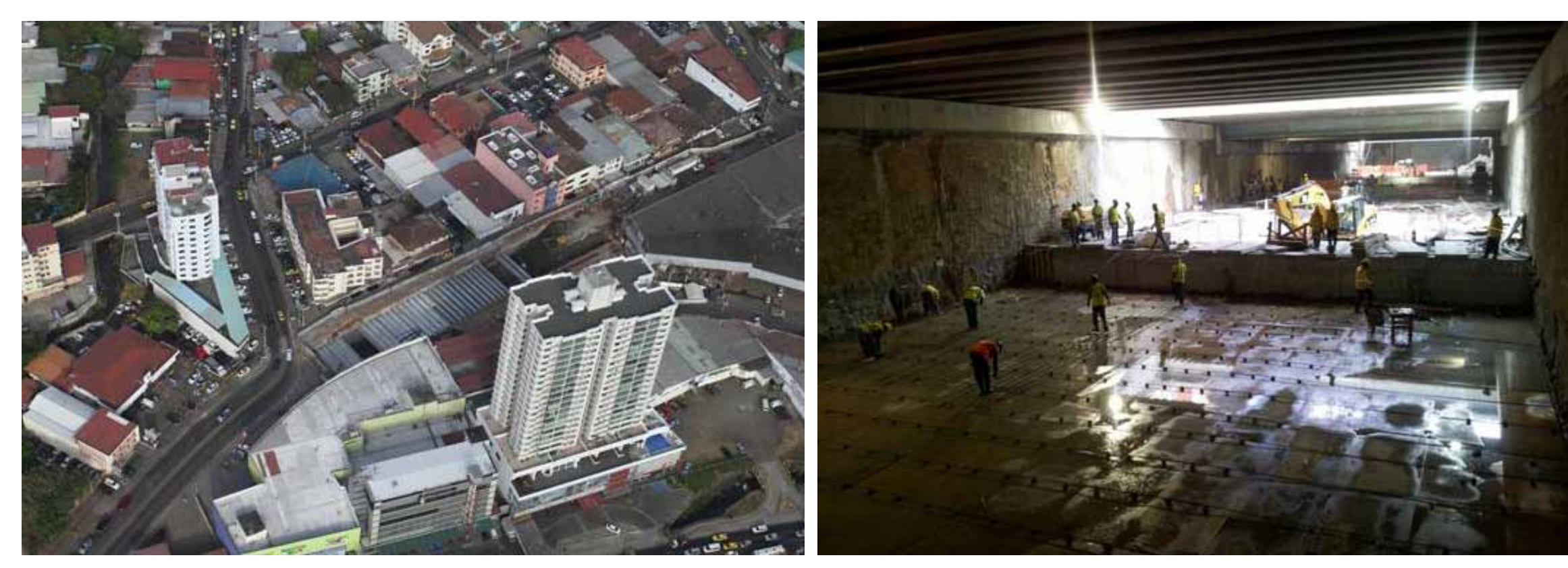
Aerial view of excavation operations

The TBMs are one example of the use of the best available technology in construction, and so is the new rolling stock. Built by the French company Alstom at its Barcelona plant, these are the latest generation in transportation, though some concessions are made to human concerns. "We will have an almost entirely automated system," he says, "but focus groups and questionnaires told us that they would feel safer if there was a real person in charge!" Accordingly the trains will be manned though there will be little for the conductor to do other than supervising the closing of the doors. Initially the trains will