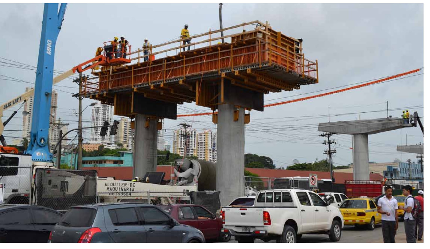
The Metro will run on elevated tracks in the suburbs