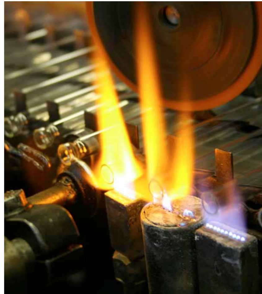
Anchor Rand - glass blown with Egoli Gas