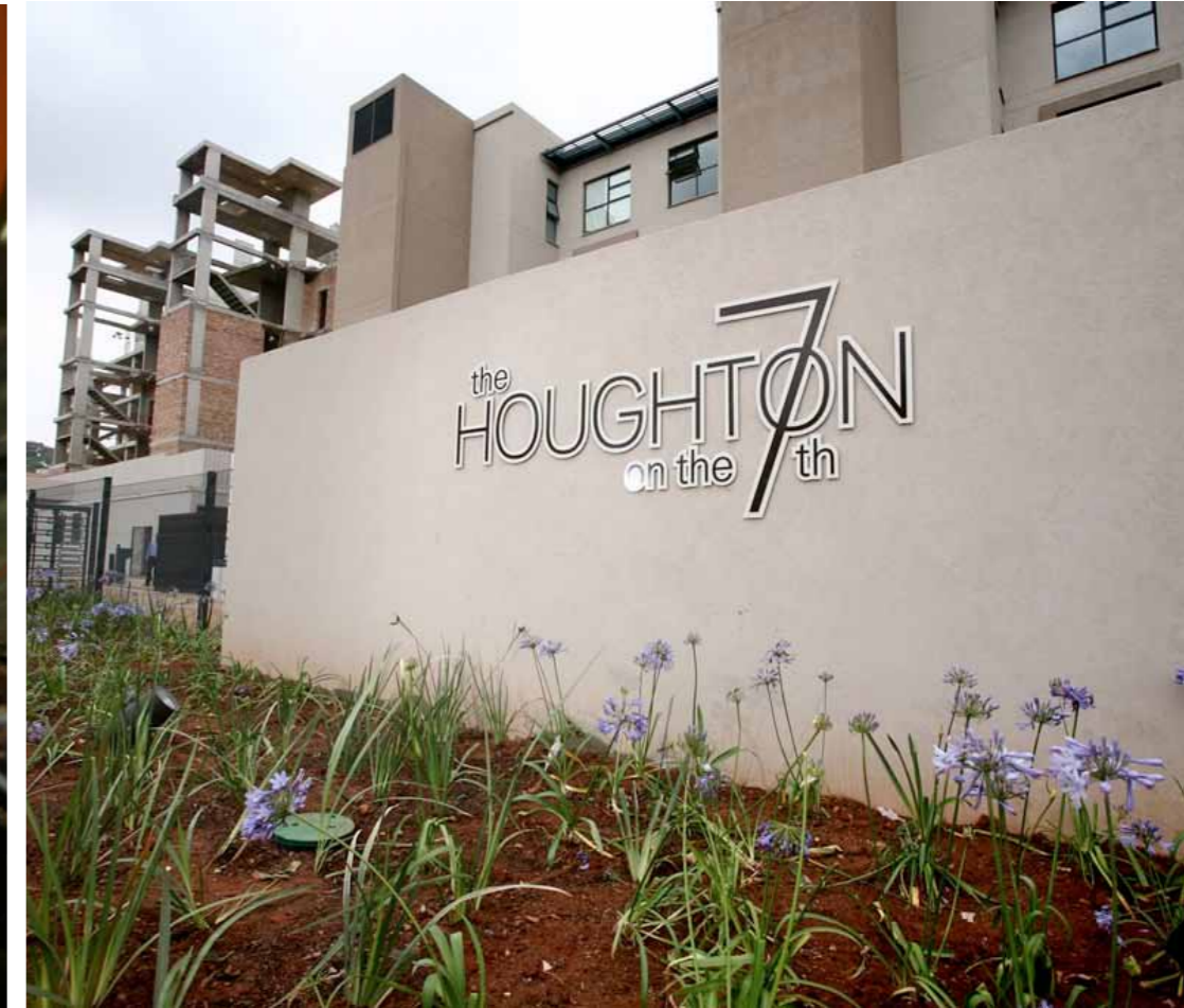
The Houghton development