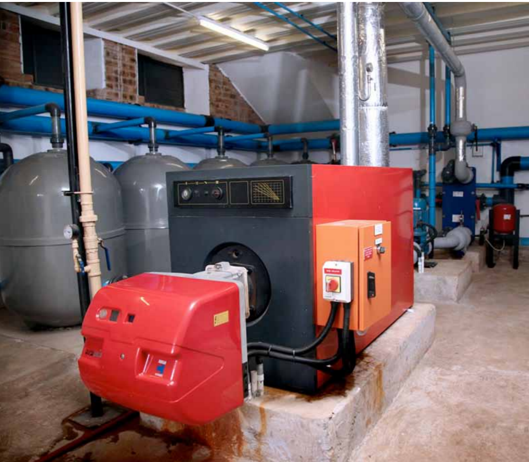
St John's College gas installation