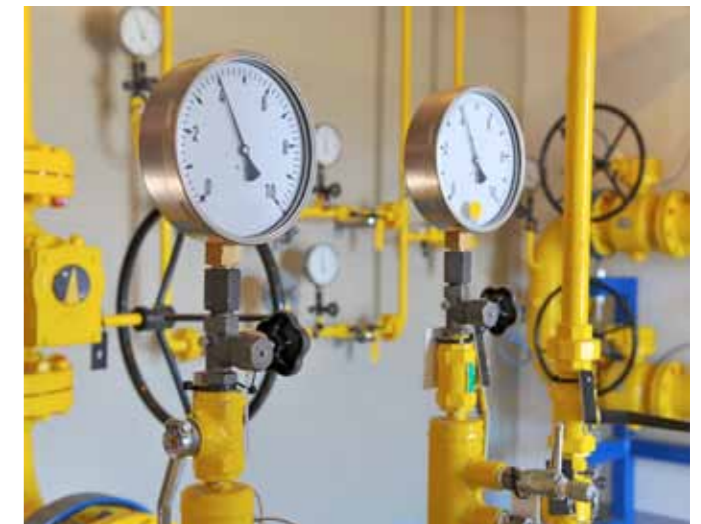
Pressure meter on natural gas pipeline

“RELEASING 45 PERCENT LESS CARBON DIOXIDE INTO THE AIR THAN OTHER FORMS OF ENERGY, NATURAL GAS IS THE CLEANEST BURNING FOSSIL FUEL”