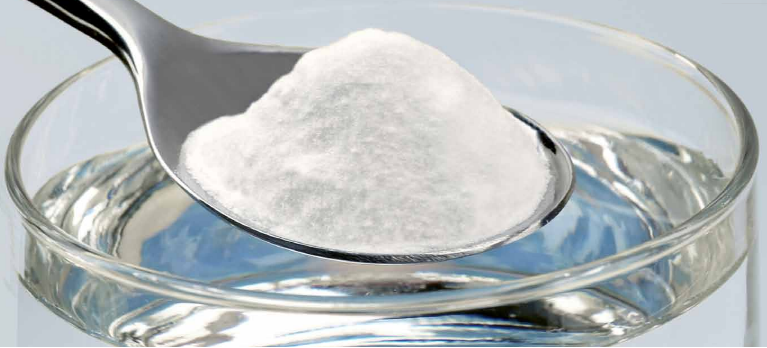
Sodium carbonate is a natural water softener

Soda ash is perhaps better known as sodium bicarbonate, and it is a substance with a very large number of applications and uses. Far from being just an antacid that one can take to counteract dyspepsia after a night out, it can be used as a regular food additive, giving sherbet its fizz and noodles their texture. It is also used in baking, photography, as a degreaser, a water softener or a fixative for dyes.