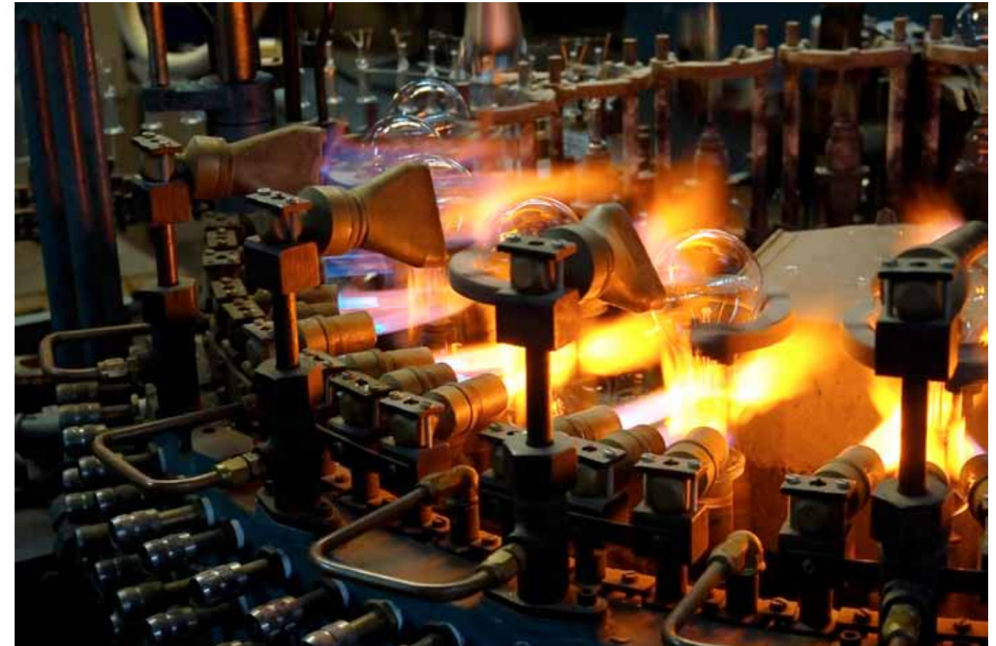
The largest consumer of sodium bicarbonate as a raw material is the glassmaking industry

Tel. +86 4000989518 | Mobile: +86 139 0316 8821 | www.cniet.com | www.julikeji.com.cn