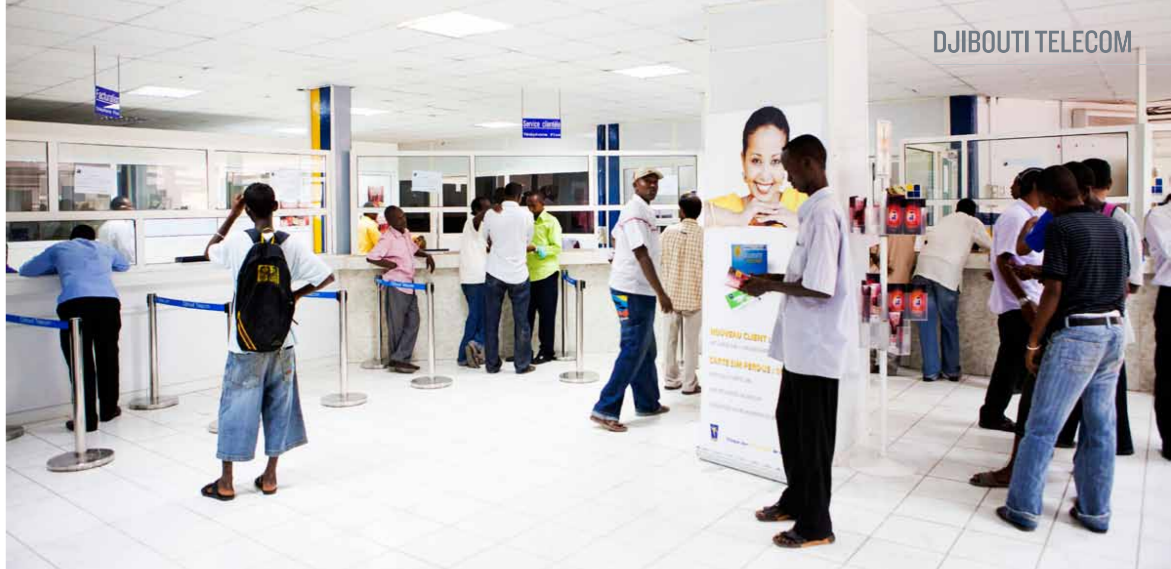
Djibouti Telecom's Evatis sales agency

Back in December 2012, Djibouti Telecom successfully launched a new 3.5G mobile service in Djibouti, thus augmenting its existing 2G GSM and 2.5G EDGE platforms.