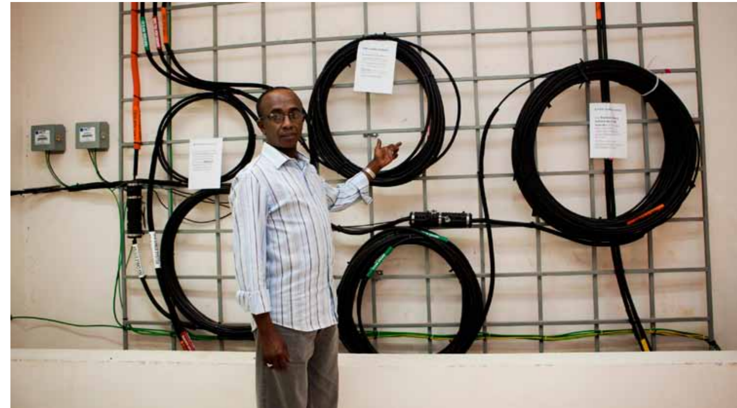
Entry of submarine cable

“OUR INVESTMENT IN INTERNATIONAL INFRASTRUCTURE HAS PLAYED A MAJOR ROLE IN OUR SUCCESS TO DATE”