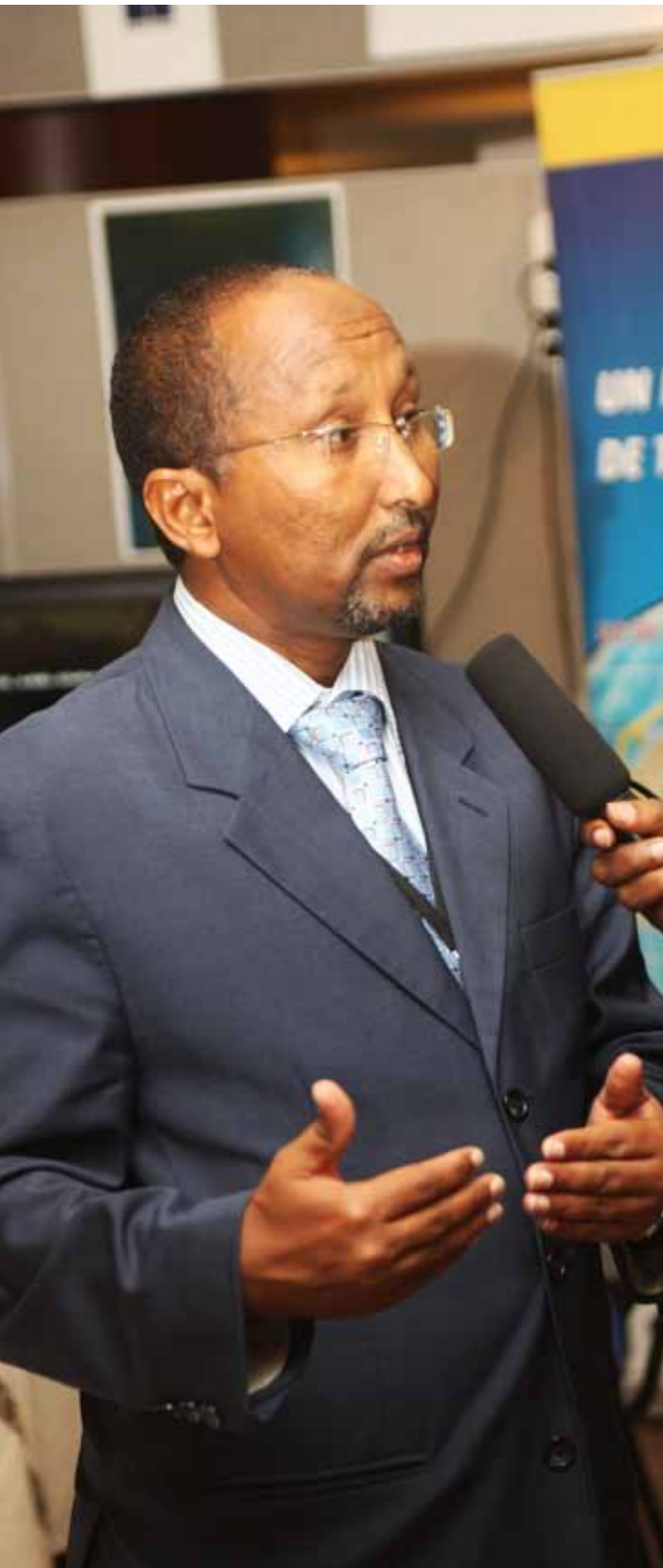
The General Manager at an international forum

international expansion comes on top of the fact that Djibouti Telecom remains the sole provider of telecommunications services in its home country.