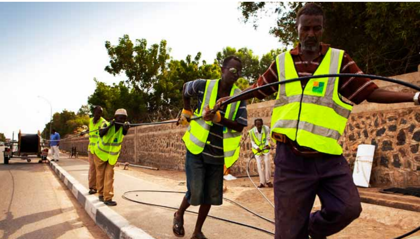
Backbone network being laid

and readily available service and that can drive the most capacity. Not only do we believe that we can provide this, but we are also looking to further develop our premium offerings for this very purpose.”