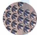
Double grooved tube sheets