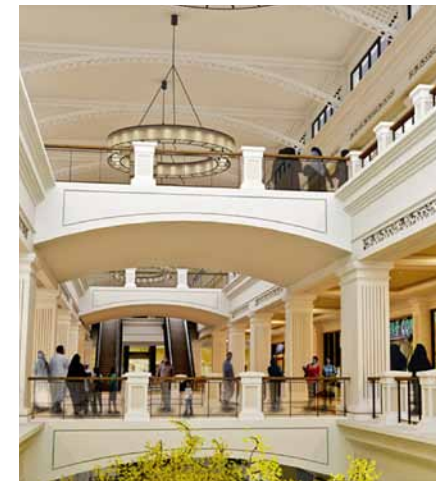
The Mall has four levels

visitors through its doors each year. The eye-catching landmark building extends over four levels, including an extensive parking facility for over 3,000 vehicles. Modelled in an elongated H shape, each end of the building houses the key anchor outlets for both retail and entertainment. The French hypermarket chain Carrefour is scheduled to open an extensive supermarket at one end of the first floor while the Landmark Group's popular apparel stores Centrepoint and Max will be located at the other end. Linking these two will be a range of smaller