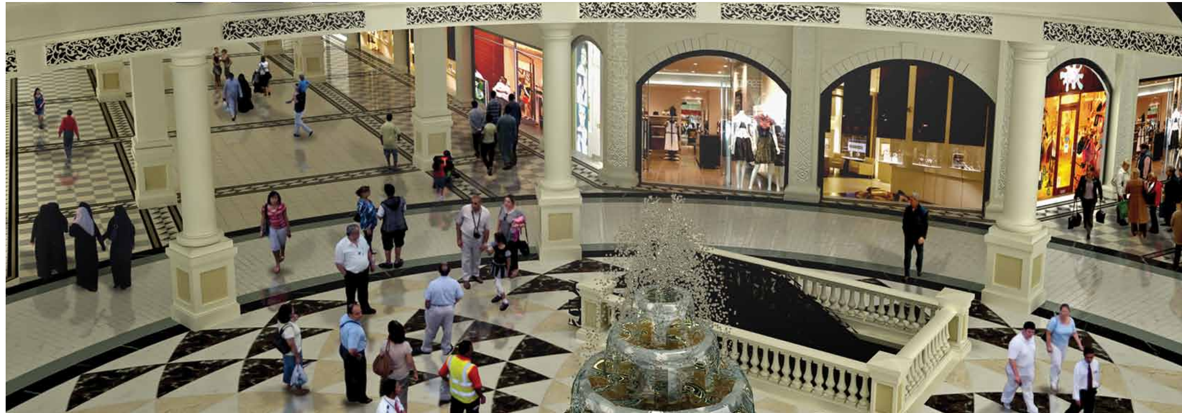
The Mall will open in just eight months' time

Another interesting and attractive feature of the Deerfields Town Square Mall is the garden level on the ground floor. This has both an indoor and