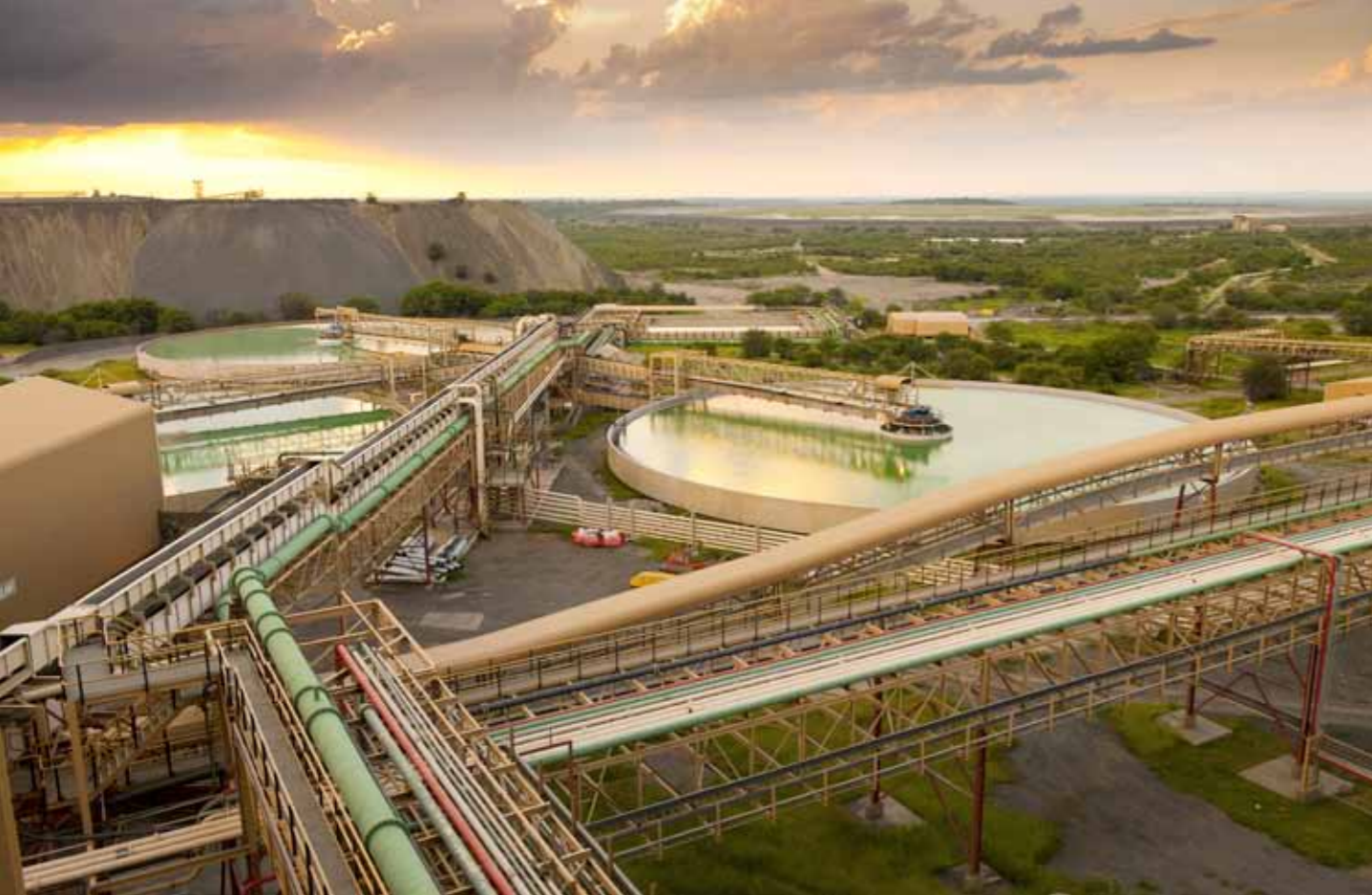
The Process Plant - a view across the large thickeners at the Venetia plant

buy diamonds, but China is really starting to participate in luxury goods markets, and with midstream and downstream diamond beneficiation, Bone notes. “They are building their capacity to cut and polish rough diamonds, and they already have robust institutions overseeing the industry.” As a good indication of how China is determined to be seen as a responsible trader, it is currently vice-chair of the Kimberley Process, established in 2003 to cut off the trade in conflict diamonds, and will take the