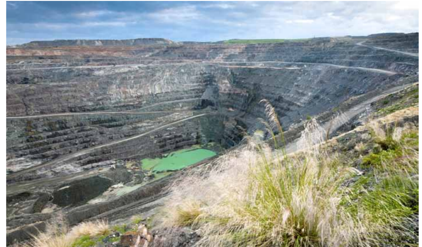
A view of the Venetia Diamond Mine open pit

Based in Cape Town, ADP Group of Companies consists of ADP Holdings, ADP Marine and Modular, ADP Projects with ADP Namibia and ADP Africa servicing the African continent. ADP Projects specializes in providing Engineering, Procurement, Construction and Management (EPCM) services and EPC projects to the Mineral Industry with a small representative office in Johannesburg.