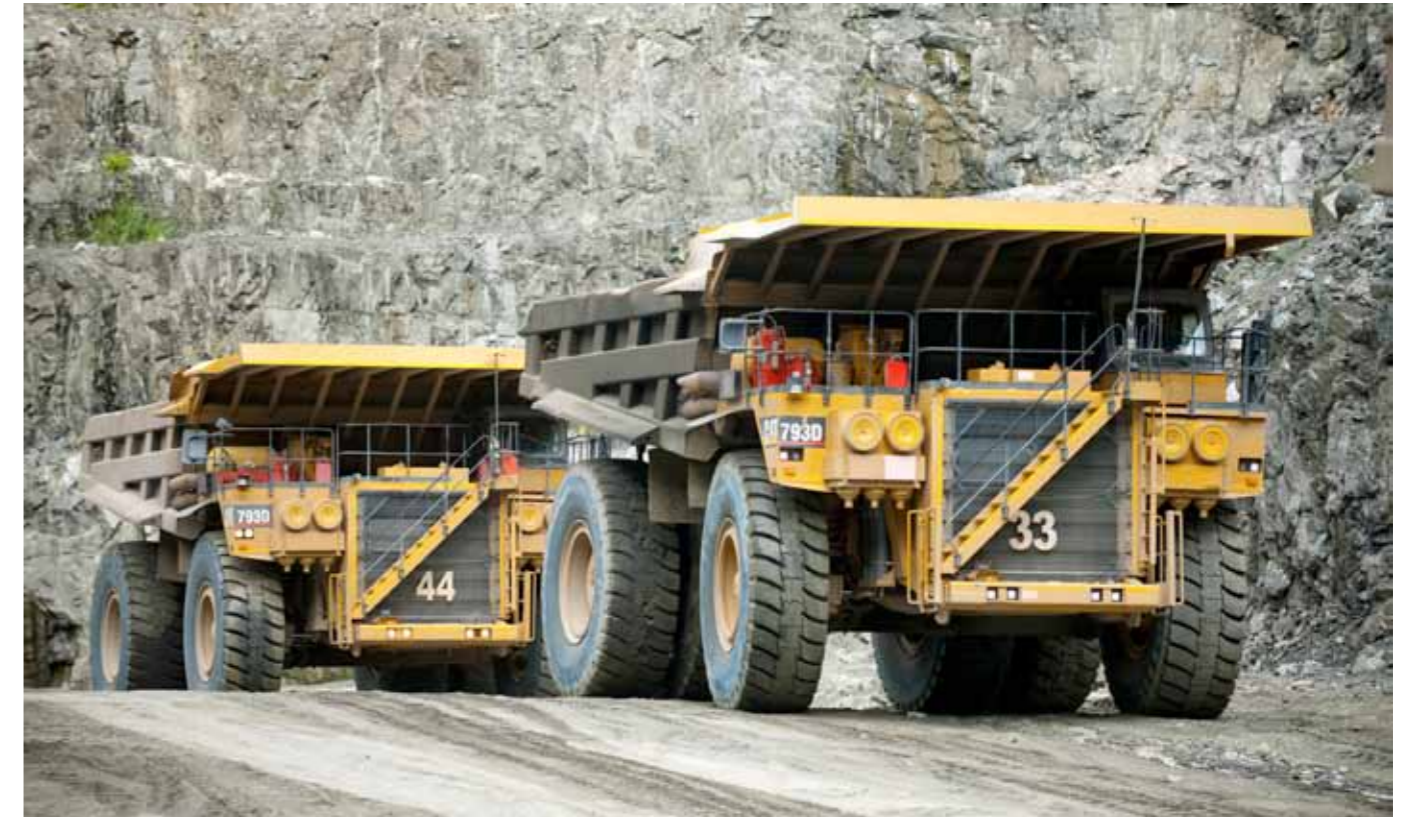
The trucks are lining up at the start of the shift ready to transport kimberlite ore to the primary crusher

Atmei Construction was established in 1970 and we have since been involved in the petrochemical industry. We pride ourselves by having provided exceptional quality and service to the industry in South Africa, Namibia, Botswana, Zambia, Lesotho and Mozambique. We ensure optimum utilization of resources, labour, materials and equipment, ensuring their procurement at most cost effective terms.