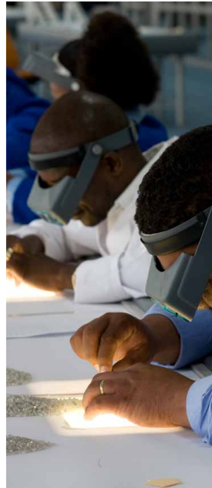
Sorting diamonds at DTC Botswana

“SHIFTING OPERATIONS TO GABORONE IS AT THE FOREFRONT OF THE MOVE TO FOSTER ‘RESOURCE NATIONALISM’”