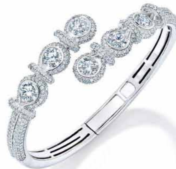
Forevermark Encordia bangle

It is certainly true that the policy of establishing a downstream industry in southern Africa has been a great success. Ten percent of all rough diamonds from Namibia, for example, being retained and sold locally to the 13 Sightholders that