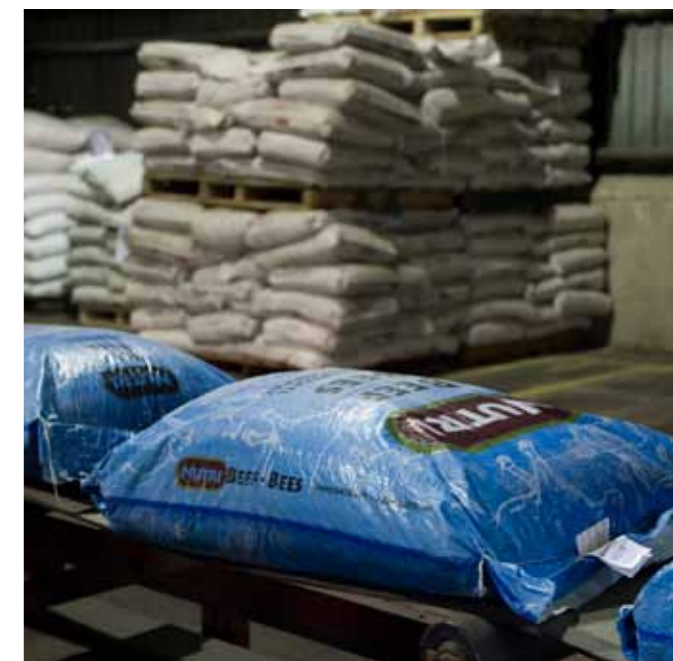
CBH produce 500,000 tonnes of feed a year