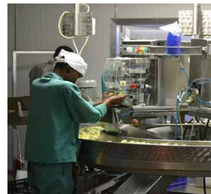
Operators in the Botswana factory

In April this year the IFC (International Finance Corporation, the private sector funding arm of the World Bank) provided