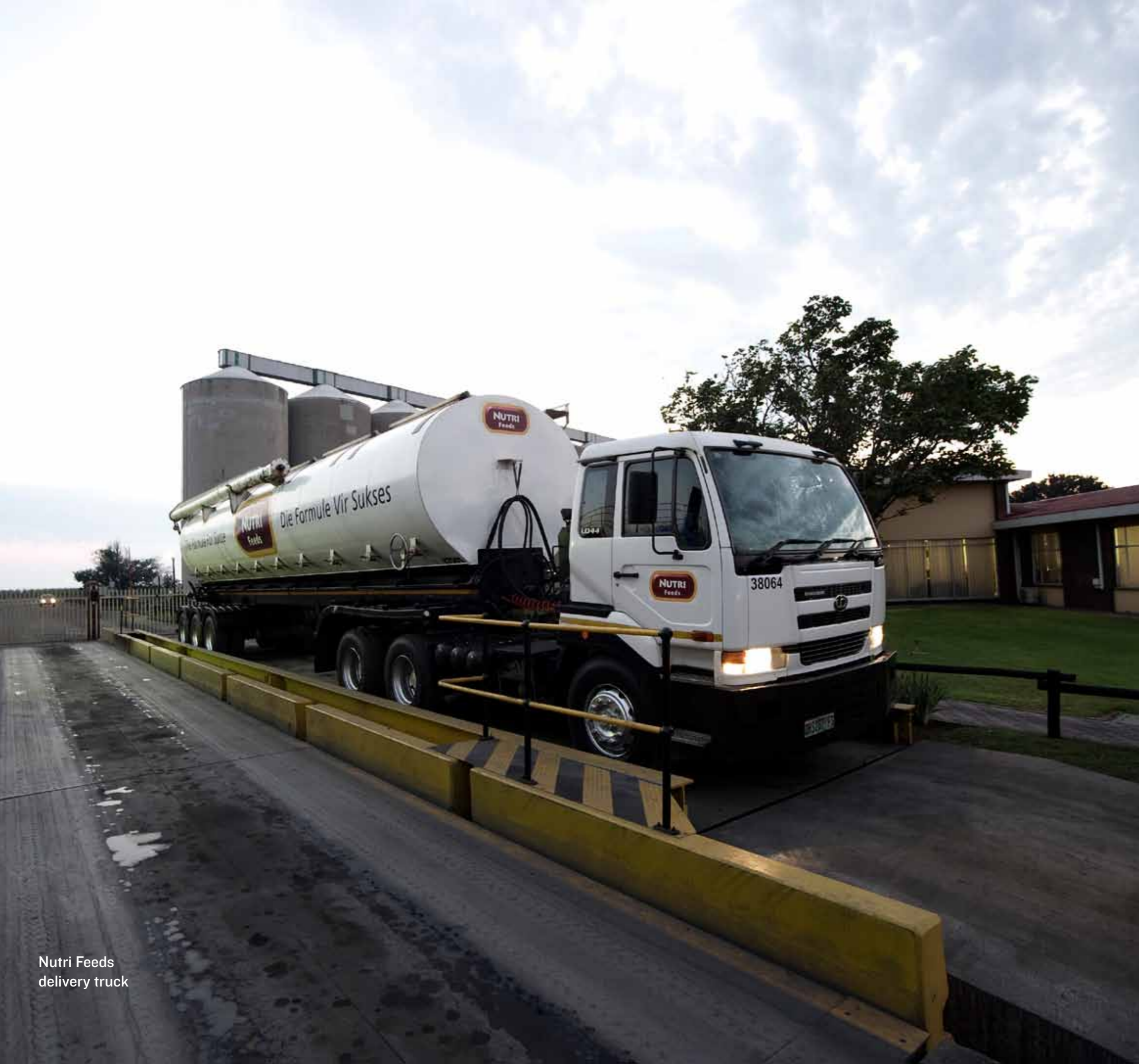
Nutri Feeds delivery truck

K evin James acquired CBH in 2003 when it was a small and struggling operation processing just 250,000 chickens a week at its Bloemfontein location. However, having just shaken the dust of Zimbabwe, where he had built up a thriving poultry business, he hit an auspicious moment for the South African market, with feed prices declining and chicken prices firm. A year later he and his partners were able to buy and restart an operation in Mafikeng turning out 400,000 birds a week. They increased the capacity of both operations and by 2007 had a joint weekly capacity of 1.5 million birds. To this they added a number of feed mills, and in that year listed the group on the Johannesburg Stock Exchange.