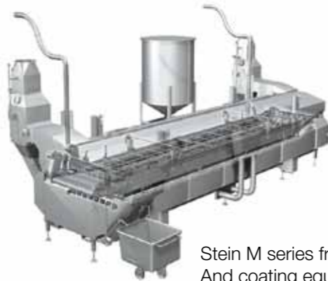
Stein M series fryers And coating equipment