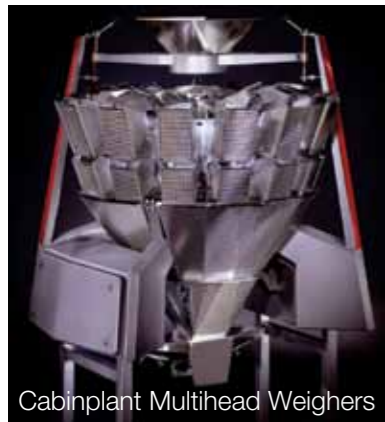
Cabinplant Multihead Weighers