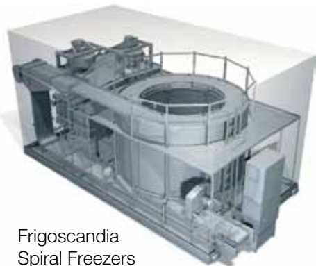
Frigoscandia Spiral Freezers