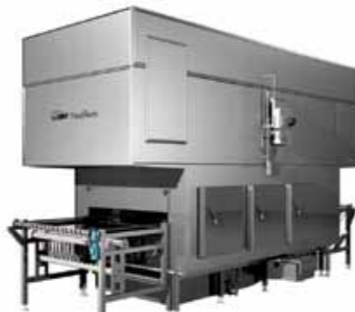
Double D Ovens