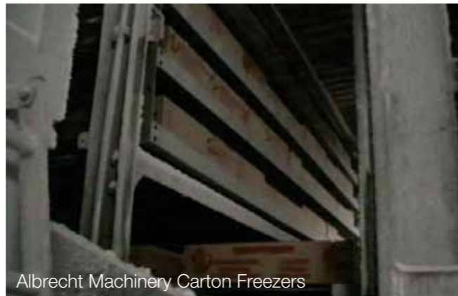
Albrecht Machinery Carton Freezers