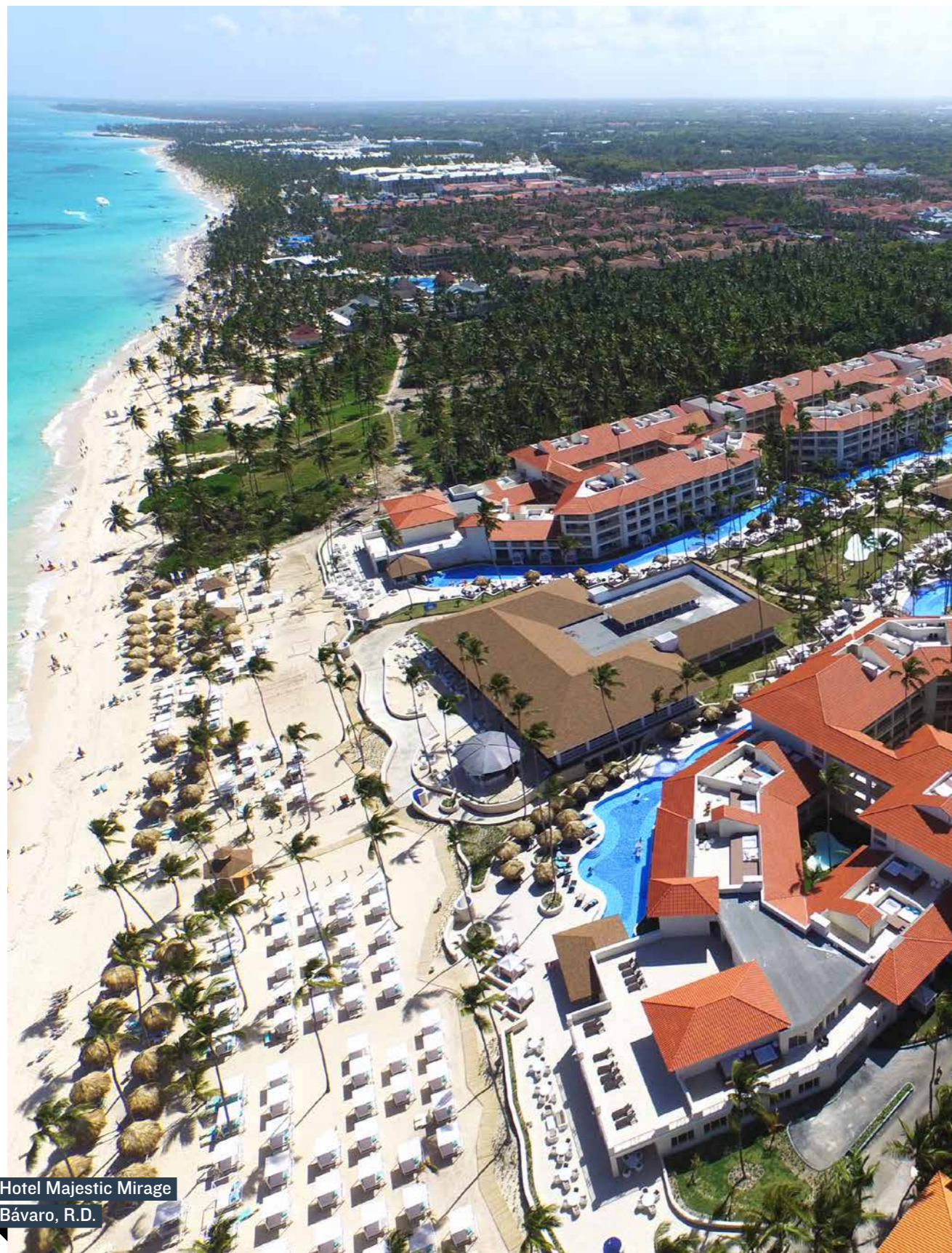
Hotel Majestic Mirage Bávaro, R.D.

D ominican Republic is the tenth largest economy in Latin America and the largest in the Caribbean and Central region, making it a very attractive destination for foreign investment in infrastructure, energy, real estate, tourism, agriculture, services and new sectors like film, technology and new media. The continued success of its national economy lies in the ability of Dominicans to leapfrog outdated development models, adopt new technologies, create a strong human capital base and remain a flexible host to incoming industries. This is the responsibility undertaken by construction firms like Constructora AE, SRL based in Santo Domingo and one of the country's most recognized design and construction firms.