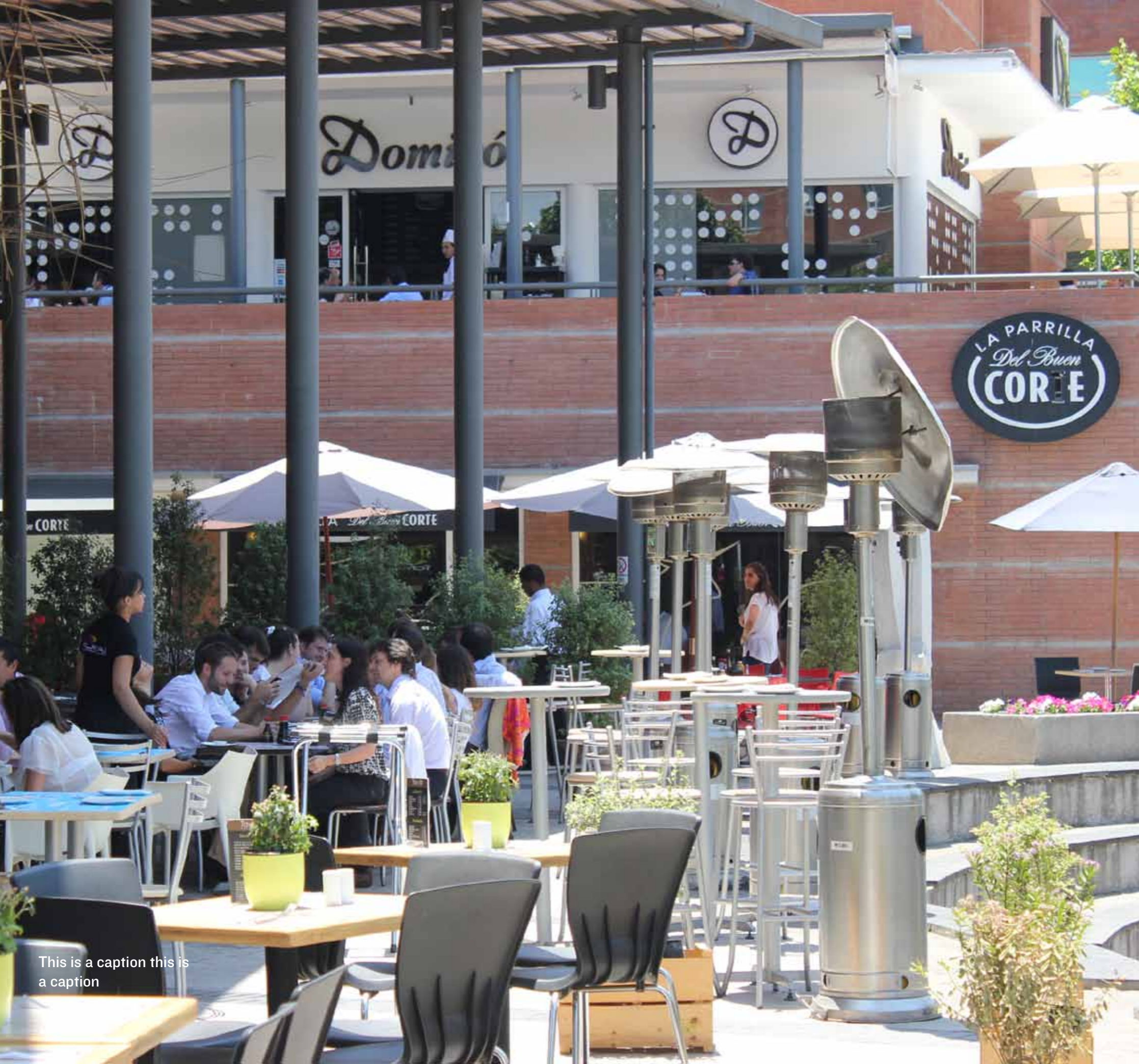
This is a caption this is a caption

For more information about Ciudad Empresarial visit: www.ciudadempresarial.cl