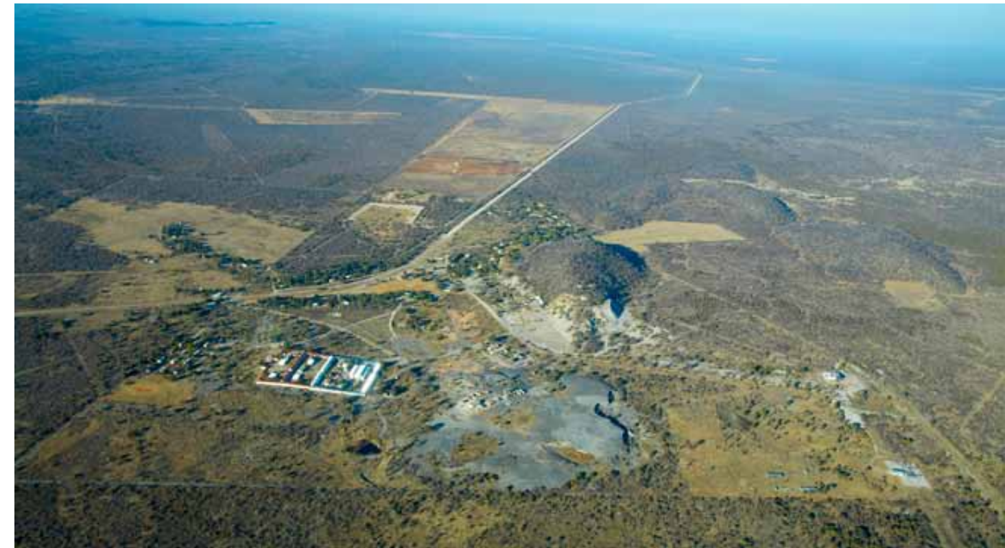
Aerial Berg Aukas

While the immediate focus for CAR revolves solely around the successful development of the Berg Aukas mine, its long-term strategy is to build a profitable