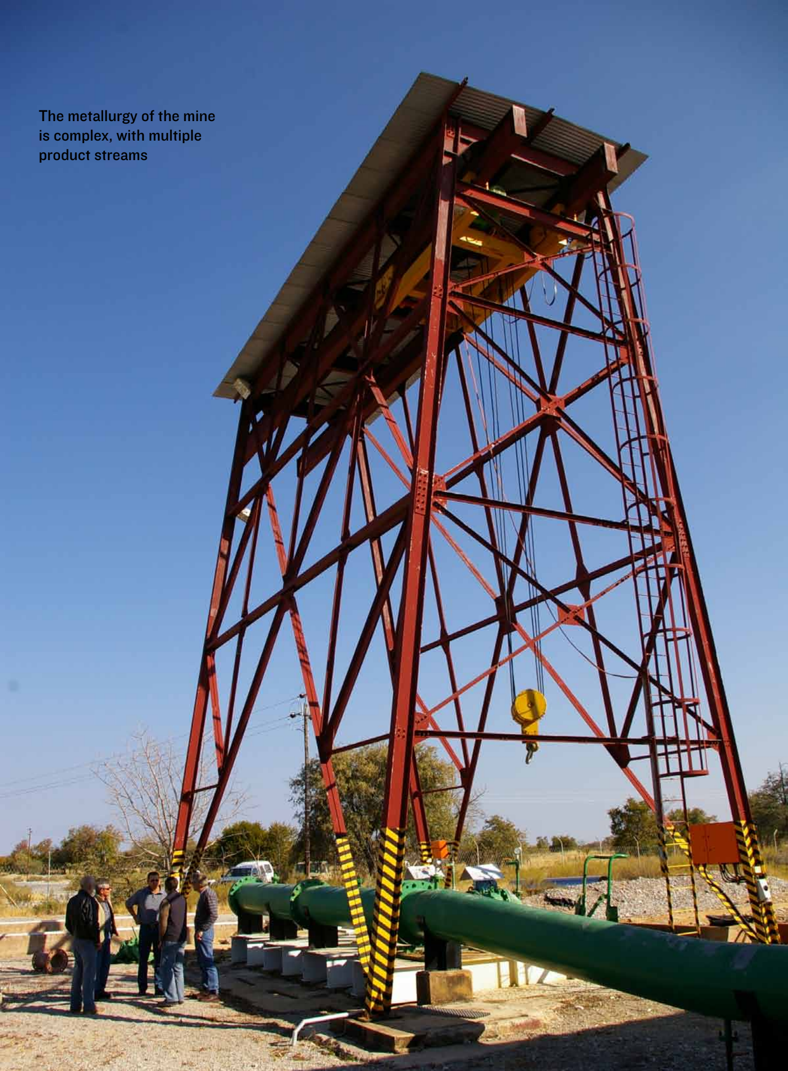
The metallurgy of the mine is complex, with multiple product streams

Located on the southwestern tip of Africa, the dry lands of Namibia provide not only a home to more than 2.3 million inhabitants, but to a bustling mining sector that provides approximately 25 percent of the country's total annual revenue. The fourth largest exporter of non-fuel minerals in Africa, and the world's fourth largest producer of uranium, Namibia is also rich in the likes of gold, tin, tungsten, copper, lead and zinc.