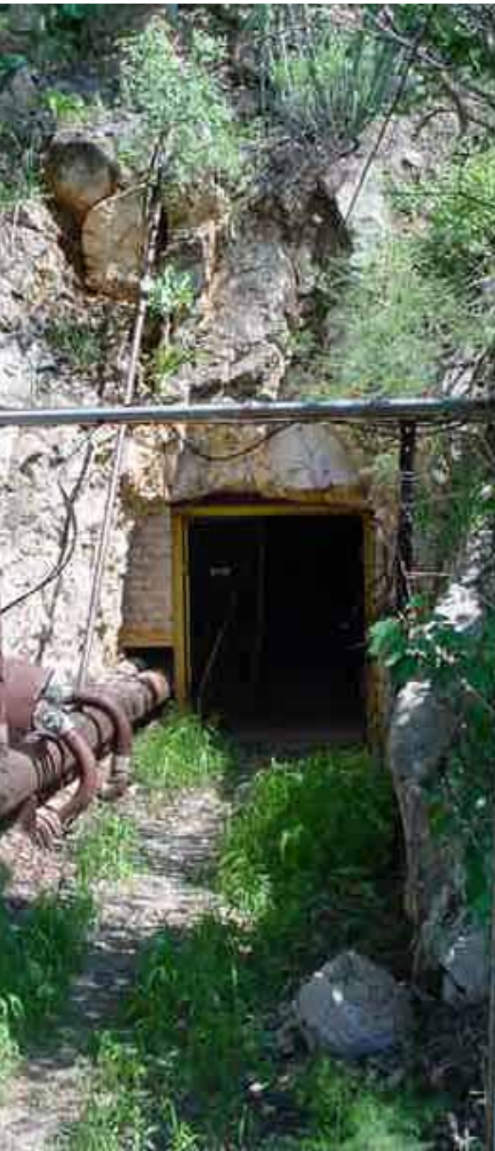
The Berg Aukas project is recognised as a very high grade mine

the terms of its management services agreement, the feasibility study is expected to cost $3 million over the full period. “With the drilling phase now close to completion,” Webster continues, “we are proceeding into the metallurgical phase of the study. Upon determining what kind of flow sheet we will require, we can then complete the feasibility study. This we hope to have achieved by the end of 2013.”