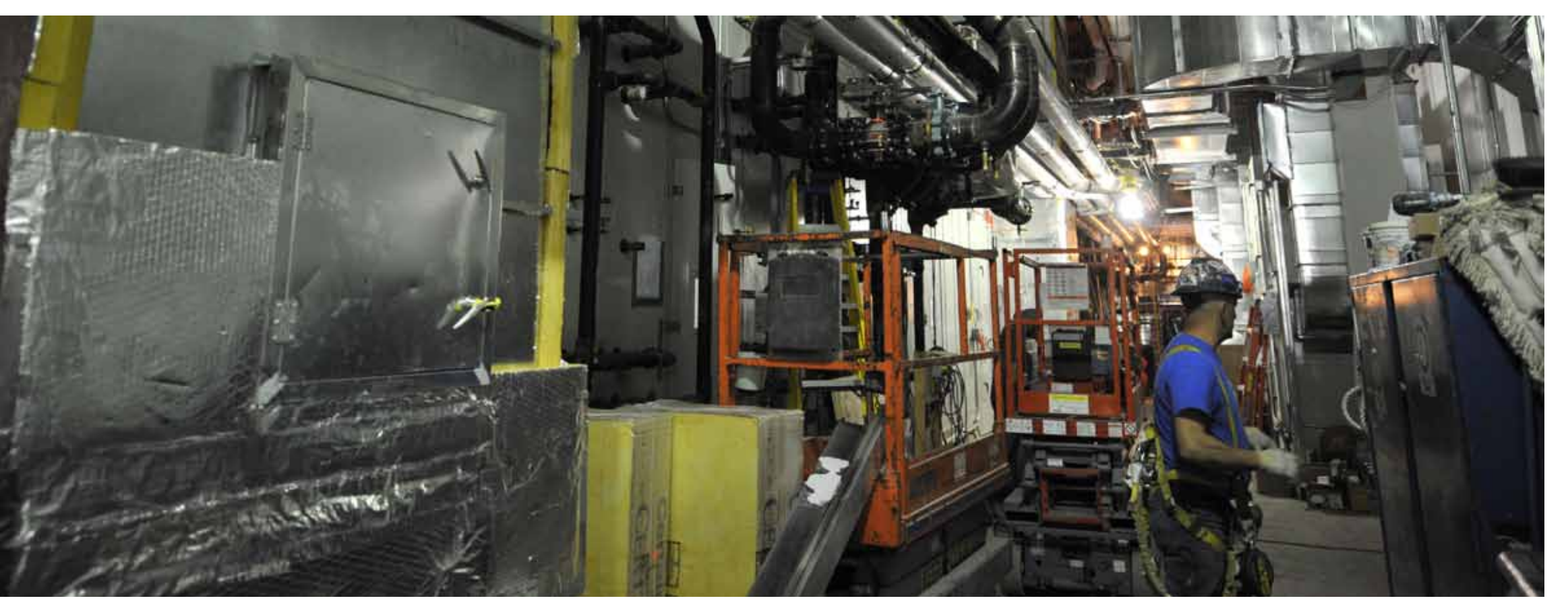
A view inside the CRCHUM

From the point of view of the hospital it was a tremendous advantage to get nearly all of its clinical services; its in-patient services, its diagnostic treatment services, plus all 772 beds and most of its outpatient clinics in one go. Virtually everyone will be able to relocate from the three existing hospitals by 2016, he observes with satisfaction, with the remaining 15 percent of ambulatory clinics delivered by 2020 in Phase 2.