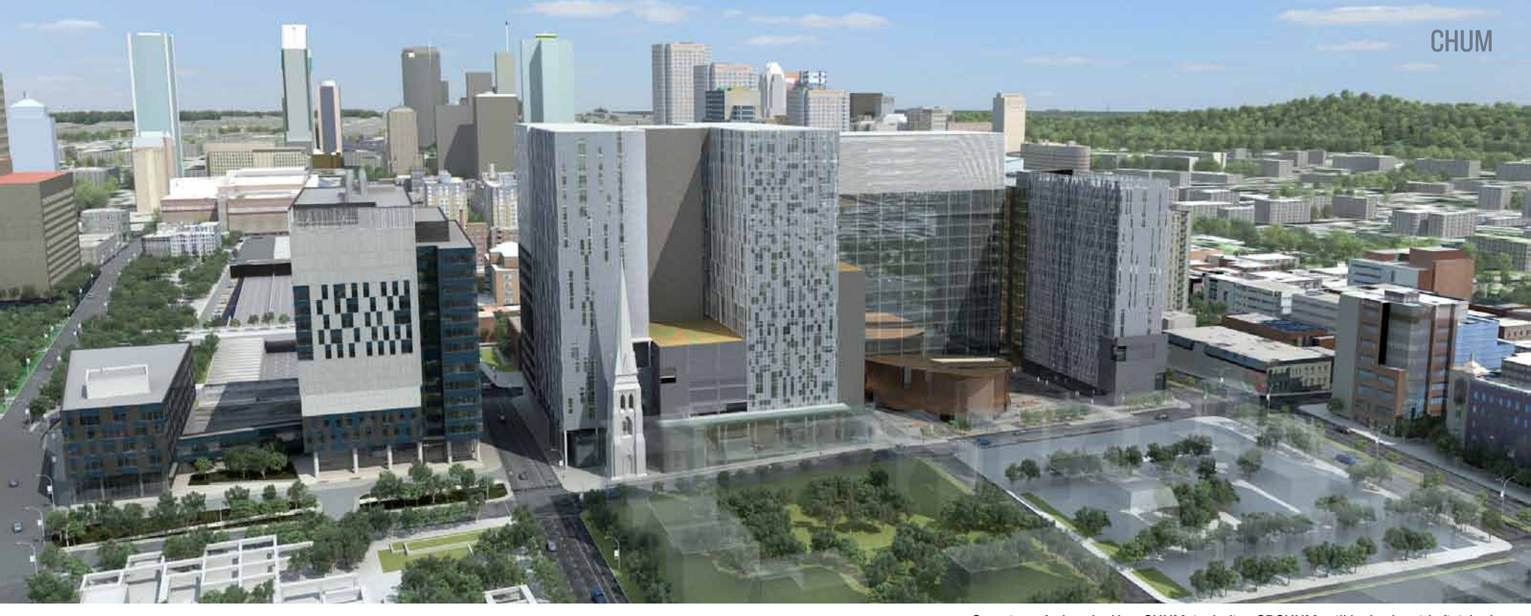
Overview of what the New CHUM, including CRCHUM, will look when it's finished