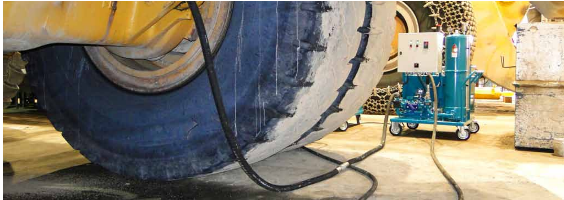
MFU flushing CAT dumper

“Those companies that have tried our products love them,” Caffrey enthuses, “mostly because they help the company meet or exceed today’s standards of oil cleanliness. Our products can filter any viscosity oil, meaning that where a lot of other systems, particularly inline filters, are limited to lower