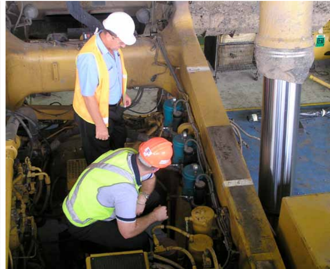
HDU on mining truck, undercarriage