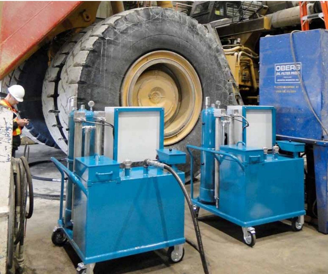
MFU during PM in workshop