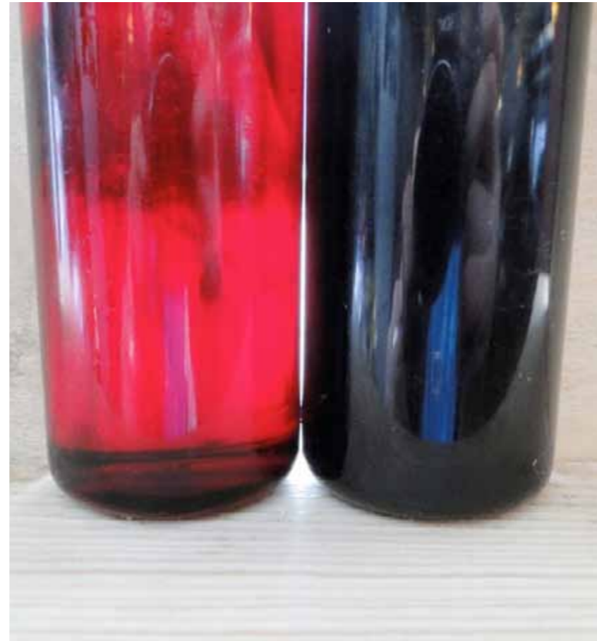
Mobil SHC 680 after 90 min MFU flushing