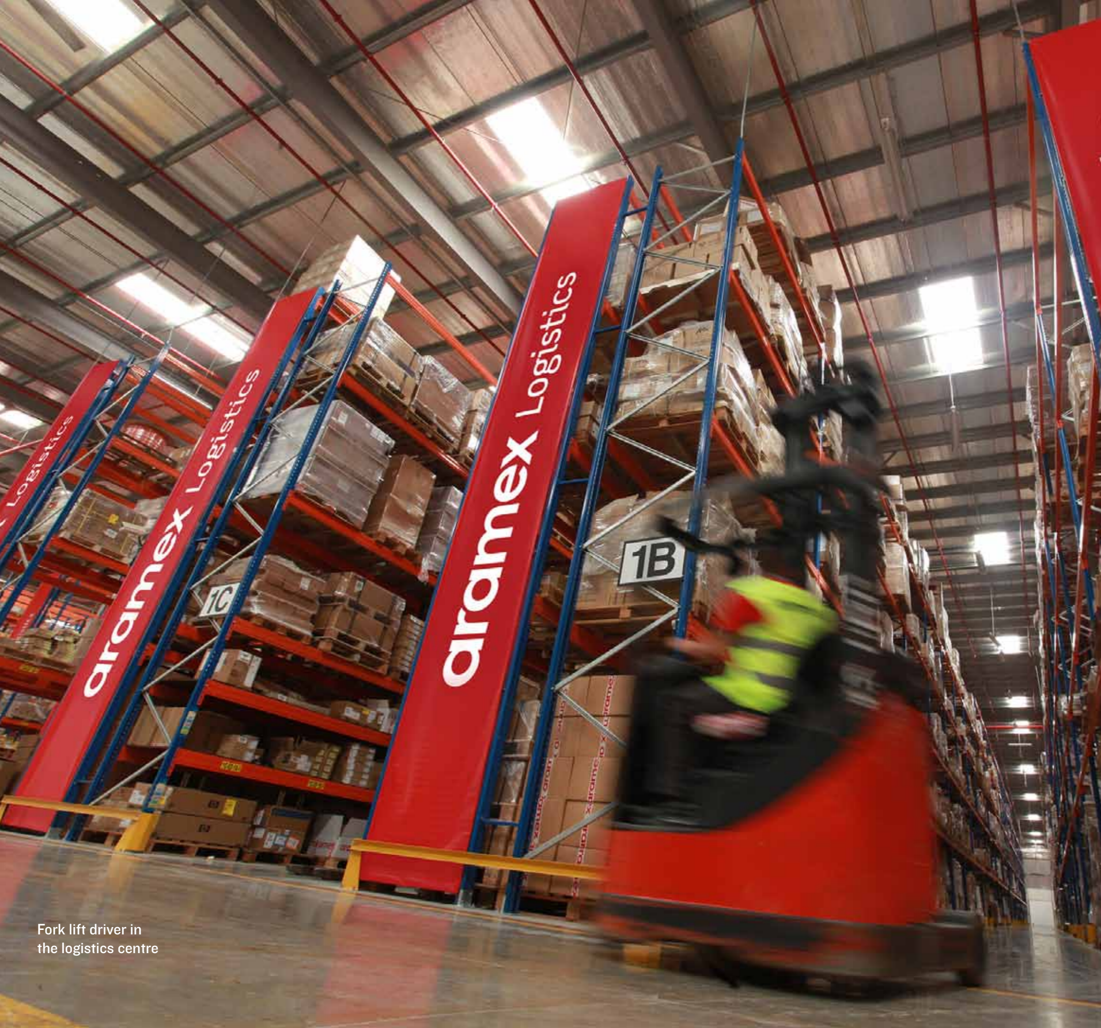
Fork lift driver in the logistics centre

For more information about Berco – an Aramex Company visit: www.bercoexpress.co.za