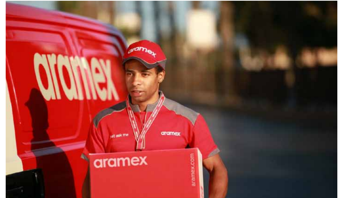
An Aramex courier