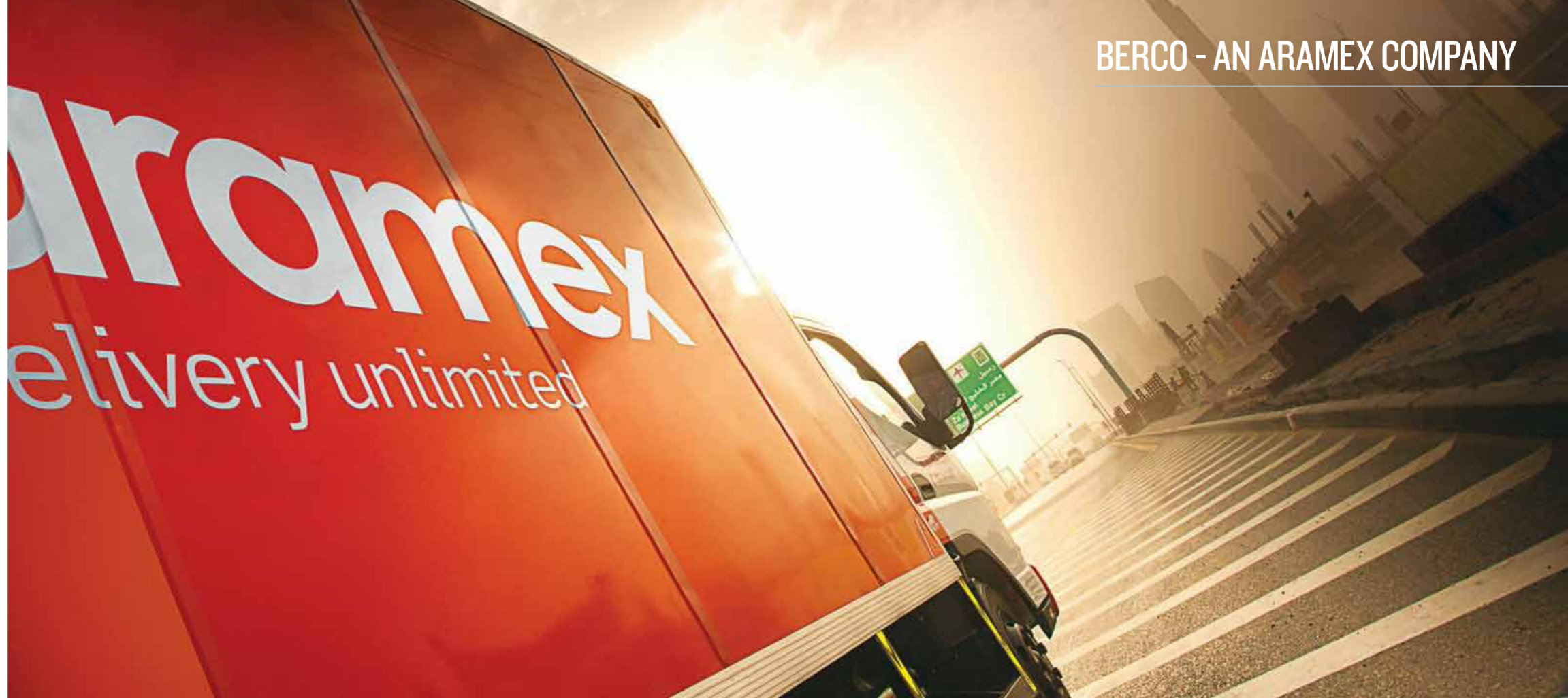
An Aramex delivery vehicle